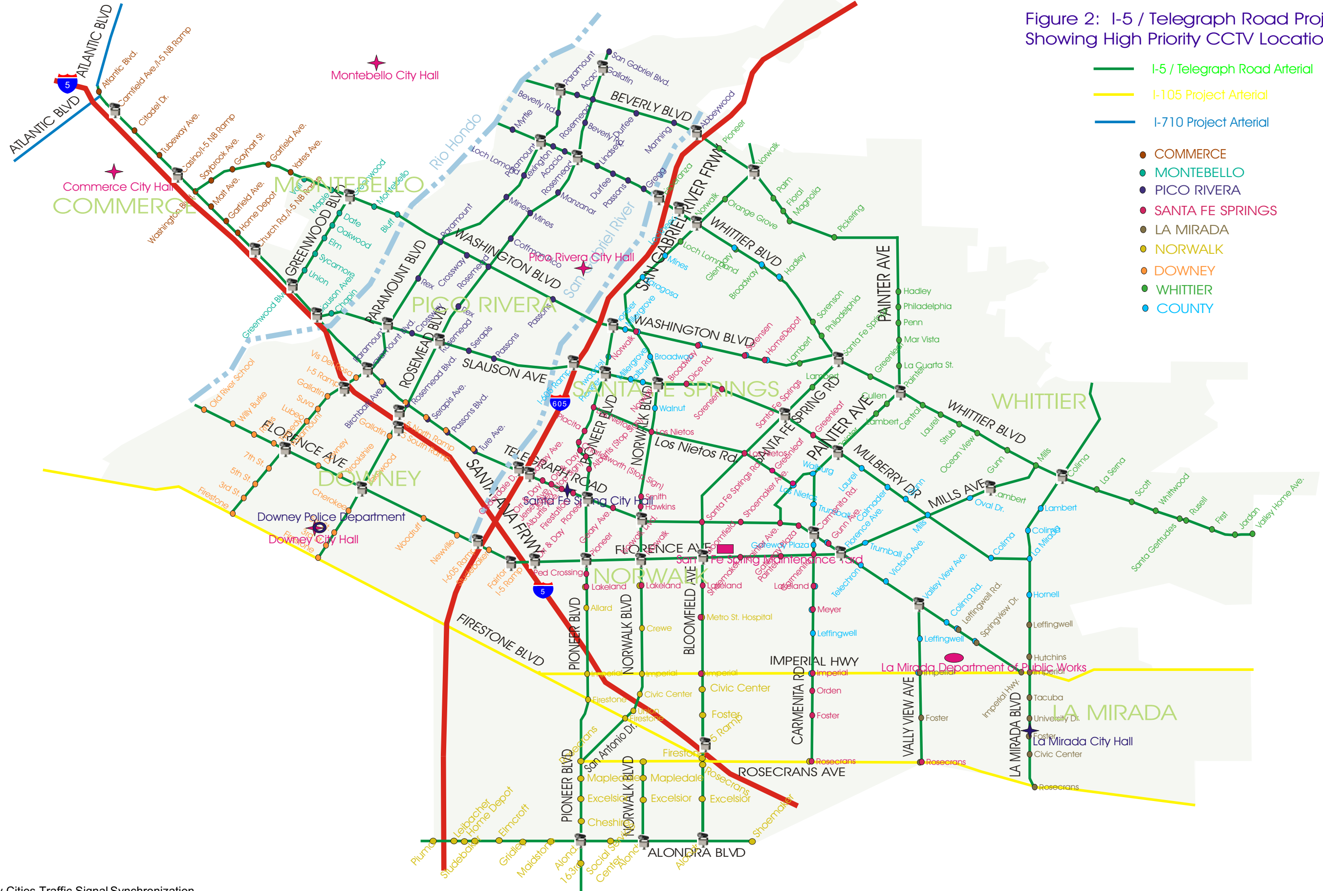
Figure 2: I-5 / Telegraph Road Project Area Showing High Priority CCTV Locations