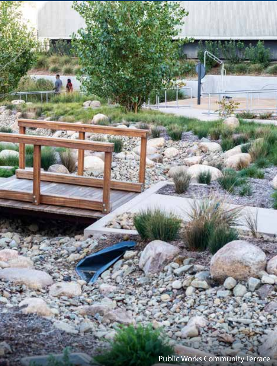
Public Works Community Terrace

Public Contracting and Asset Management (PCAM) provides highly skilled technical services to Public Works' Business Areas through modern infrastructure design, equitable contracting opportunities, and efficient asset management.