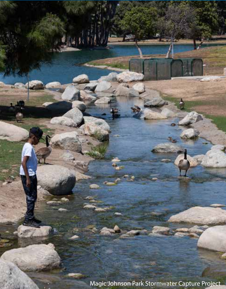
Magic Johnson Park Stormwater Capture Project

The Water Resources Core Service Area (CSA) is responsible for managing stormwater, providing potable water, and ensuring healthy watersheds for the safety and benefit of Los Angeles County communities. It plans, operates, and maintains infrastructure within the Los Angeles County Flood Control and Waterworks Districts through implementation of integrated water resource strategies. The Water Resources CSA Business Plan establishes various strategies to advance regional water resources management practices through the development of enhanced infrastructure, livable communities, and resilient and sustainable resources.