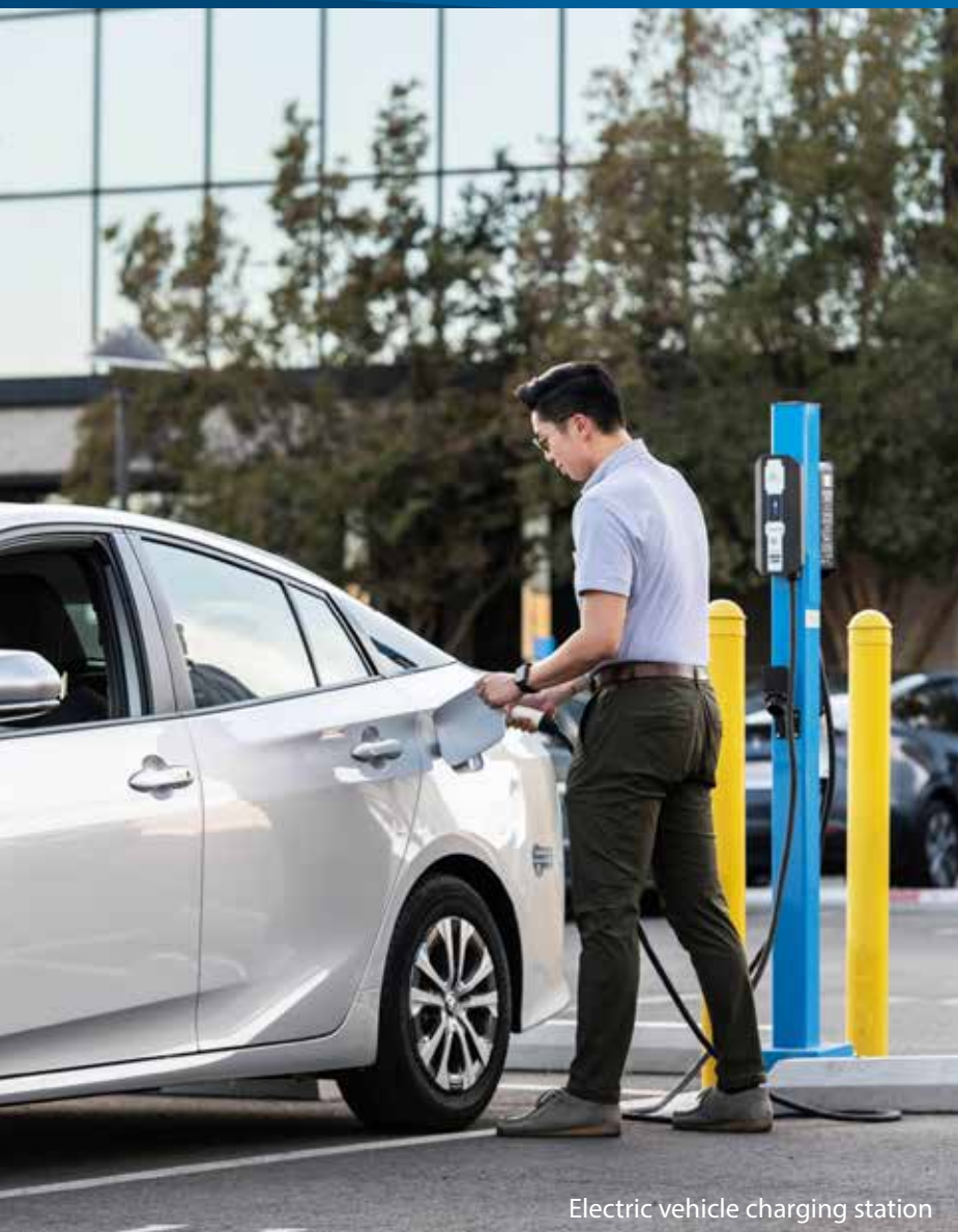
Electric vehicle charging station

The Environmental Services CSA provides solid waste management services, sewer maintenance, and environmental services to our unincorporated communities, contract cities, and the Los Angeles County region. The Environmental Services CSA also supports Public Works' workforce by maintaining a sustainable fleet, protecting employees' health and safety, and reducing risk where possible. The Environmental Services CSA manages solid waste infrastructure consisting of residential waste collection franchises, garbage disposal districts, and a commercial franchise system; manages, operates, and maintains sewer infrastructure within the Consolidated Sewer Maintenance District and the Marina Sewer Maintenance District comprised of sewer lines, sewage pumps, and wastewater control treatment plants; and is also responsible for Public Works' fleet, which includes on- and off-road vehicles and equipment. The Environmental Services CSA Business Plan establishes various strategies centered around equity, resiliency, and sustainability to pursue a waste-free future, optimized sewer infrastructure, and a carbon neutral fleet that will improve the environmental well-being of our communities.