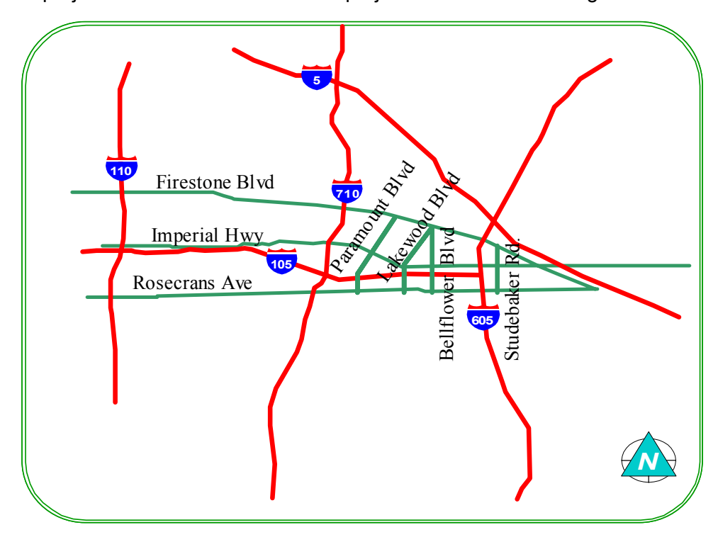
Figure 1-1: I-105 Corridor Project Area

Bellflower, Compton, Downey, La Mirada, Lynwood, Norwalk, Paramount, Santa Fe Springs, and South Gate. The two regional jurisdictions are Los Angeles County (LA County) and Caltrans District 7 (Caltrans D7). There are a total of 194 signalized intersections within the I-105 Corridor project area. The I-105 Corridor project area is shown in Figure 1-1.