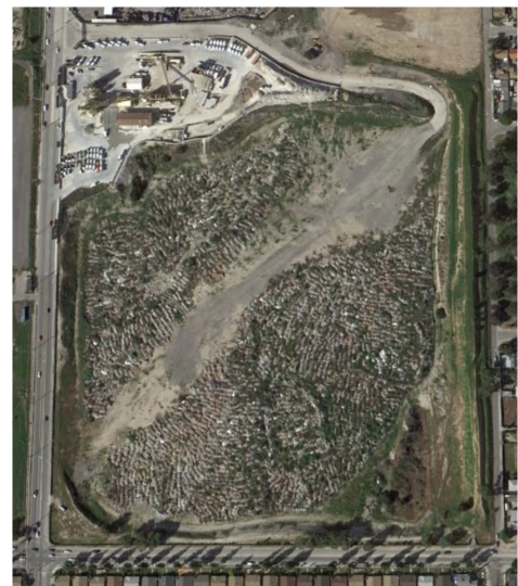
EXISTING LANDFILL SITE

The total cost for design and construction is estimated at $52 million and will be funded by the Los Angeles County Flood Control District, the Los Angeles Department of Water and Power, and Proposition O grant funds. The Project is currently in the design phase .