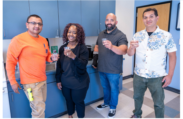
Field Service Workers, Customer Service Representatives and Engineers work together to provide customers with safe drinking water.