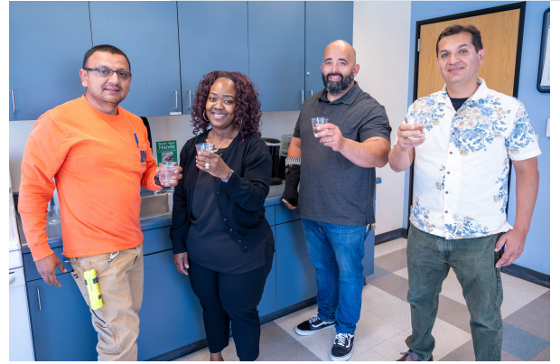
Field Service Workers, Customer Service Representatives and Engineers work together to provide customers with safe drinking water.