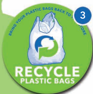
Employee Button (3")

Visit www.plasticbagrecycling.org for information on how to order materials