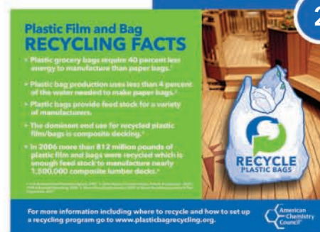
Recycling Facts Decal (7" x 5")