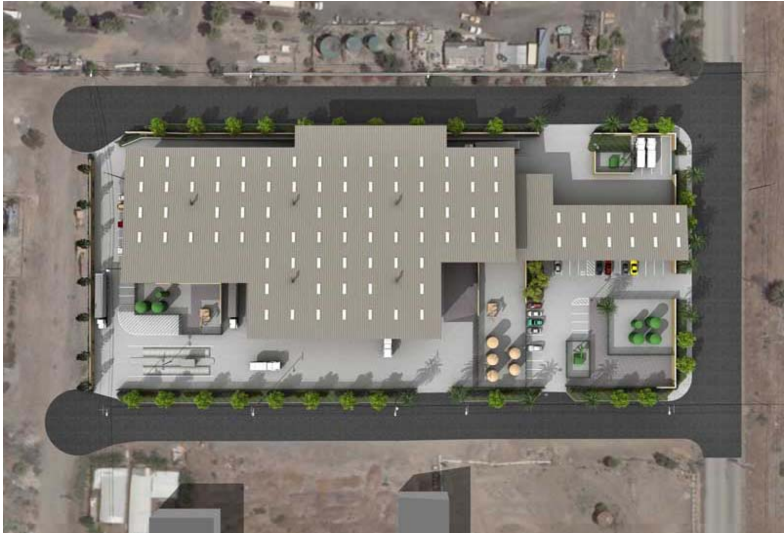
Overhead view of the proposed facility