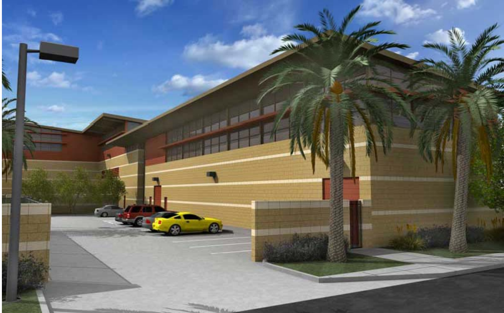
View from California Ave. facing west