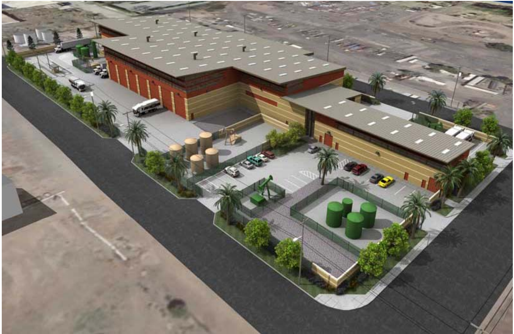
View from Patterson St. and California Ave. facing northwest