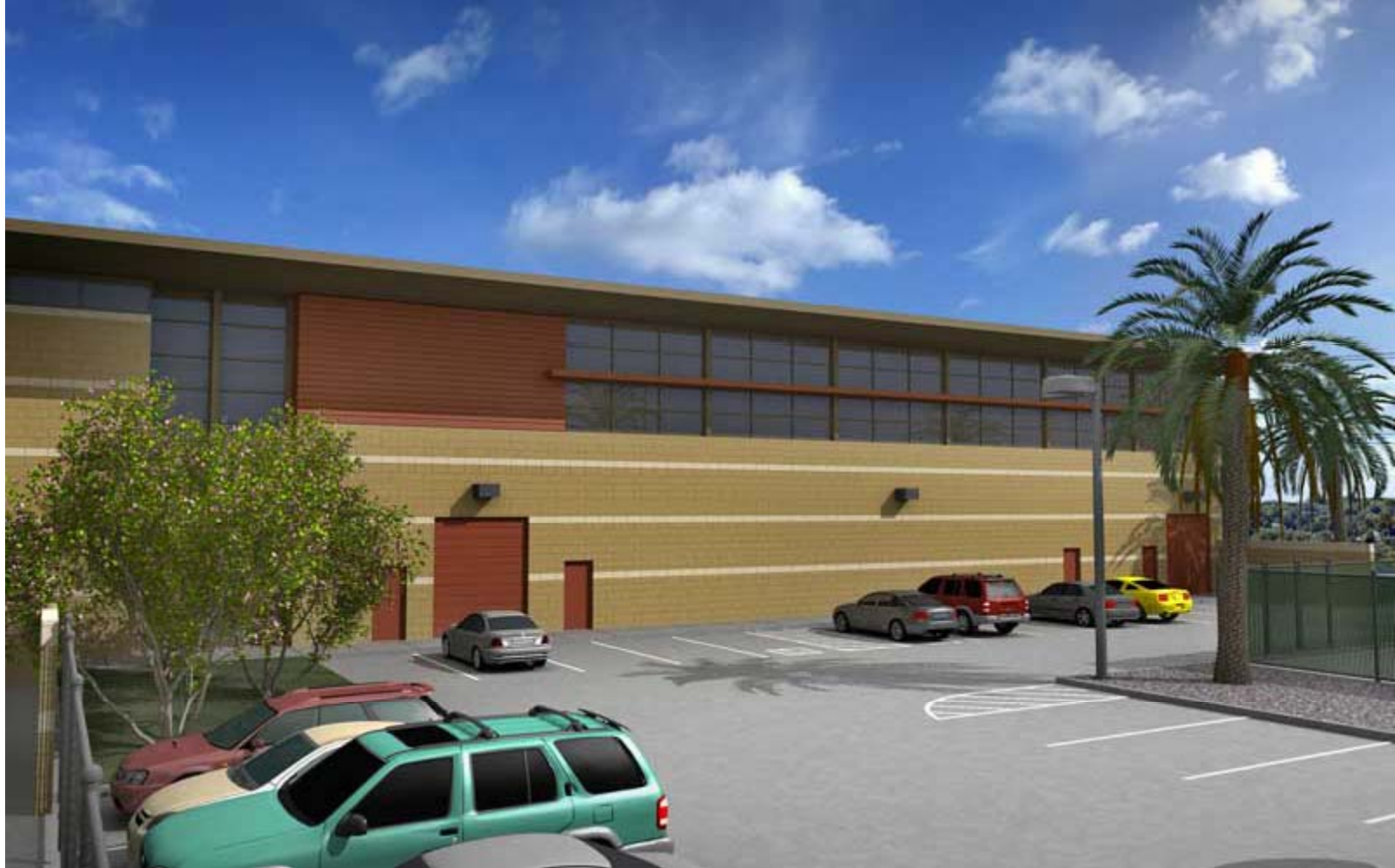
View from Patterson St. facing north