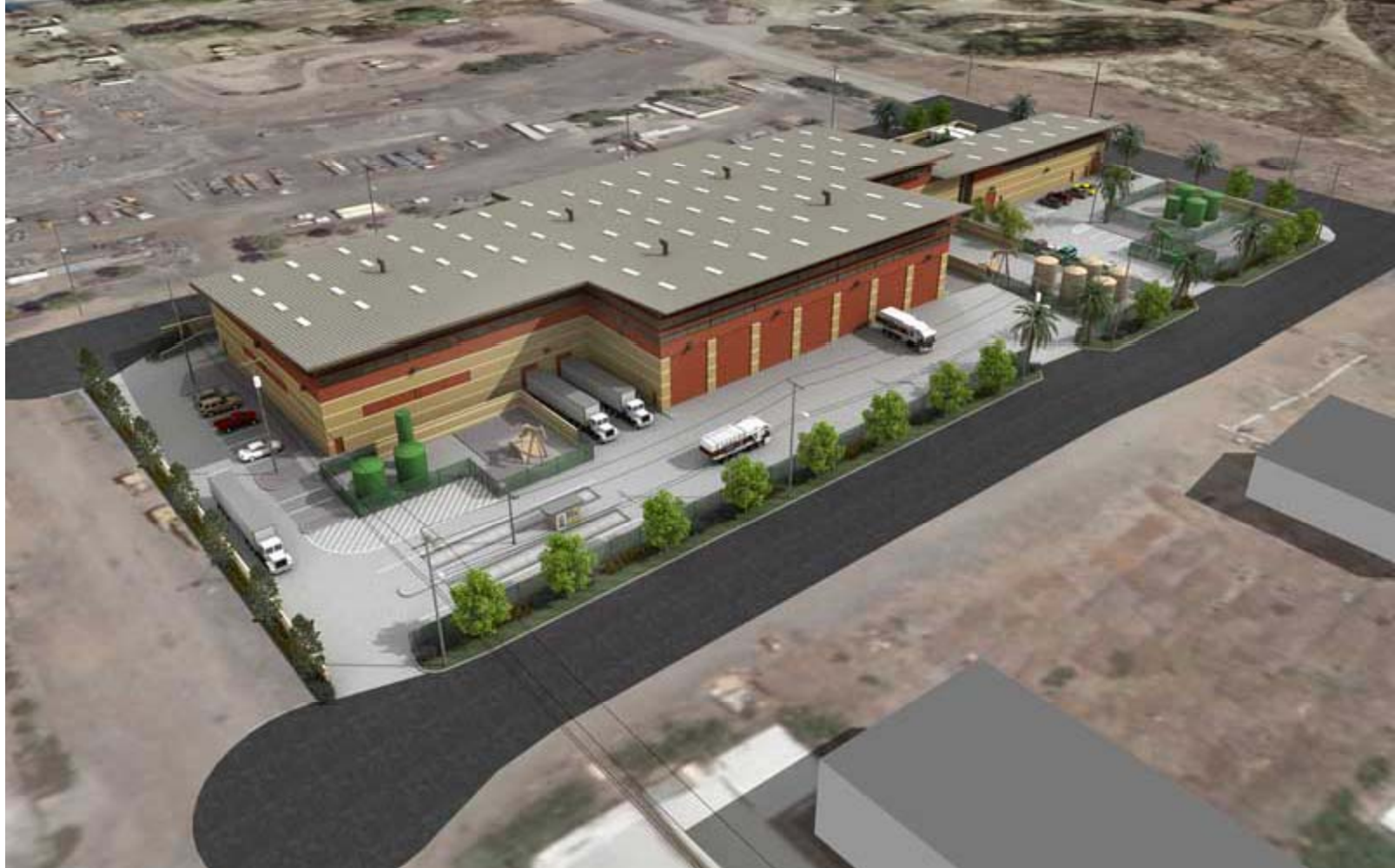
View from Patterson St. and Olive Ave. facing northeast