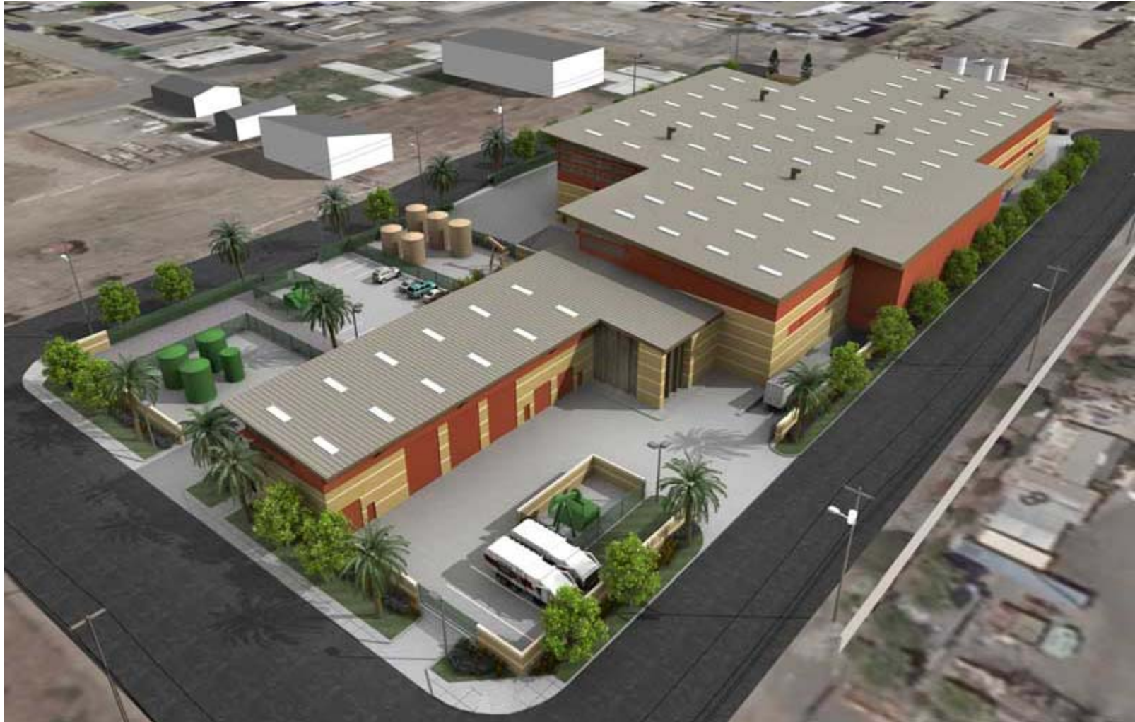
View from California Ave. and 28th St. facing southwest