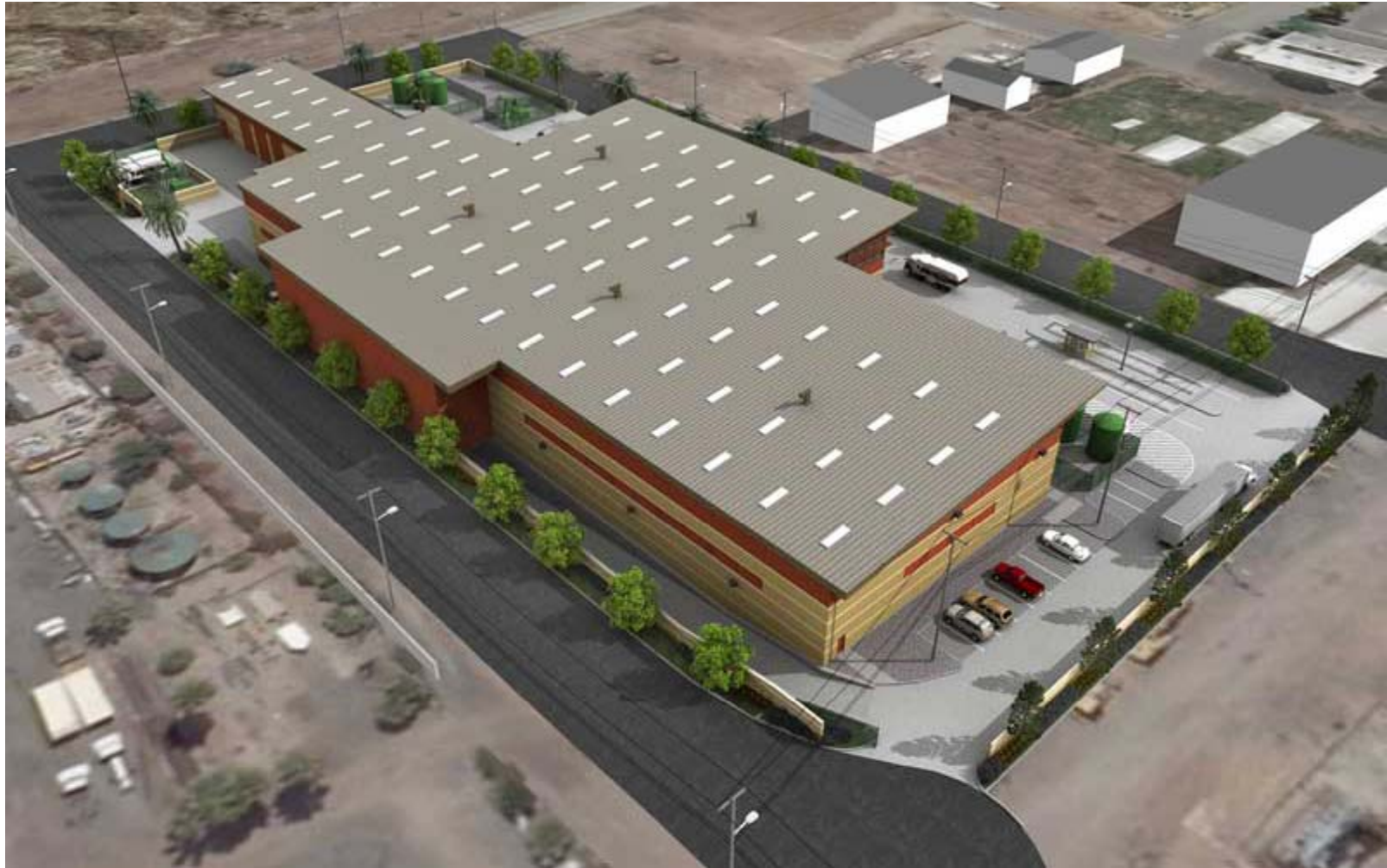
View from 28th St. and Olive Ave. facing southeast