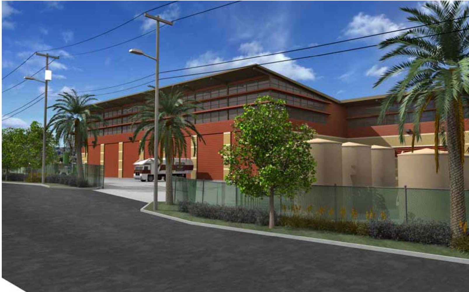
View from Patterson St. facing northwest