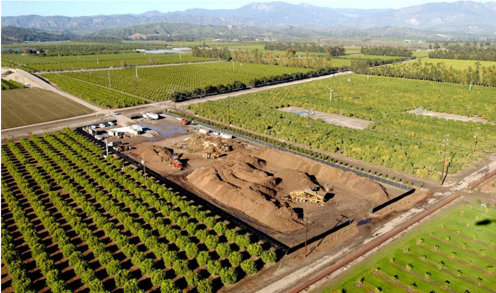
Agromin Composting Facility in Ventura County