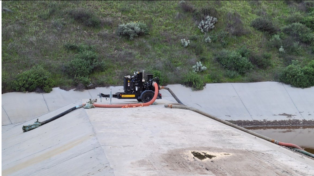
Photograph 2 (March 11, 2024 email received by Los Angeles Water Board) Pump equipment set up mounted on top of the south detention basin spillway structure.