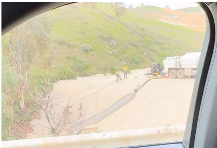
Photograph 4 (March 16, 2024 Complaint, COMP-60321) Photograph showing active pumping and discharge from either the south detention basin or the vacuum truck.