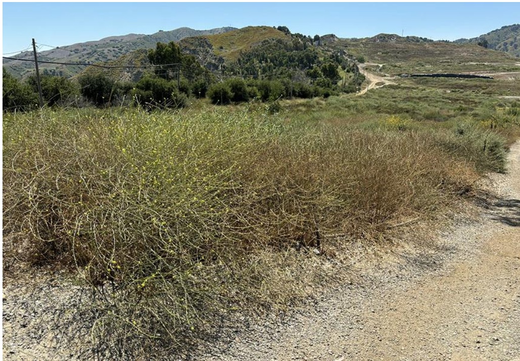
Shortpod Mustard at northeast end of Deck C