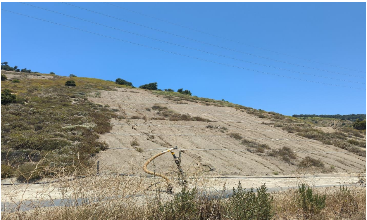
Photograph 2. Facing northwest at the northern portion of the County-Side Sage Mitigation Area where plant growth has been problematic due to poor soil conditions (June 19, 2024).