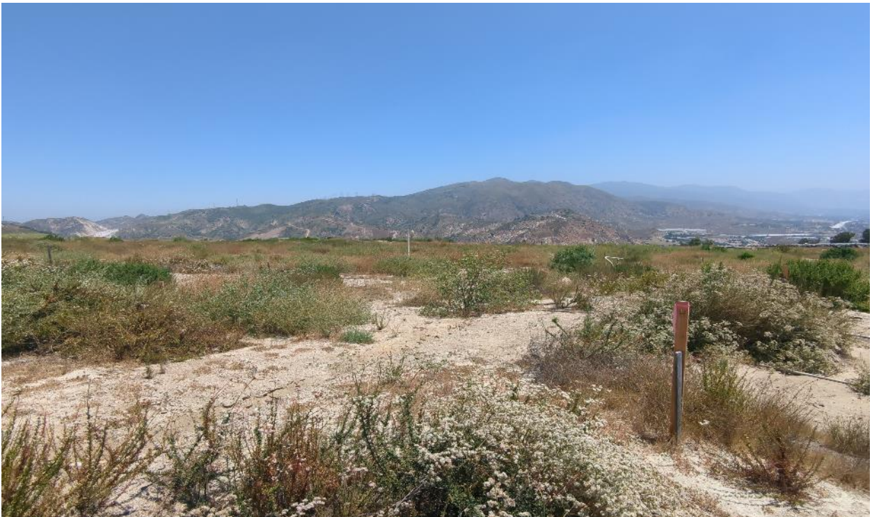
Photograph 8. Quadrat H facing northeast from southwest corner (June 19, 2024).