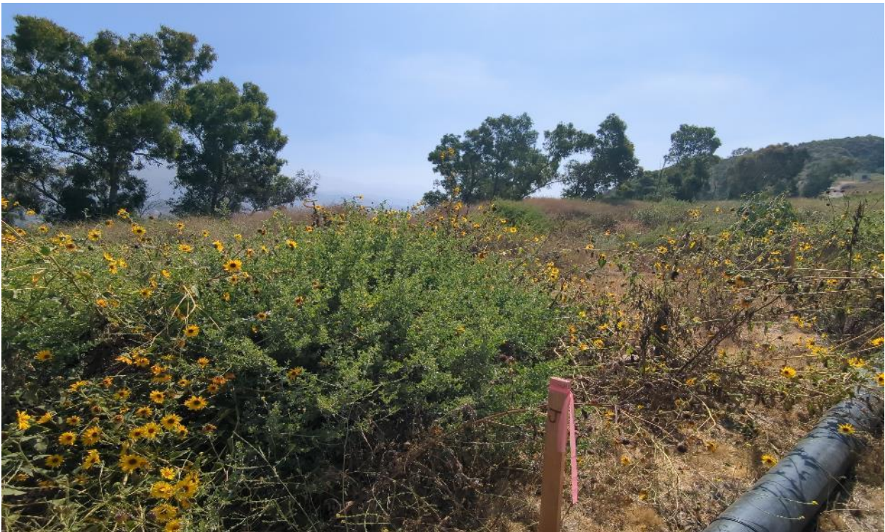
Photograph 10. Quadrat J facing northeast from southwest corner (June 19, 2024).