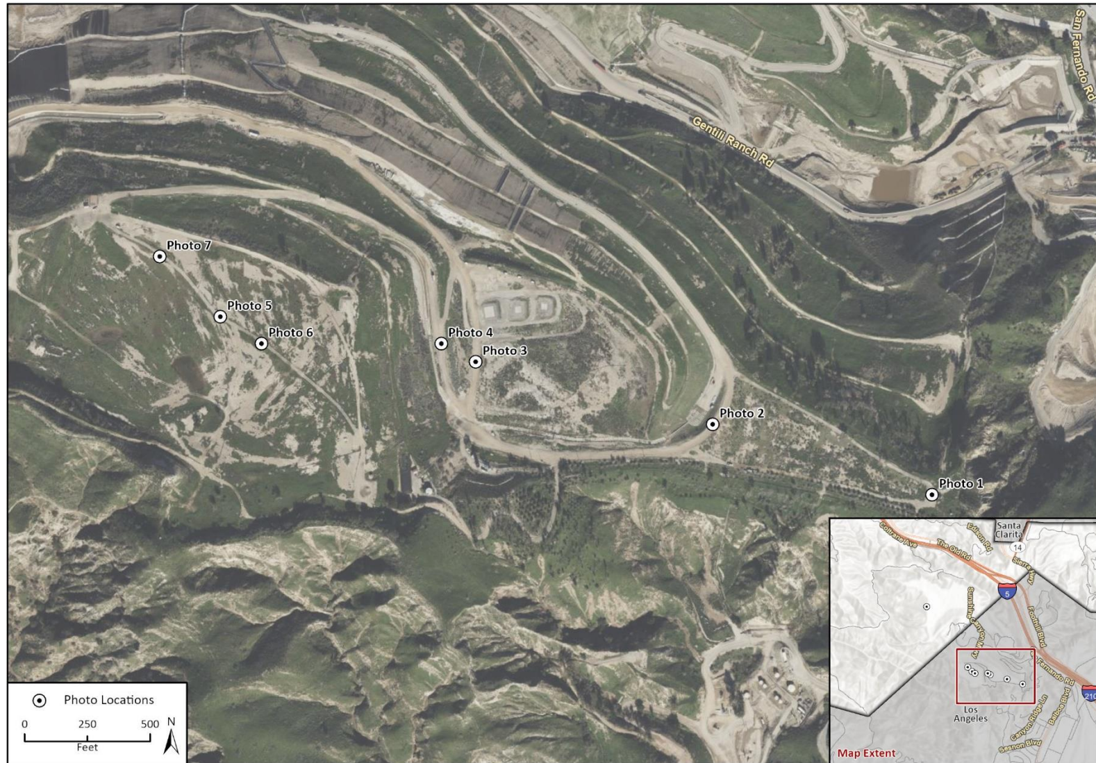
Figure 1 Photograph Locations

Photo Locations have been georeferenced and are approximate locations.