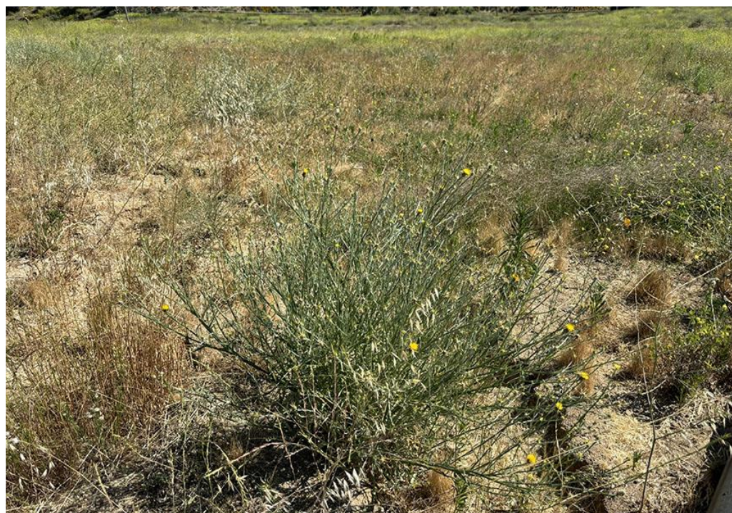
Covered in Yellow Star Thistle ( Centaurea solstitialis ) and Shortpod Mustard