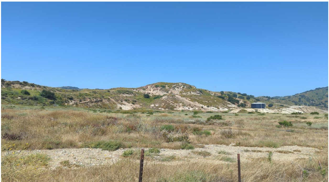
Photograph 6. Facing southwest at the Upper Deck. This area is primarily dominated by wild oats, brome grasses, redstem filaree, and short podded mustard (June 19, 2024).