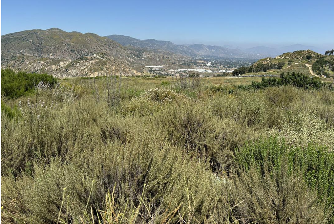
Healthy stand of Venturan CSS species growing on Deck B