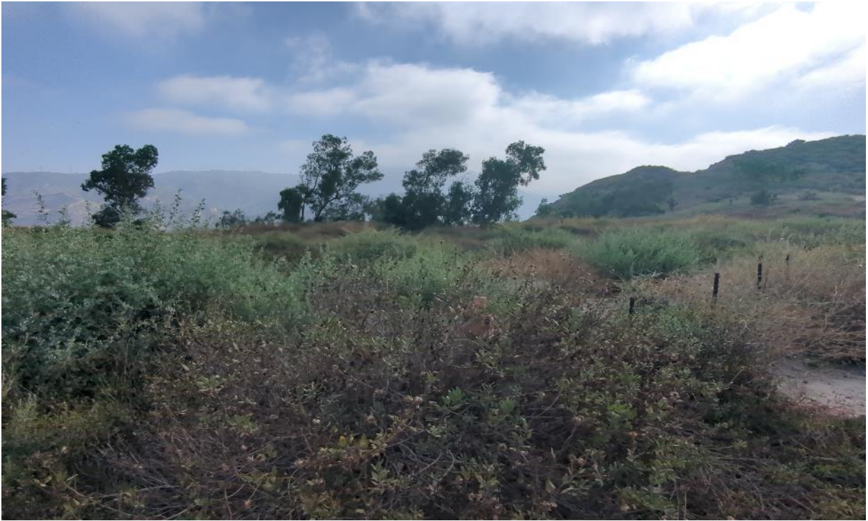
Photograph 3. Quadrat C facing northeast from southwest corner (June 19, 2024).