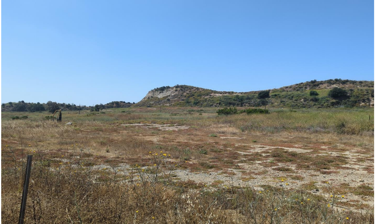
Photograph 7. Facing southeast at the western portion of the Upper Deck. This area is dominated by short podded mustard, Australian saltbush, and Russian thistle (June 19, 2024).