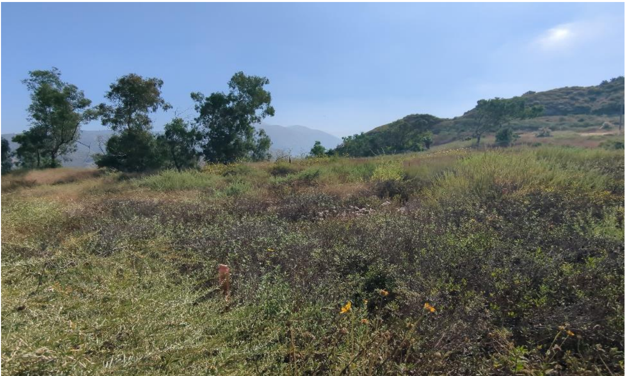
Photograph 8. Quadrat H facing northeast from southwest corner (June 19, 2024).