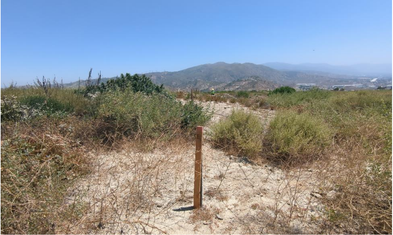
Photograph 5. Quadrat E facing northeast from southwest corner (June 19, 2024).