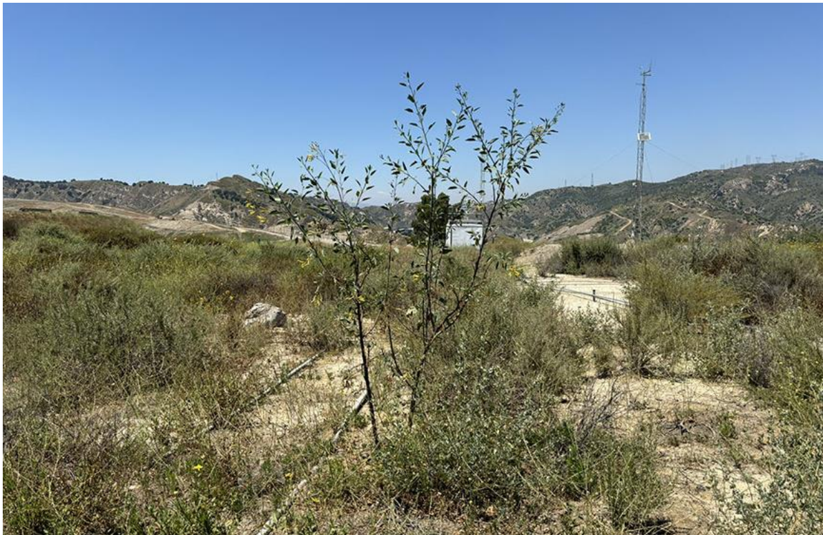
Tree Tobacco ( Nicotiana glauca )