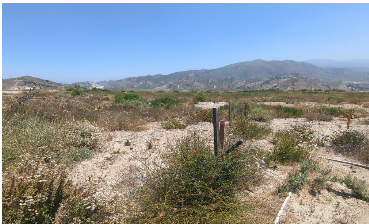
Photograph 4. Quadrat D facing northeast from southwest corner (June 19, 2024).