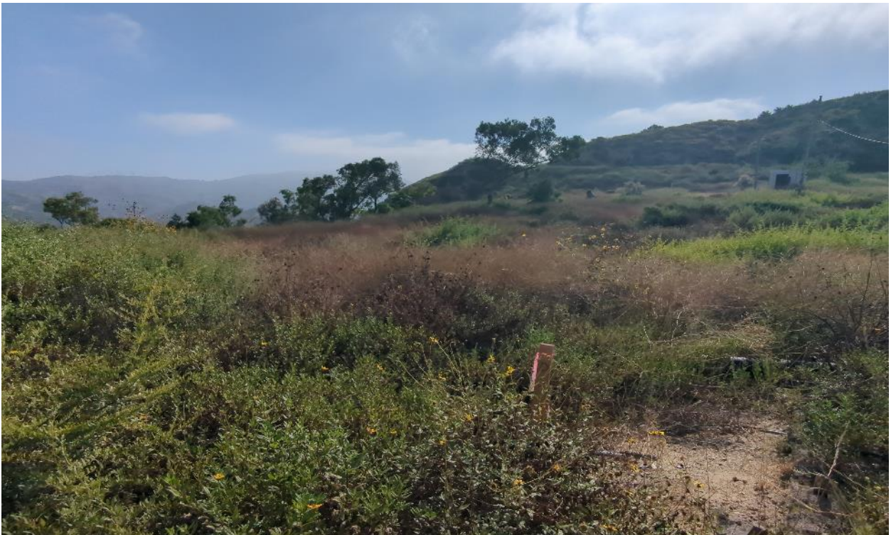
Photograph 4. Quadrat D facing northeast from southwest corner (June 19, 2024).