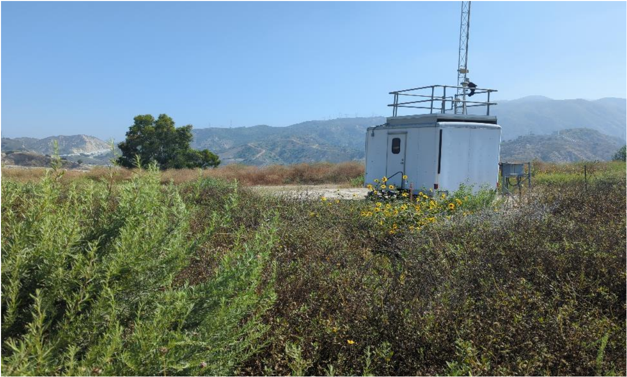
Photograph 9. Quadrat I facing northeast from southwest corner (June 19, 2024).