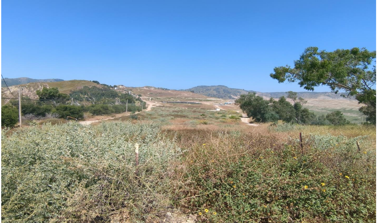
Photograph 1. Facing west at Lower Deck. View of eastern limits dominated by Atriplex spp. and California sunflower (June 19, 2024).