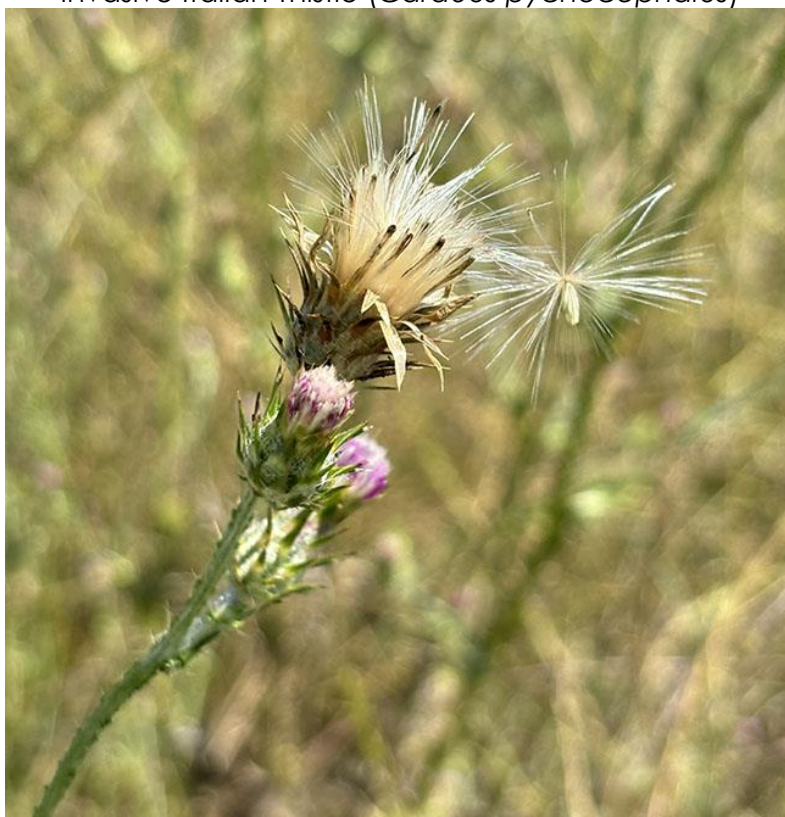
Italian Thistle species flower and seed