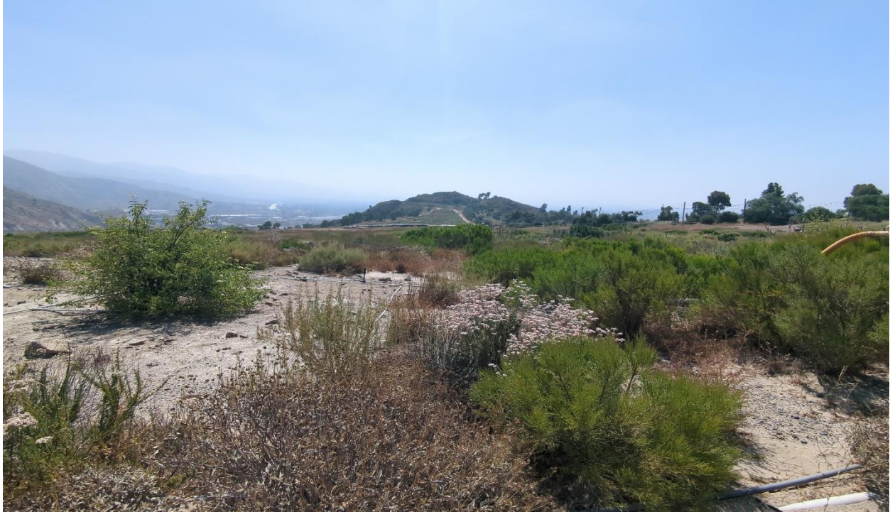
Photograph 3. Facing east at the Middle Deck from western boundary (June 19, 2024).