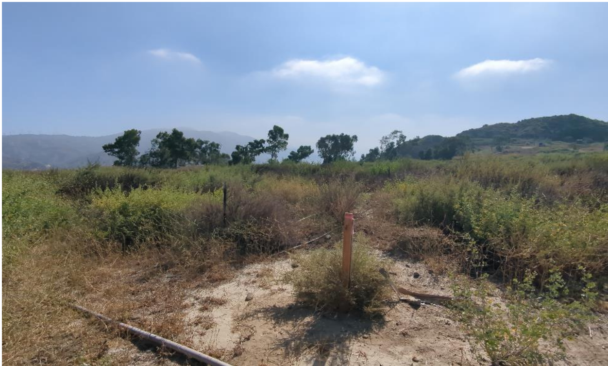
Photograph 6. Quadrat F facing northeast from southwest corner (June 19, 2024).