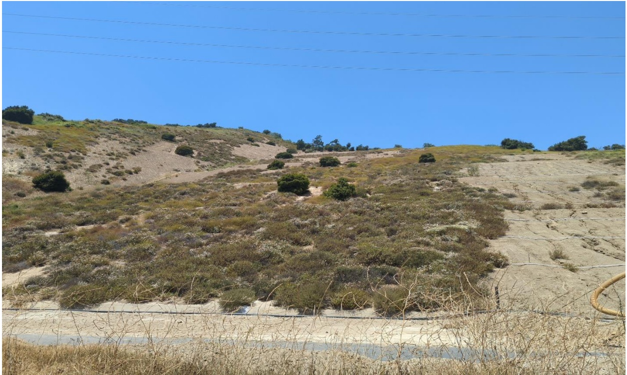
Photograph 1. Facing southwest at the County-Side Sage Mitigation Area (June 19, 2024).