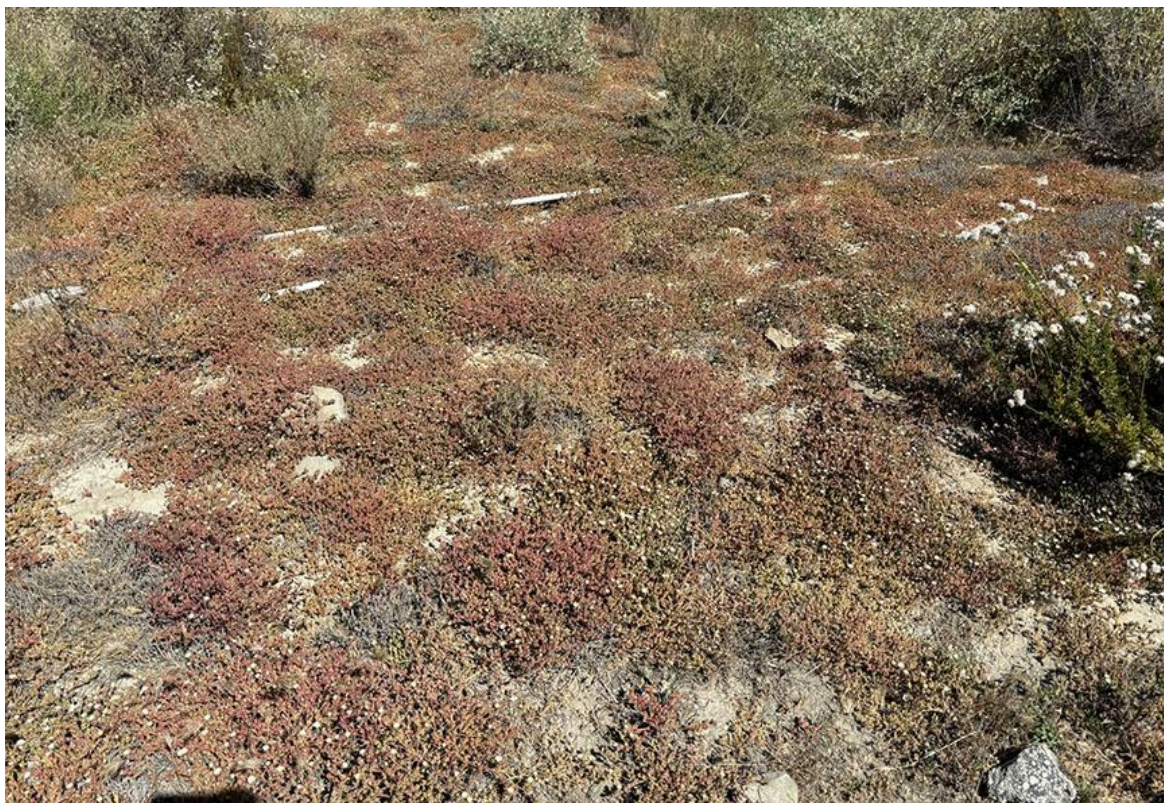
Slenderleaf Iceplant ( Mesembryanthemum nodiflorum ) beginning summer dormancy