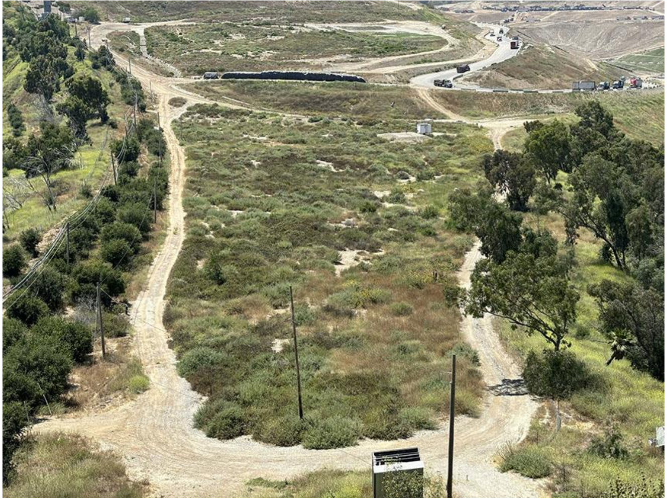
Deck C view to the west with Deck B in background