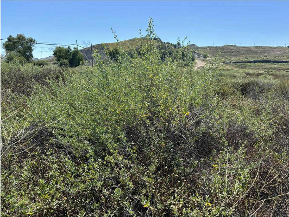
Native Saltbush ( Atriplex species) growing aggressively