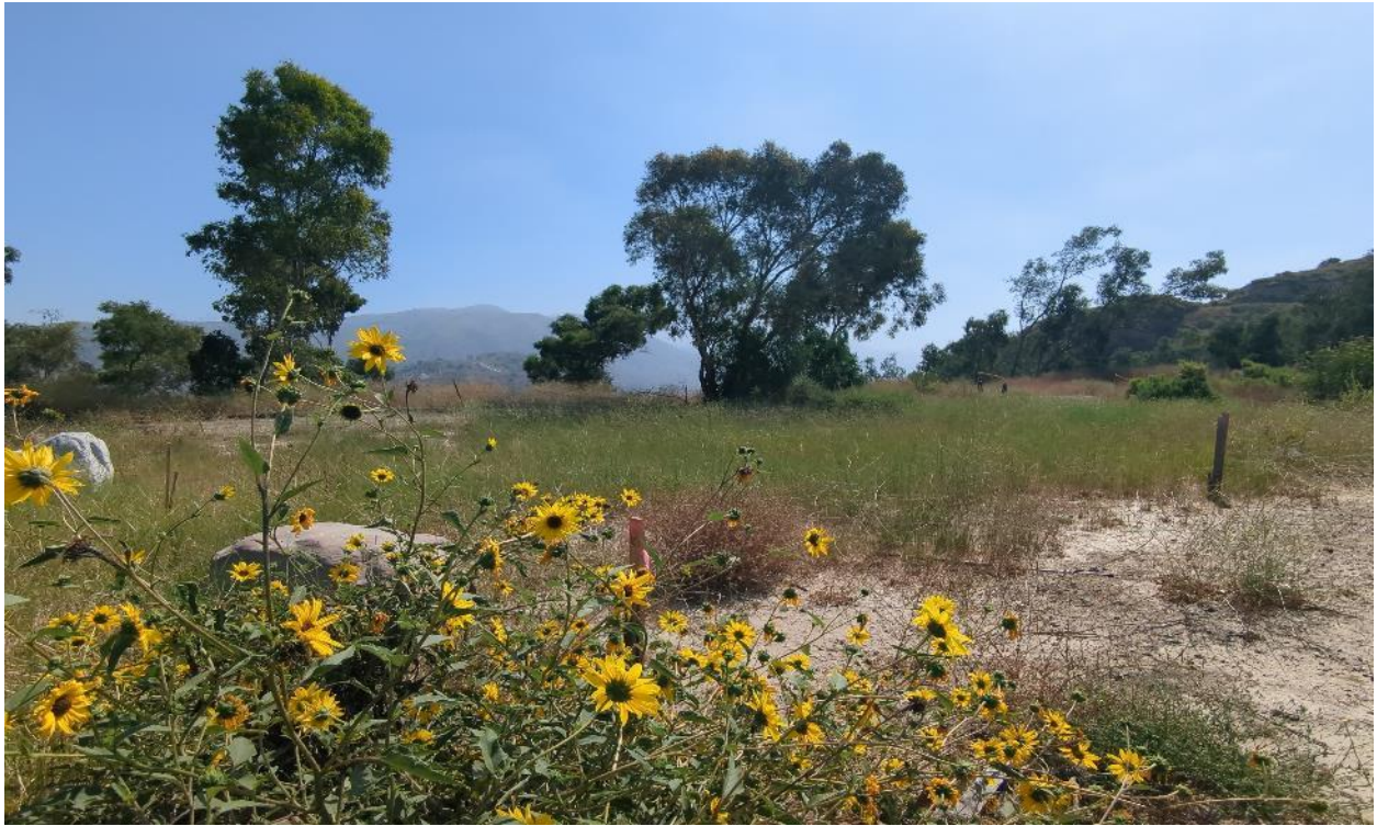
Photograph 11. Quadrat K facing northeast from southwest corner (June 19, 2024).