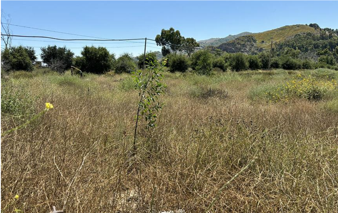
Tree Tobacco ( Nicotiana glauca ) in field of invasive Shortpod Mustard