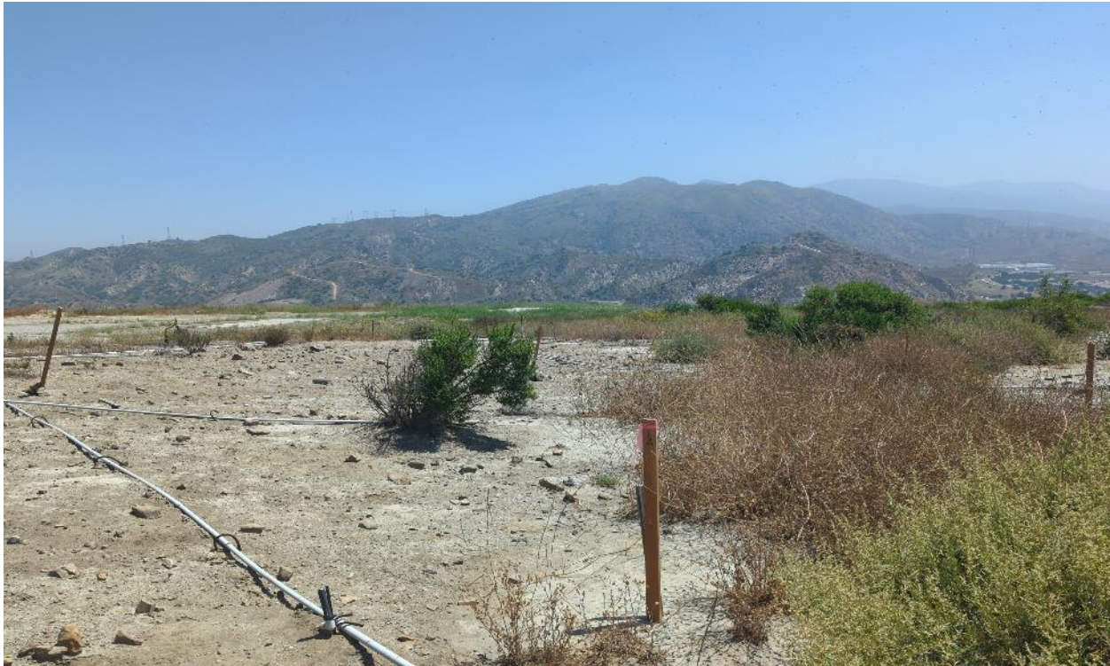
Photograph 1. Quadrat A facing northeast from southwest corner (June 19, 2024).