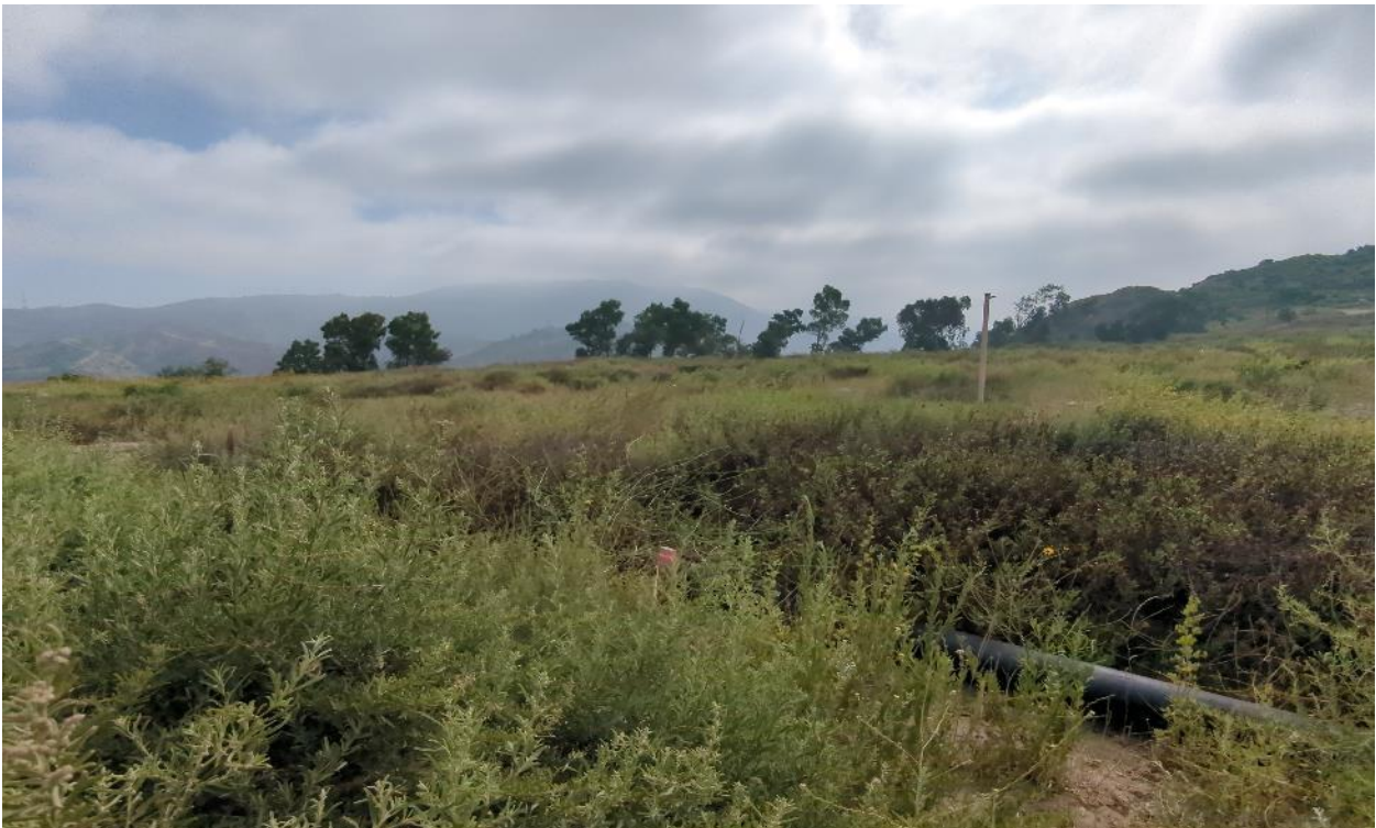
Photograph 2. Quadrat B facing northeast from southwest corner (June 19, 2024).