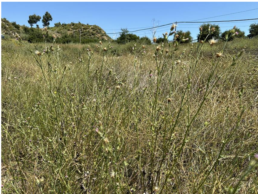
Invasive Italian Thistle ( Carduus pycnocephalus )