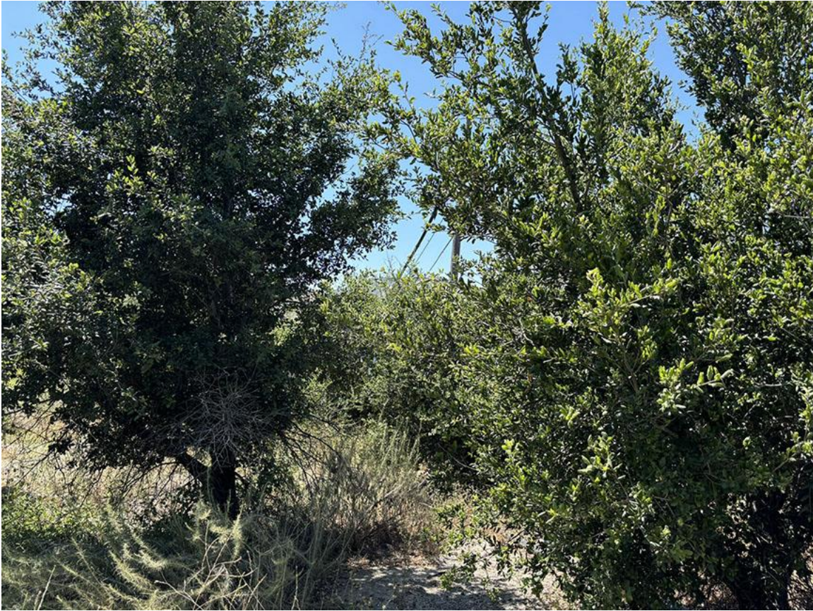
PM10 Berm Oak Trees ( Quercus agrifolia )