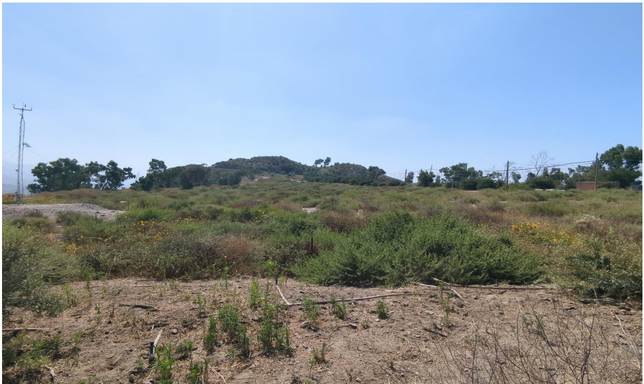
Photograph 2. Lower Deck from western boundary (June 19, 2024).