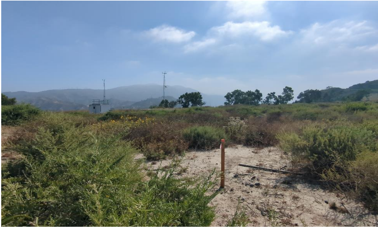
Photograph 5. Quadrat E facing northeast from southwest corner (June 19, 2024).