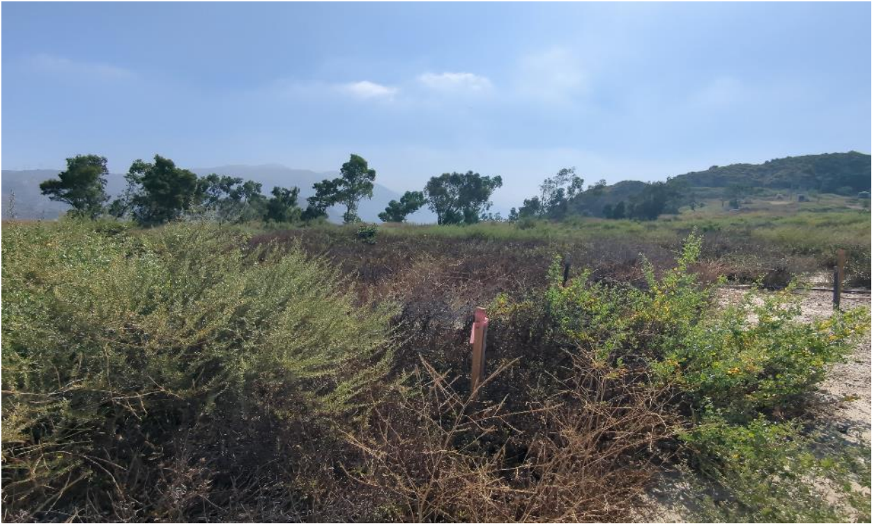
Photograph 7. Quadrat G facing northeast from southwest corner (June 19, 2024).