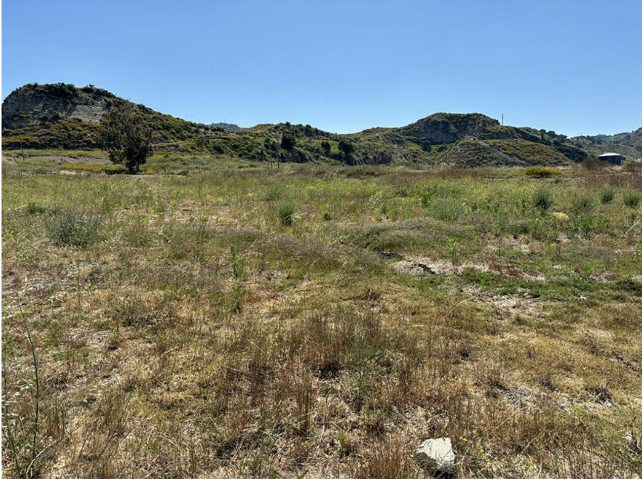
Deck A graded fill site (from 2023)