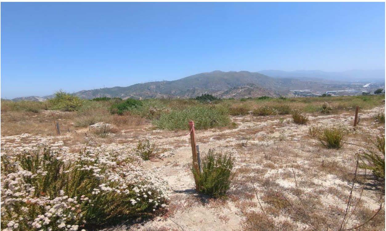
Photograph 6. Quadrat F facing northeast from southwest corner (June 19, 2024).