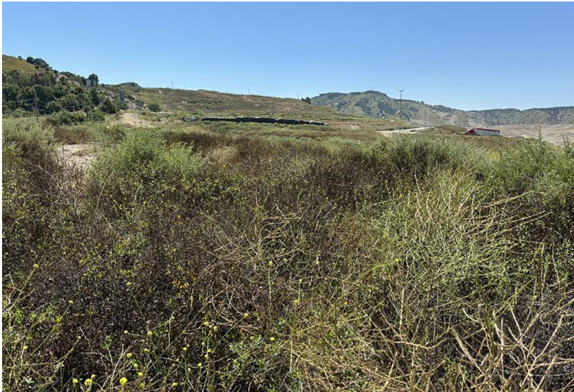
Coast Sunflower ( Encelia californica ) going summer drought deciduous