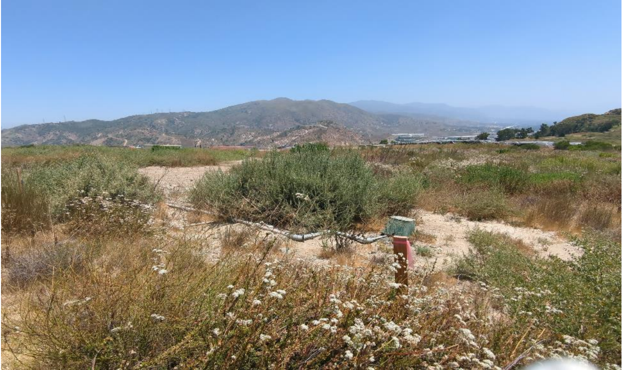
Photograph 9. Quadrat I facing northeast from southwest corner (June 19, 2024).