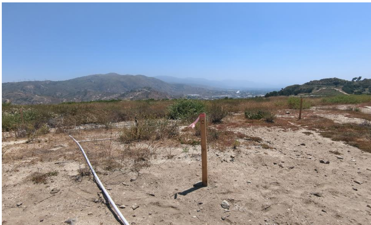
Photograph 3. Quadrat C facing northeast from southwest corner (June 19, 2024).