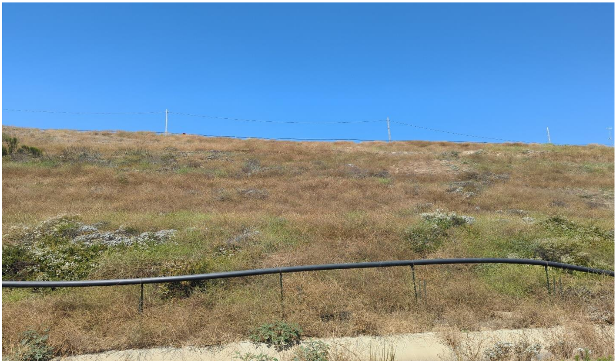
Photograph 4. Facing west at the easterly-facing slope located between the Middle and Upper Decks. The vegetation on the slopes between the Upper Deck is dominated by California buckwheat (currently vegetative) and non-native annual grasses (June 19, 2024).