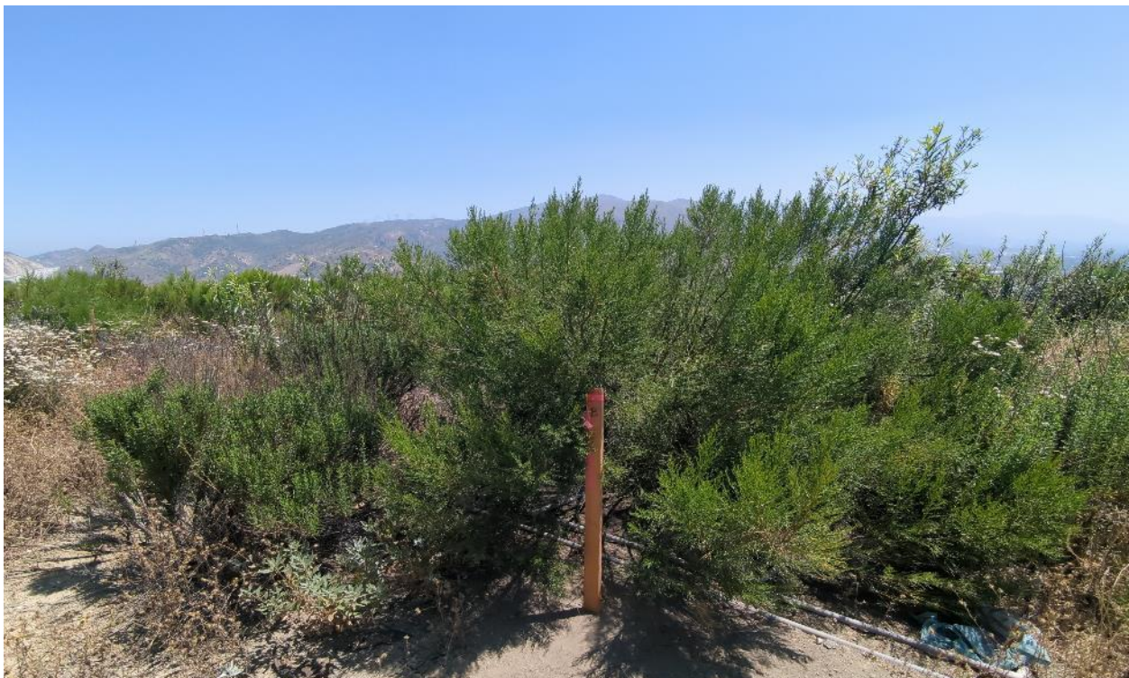
Photograph 2. Quadrat B facing northeast from southwest corner (June 19, 2024).