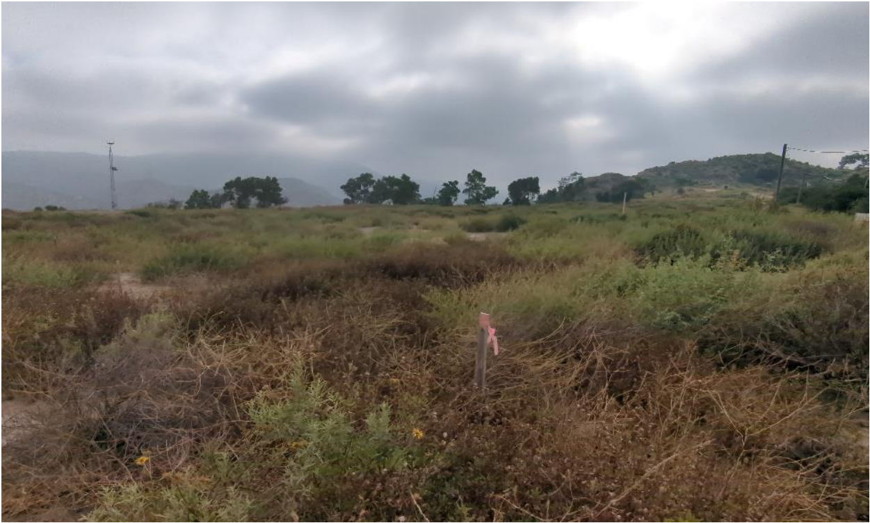
Photograph 1. Quadrat A facing northeast from southwest corner (June 19, 2024).