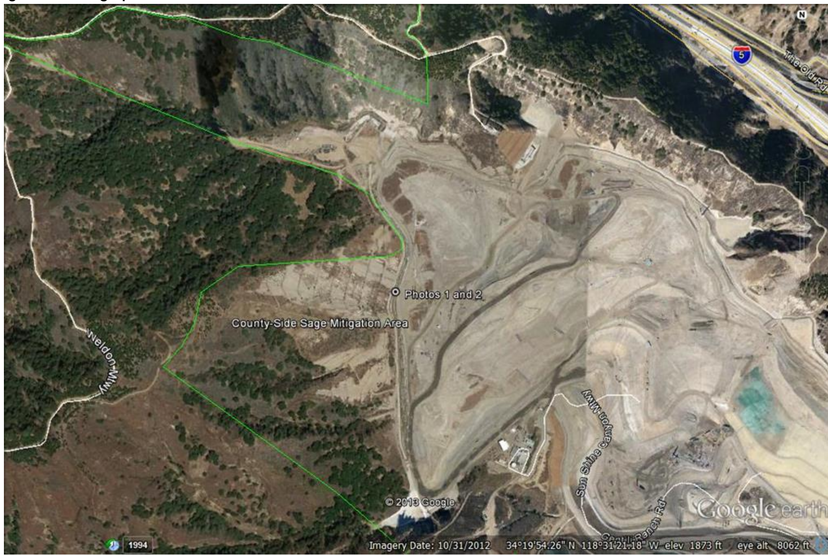
Figure 1 Photograph Locations