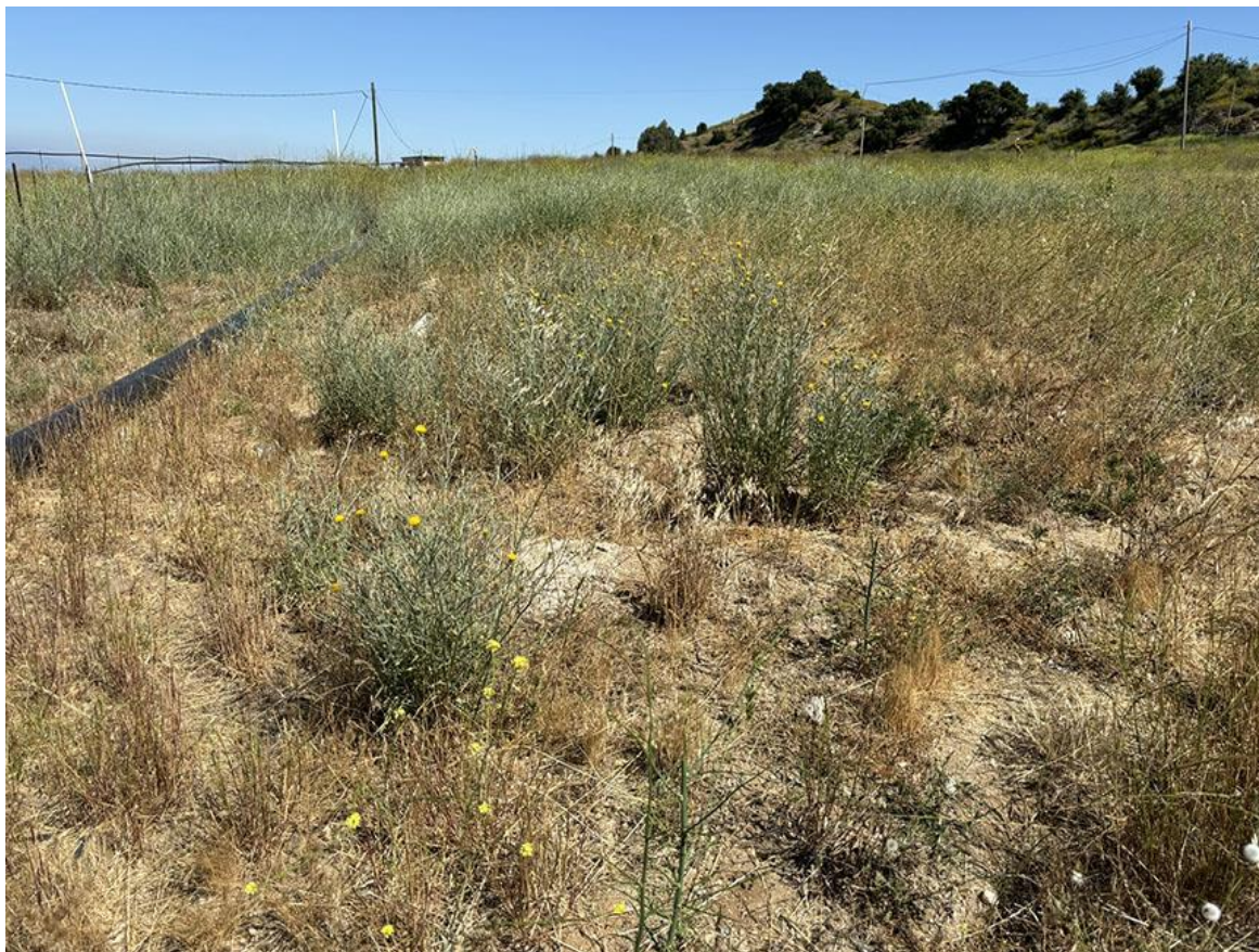
Deck A graded fill site (from 2023)