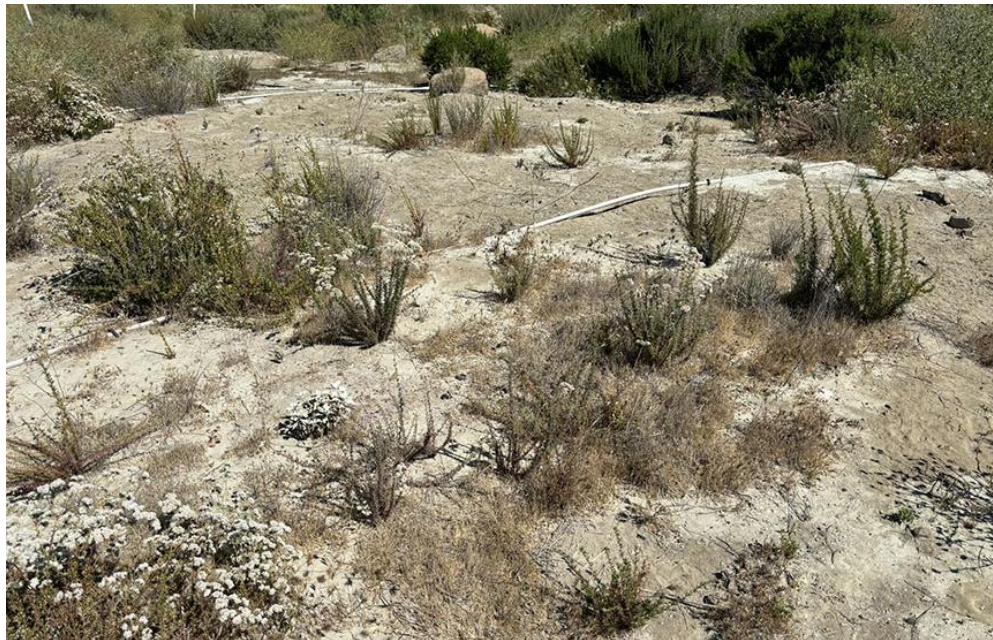
New Venturan CSS species growing within previous barren area on Deck B