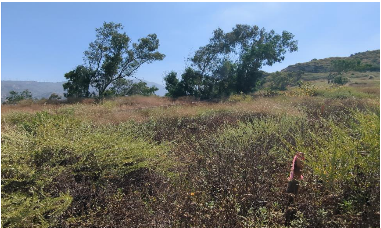
Photograph 12. Quadrat L facing northeast from southwest corner (June 19, 2024).