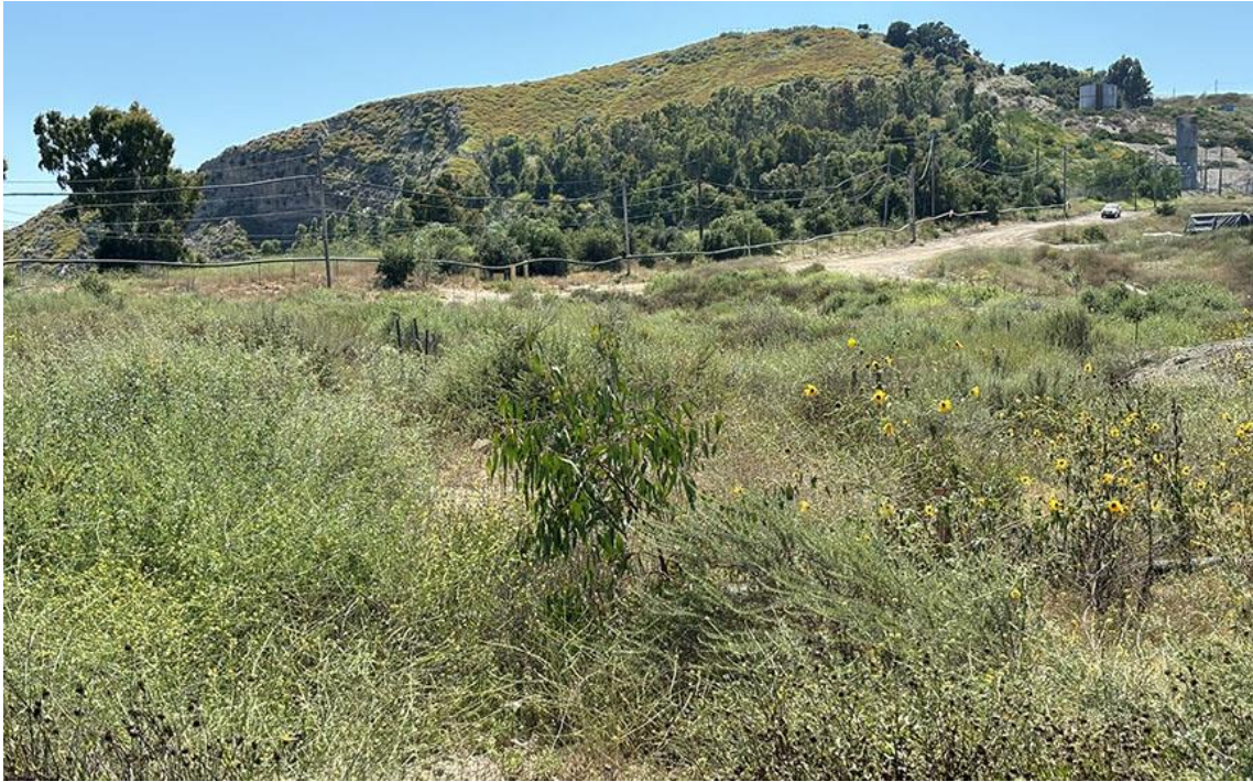
Eucalyptus species (to be removed)