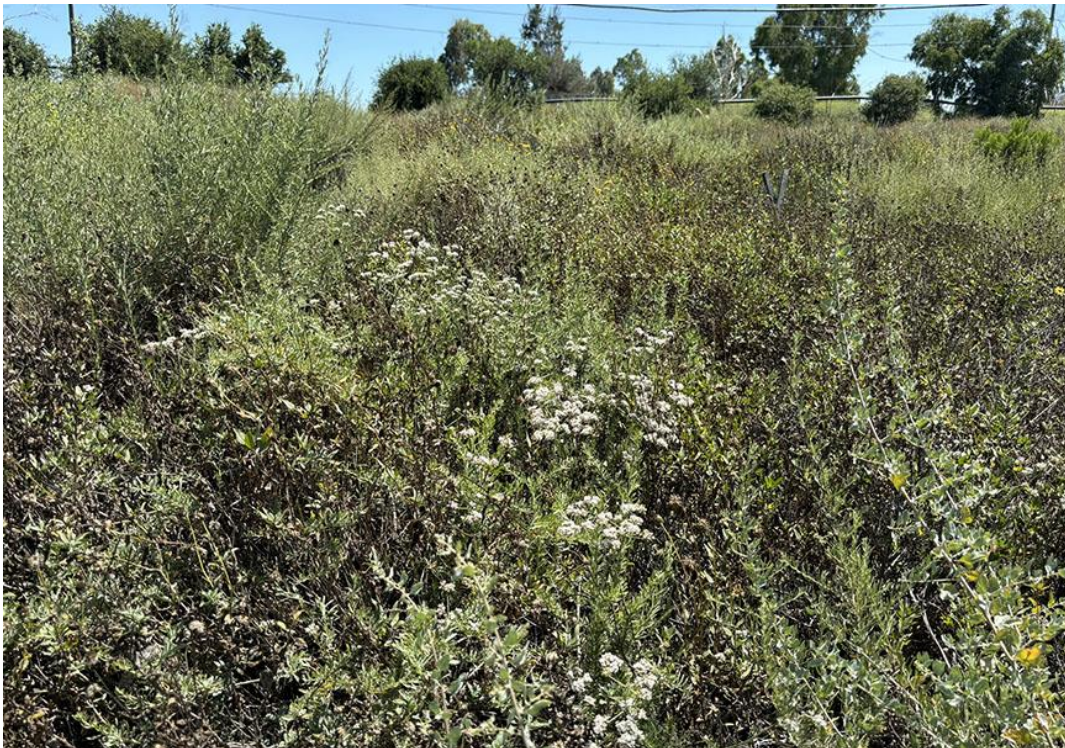
Native California Buckwheat ( Eriogonum fasciculatum ) (white flowering)