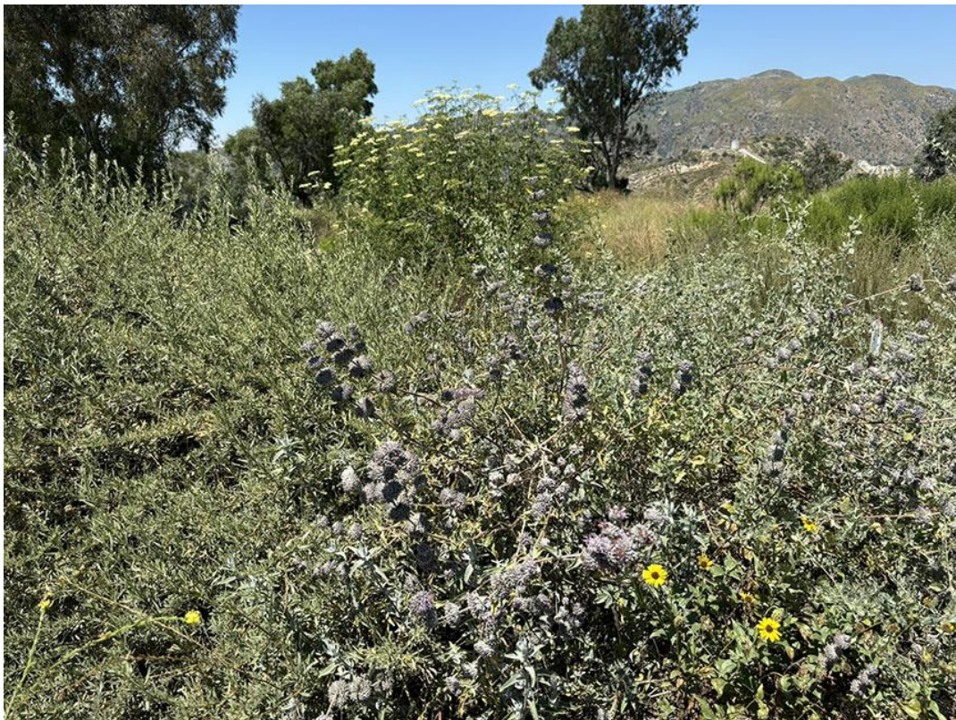
Purple Sage ( Salvia leucophylla ) blooming