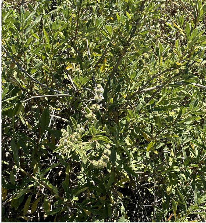
Black Sage ( Salvia mellifera ) blooming