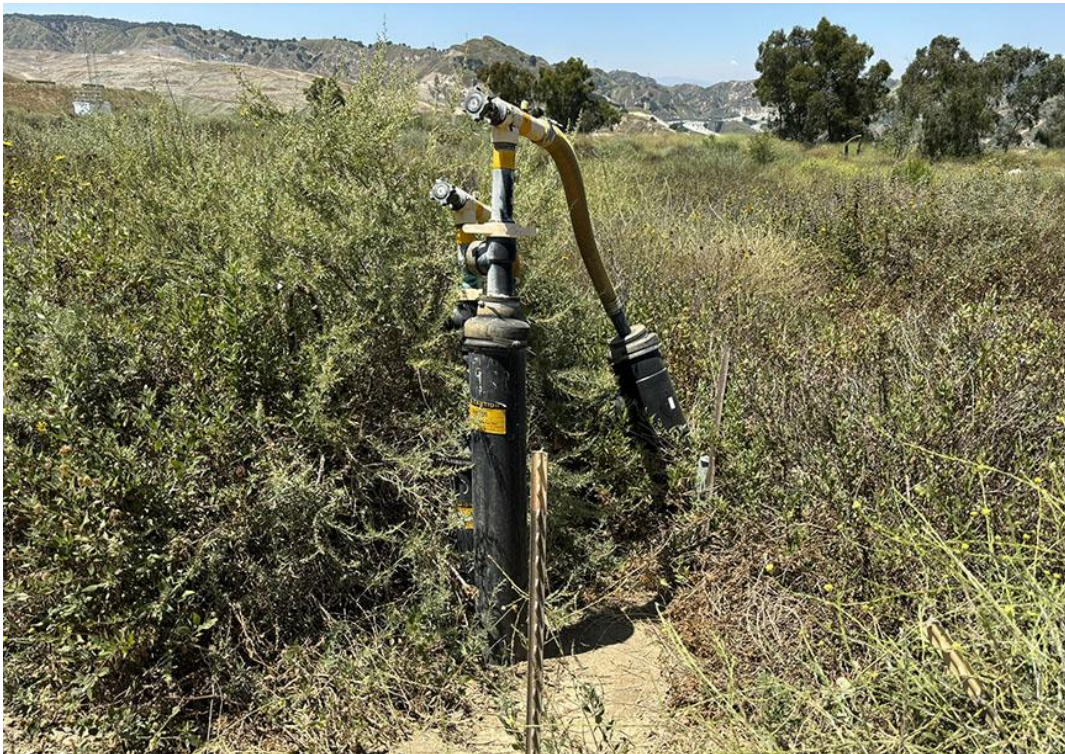
Gas Well with Saltbush growing into clearance zone