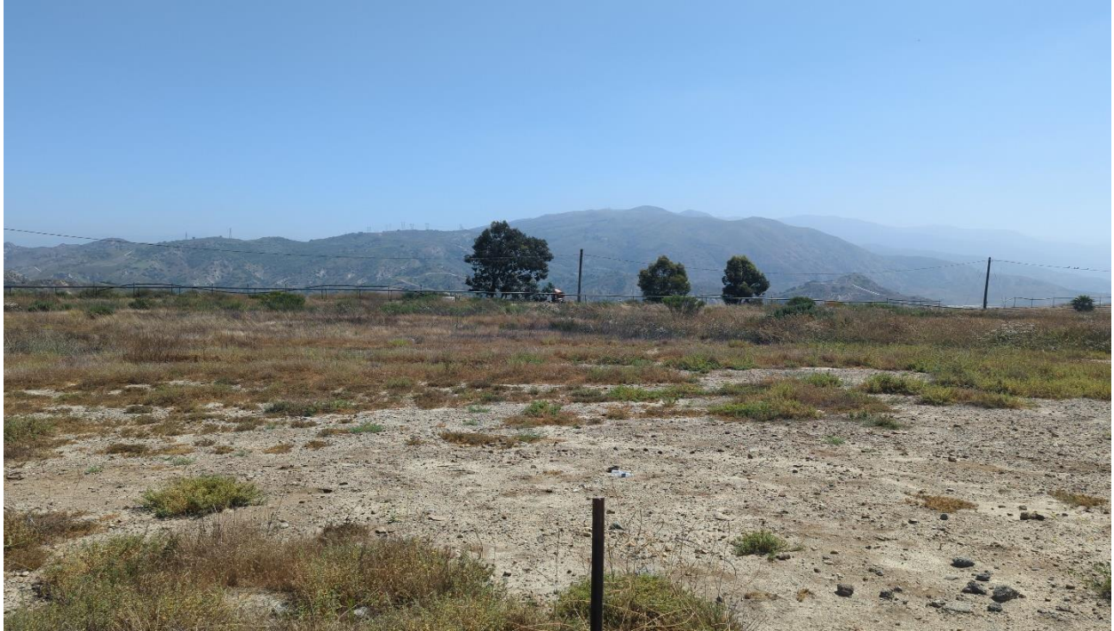
Photograph 5. Facing northeast at the Upper Deck. This area is compacted and gravelly and continues to be problematic for supporting vegetation. Non-native annual grasses and forbs, and California buckwheat shrubs are evident in the background (June 19, 2024).