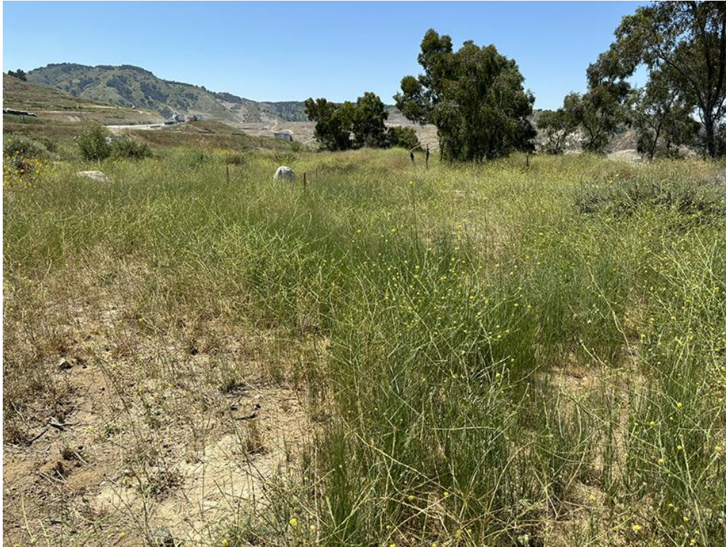
Invasive Shortpod Mustard (above) and Sow Thistle (below) within native Creeping Rye