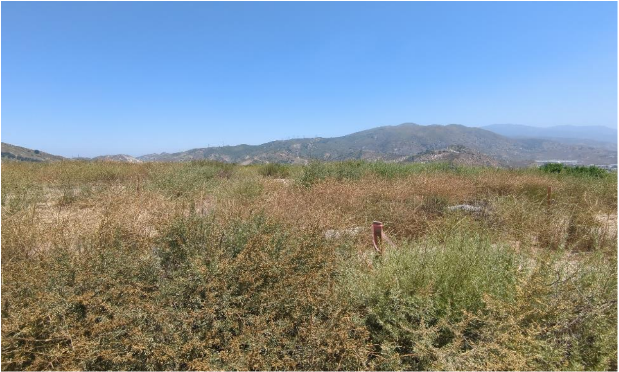
Photograph 7. Quadrat G facing northeast from southwest corner (June 19, 2024).