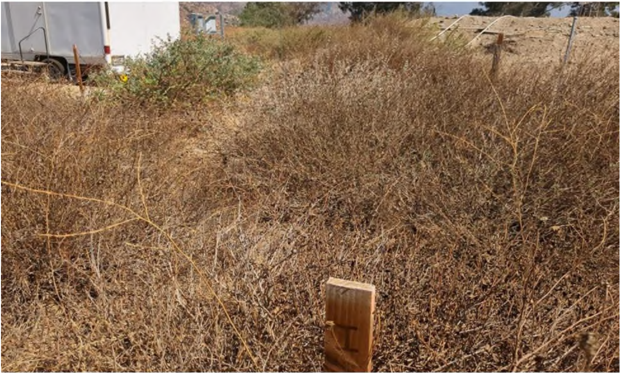
Photograph 9. Quadrat I facing northeast from southwest corner (September 27, 2024).