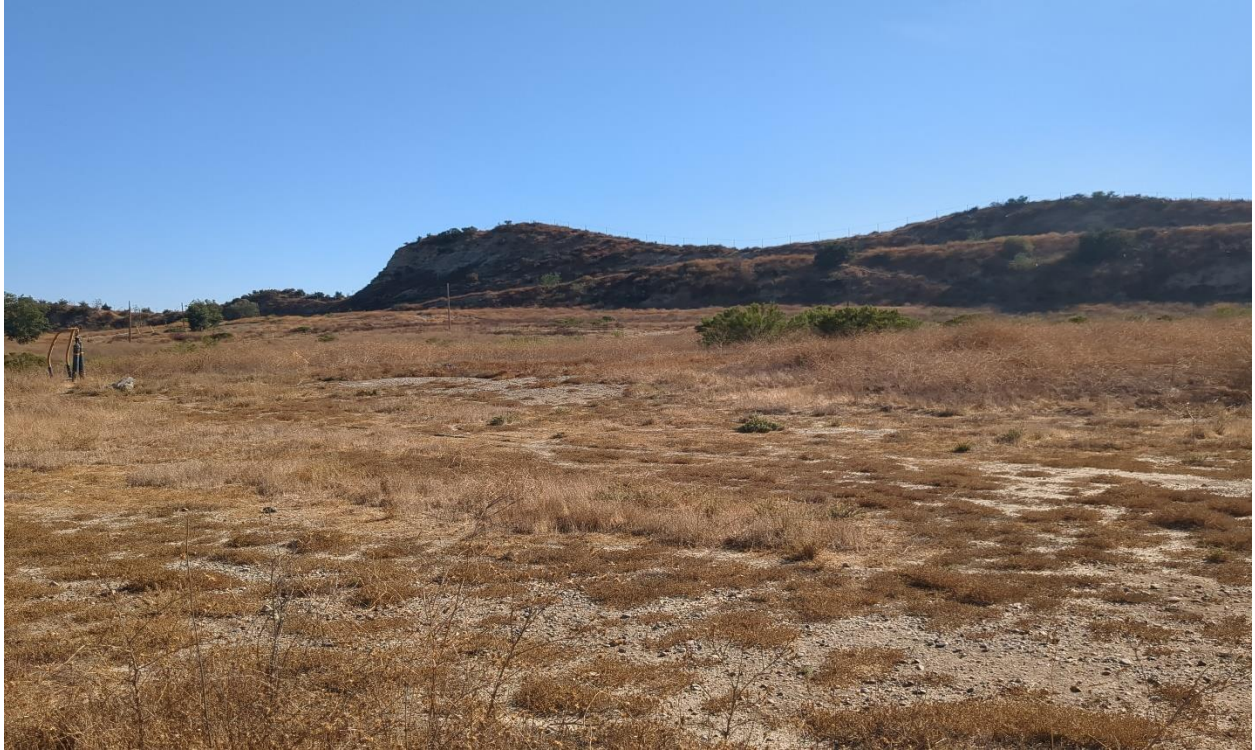
Photograph 7. Facing southeast at the western portion of the Upper Deck. This area is dominated by short podded mustard, Australian saltbush, and Russian thistle (September 27, 2024).