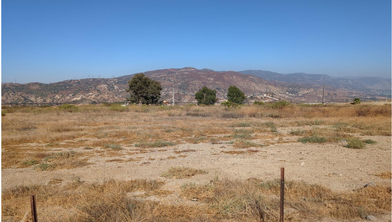
Photograph 5. Facing northeast at the Upper Deck. This area is compacted and gravelly and continues to be problematic for supporting vegetation. Non-native annual grasses and forbs, and California buckwheat shrubs are evident in the background (September 27, 2024).