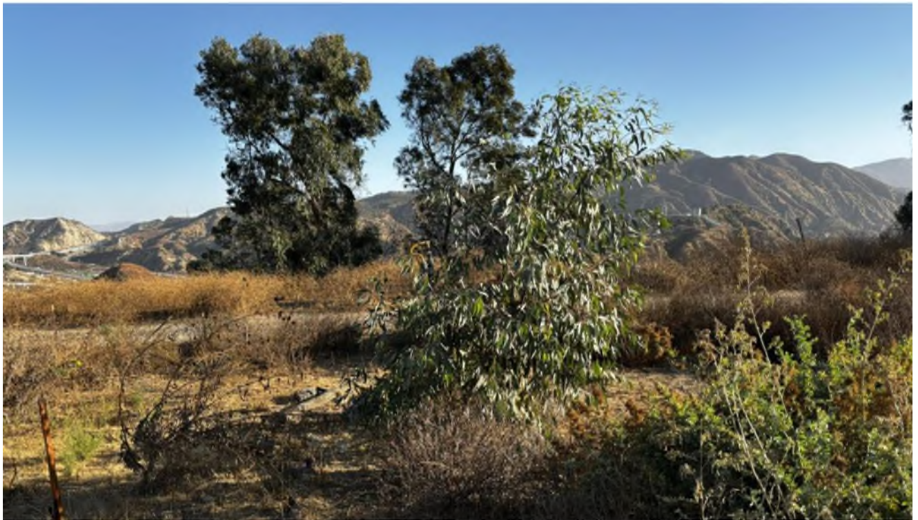
Eucalyptus tree growing on Deck C (To be removed)