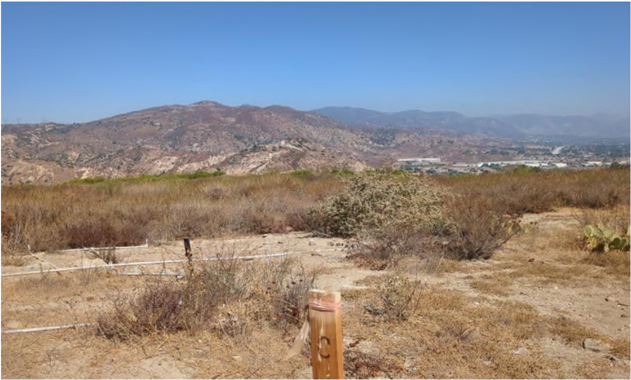
Photograph 3. Quadrat C facing northeast from southwest corner (September 27, 2024).