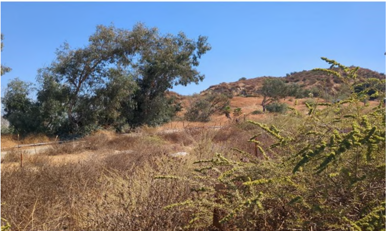
Photograph 12. Quadrat L facing northeast from southwest corner (September 27, 2024).