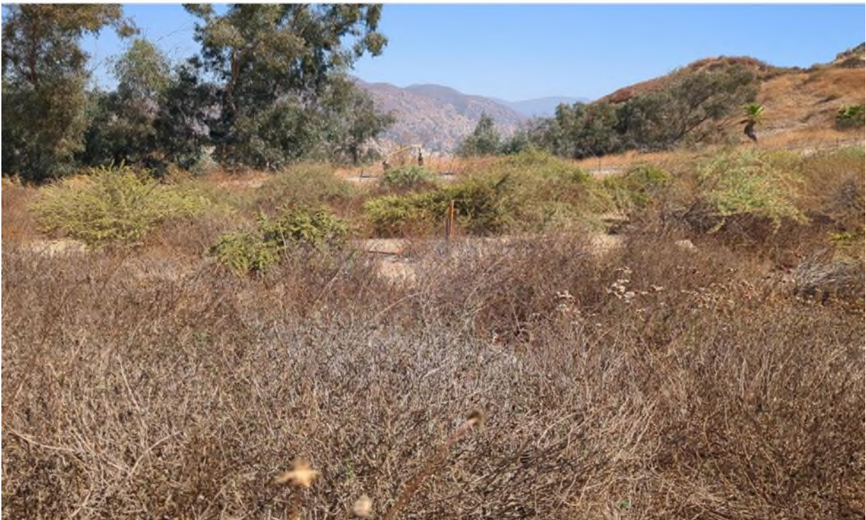
Photograph 8. Quadrat H facing northeast from southwest corner (September 27, 2024).