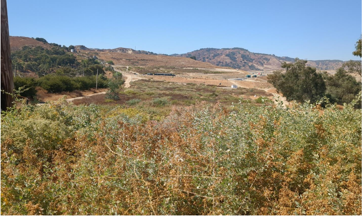
Photograph 1. Facing west at Lower Deck. View of eastern limits dominated by Atriplex spp. and California sunflower (September 27, 2024).