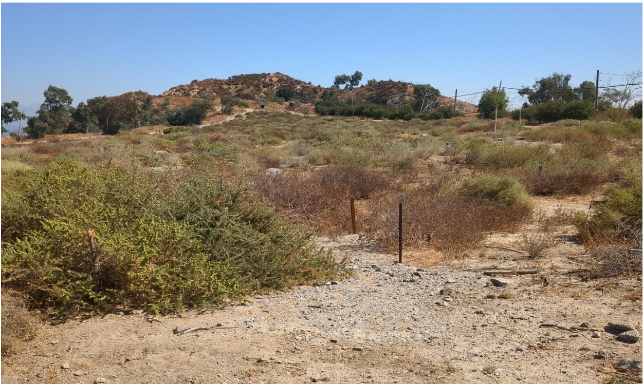
Photograph 2. Lower Deck from western boundary (September 27, 2024).