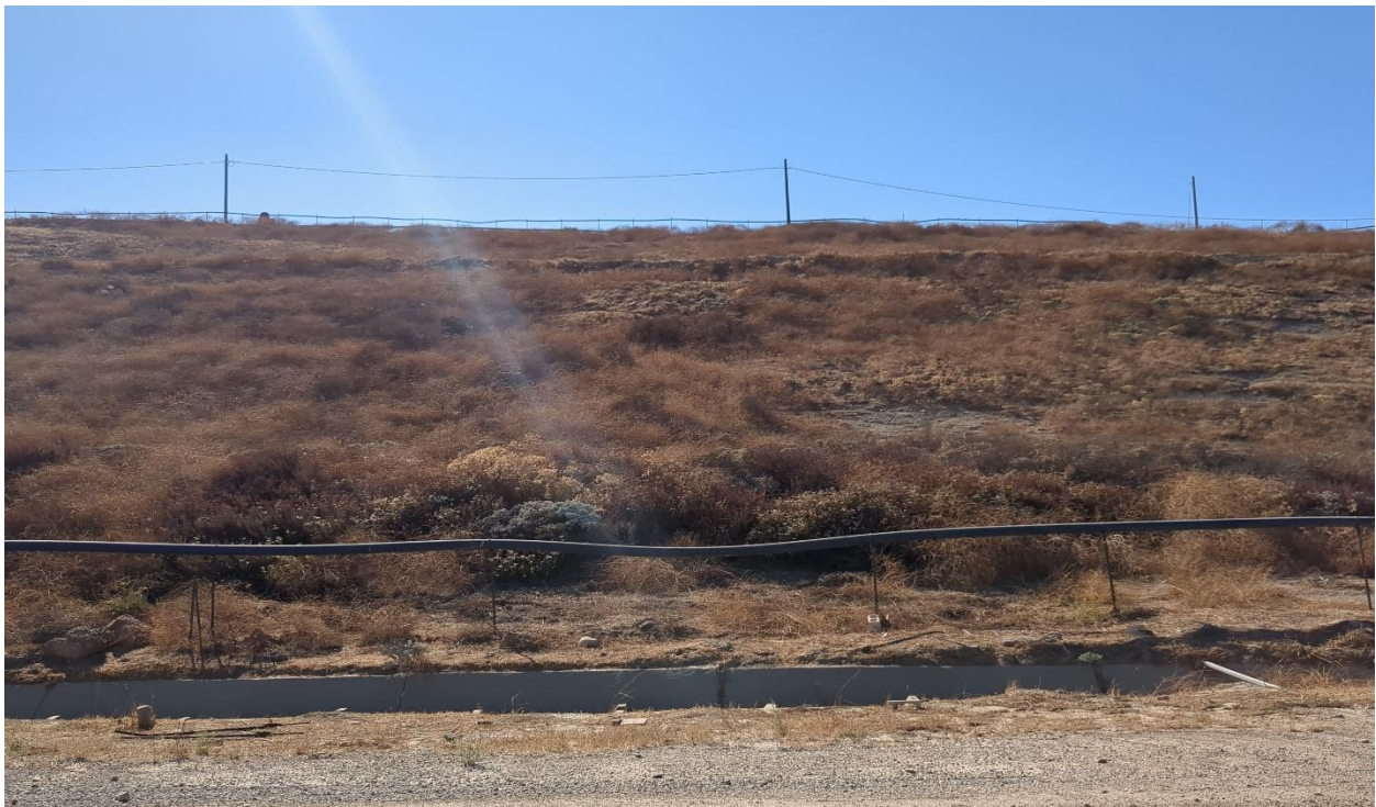
Photograph 4. Facing west at the easterly-facing slope located between the Middle and Upper Decks. The vegetation on the slopes between the Upper Deck is dominated by California buckwheat (currently vegetative) and non-native annual grasses (September 27, 2024).