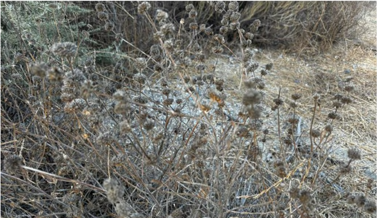
Dormant Black Sage ( Salvia mellifera )