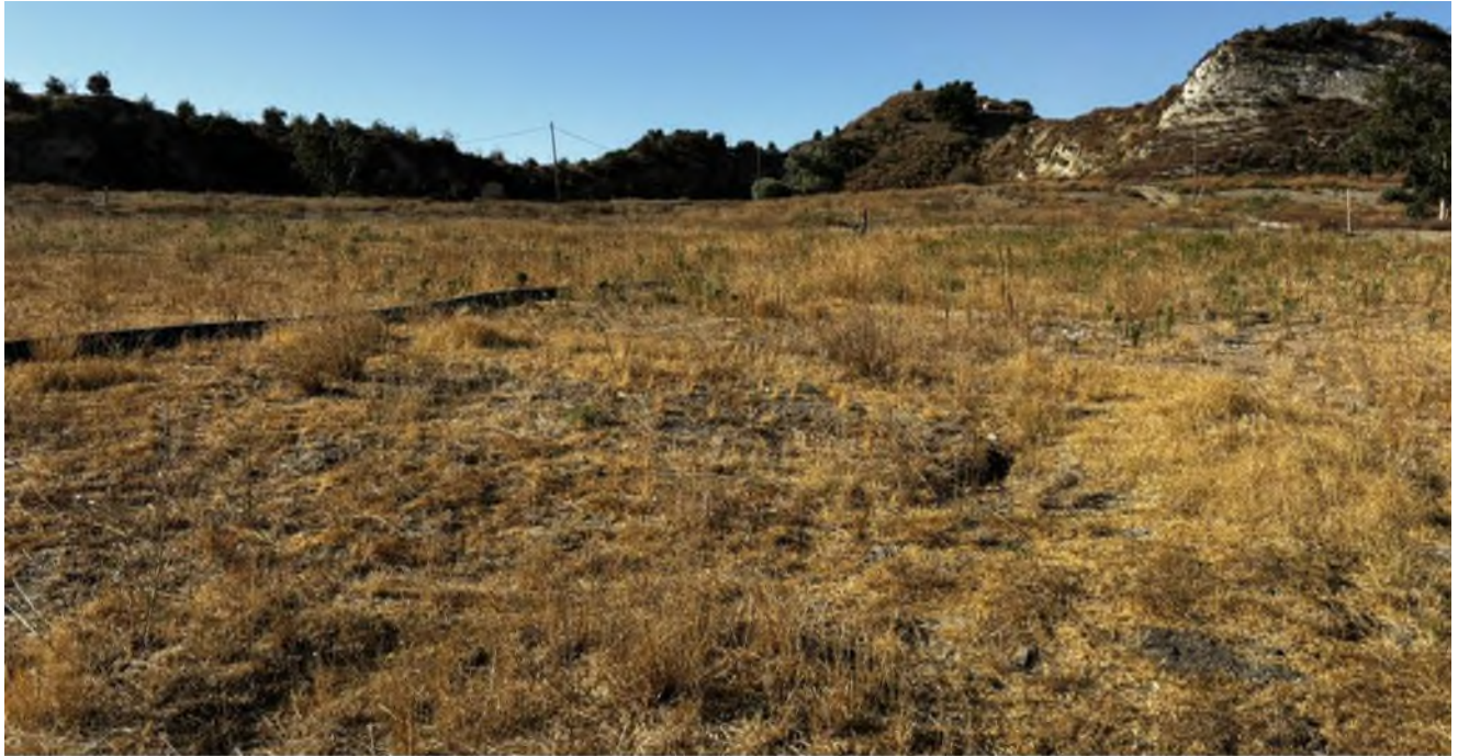
Existing conditions of Deck A