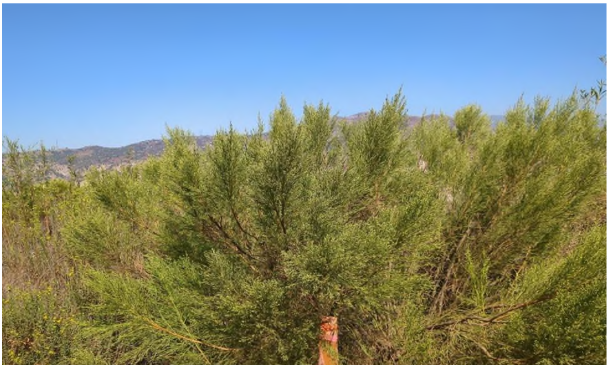
Photograph 2. Quadrat B facing northeast from southwest corner (September 27, 2024).