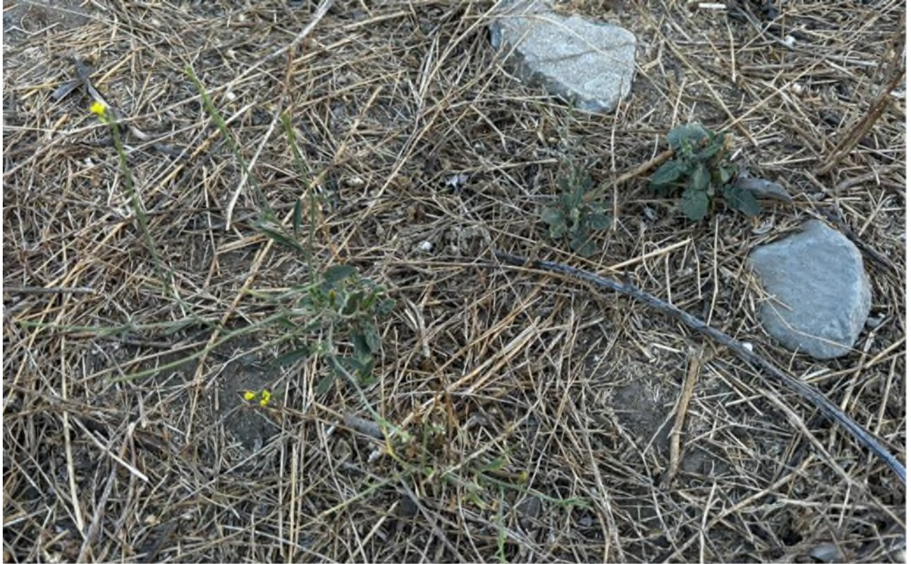
Shortpod Mustard ( Hirschfeldia incana )