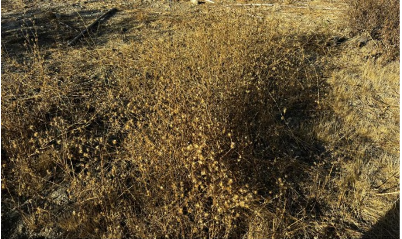
Dormant Yellow Thistle ( Centaurea solstitialis ) left on deck with seed heads