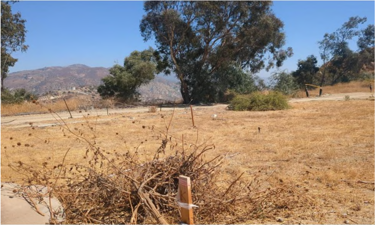
Photograph 11. Quadrat K facing northeast from southwest corner (September 27, 2024).