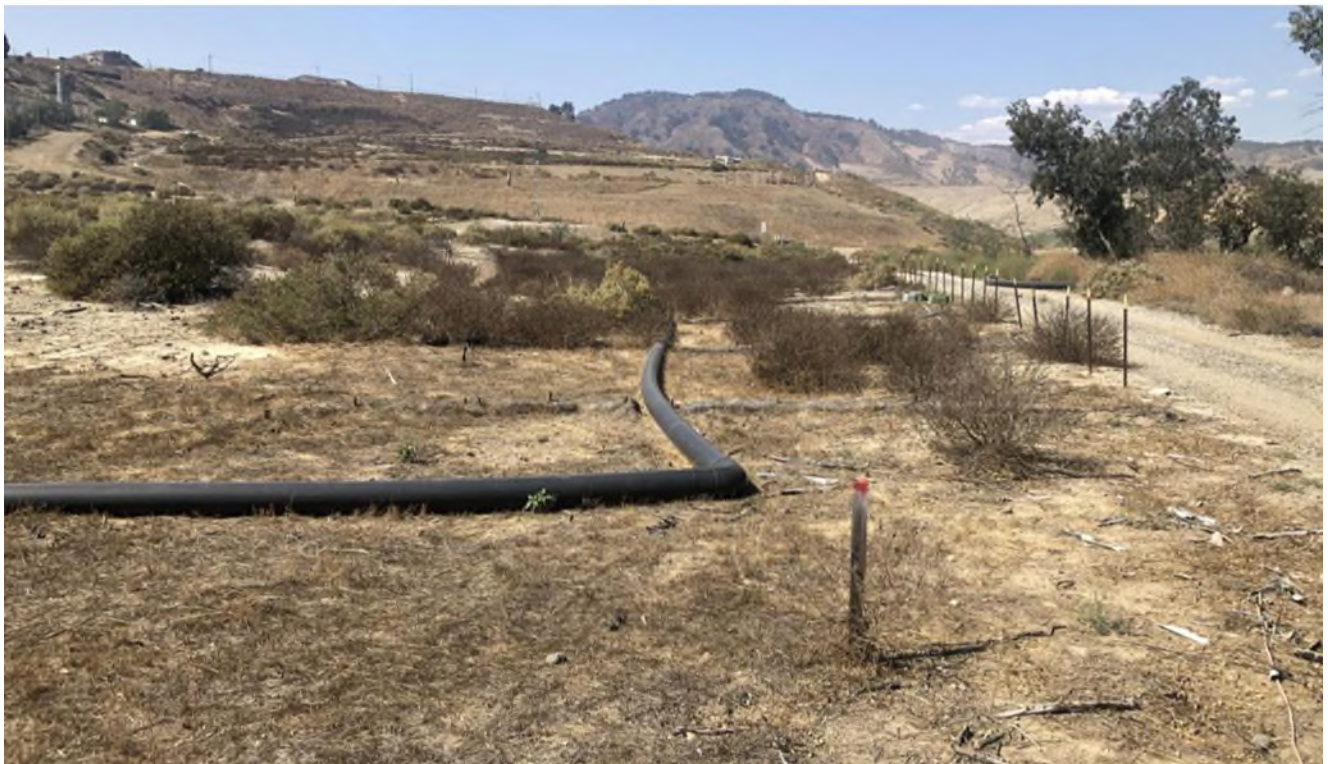
Scalping of Creeping Wild Rye - Fall 2022