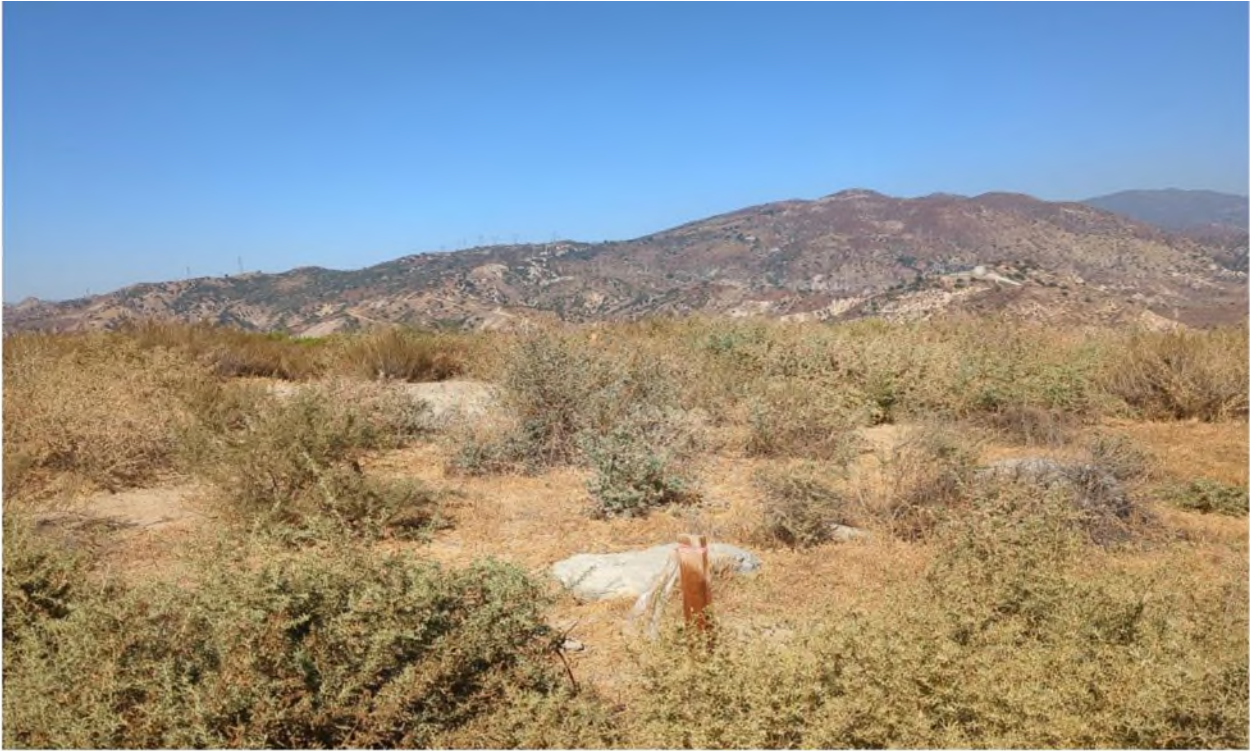
Photograph 7. Quadrat G facing northeast from southwest corner (September 27, 2024).