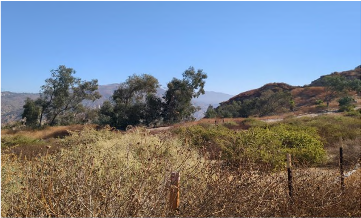
Photograph 3. Quadrat C facing northeast from southwest corner (September 27, 2024).