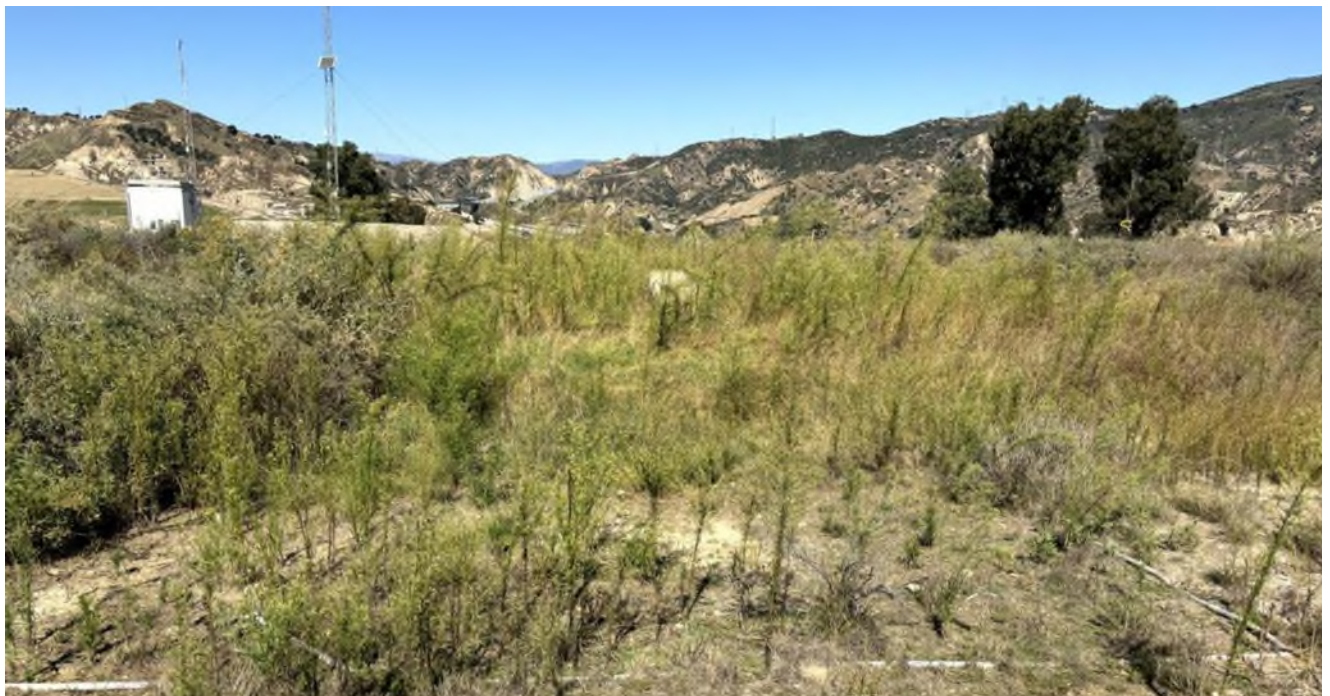
Image from 2023 – Where Horseweed ( Erigeron canadensis ) has taken over where Creeping Wild Rye previously existed.