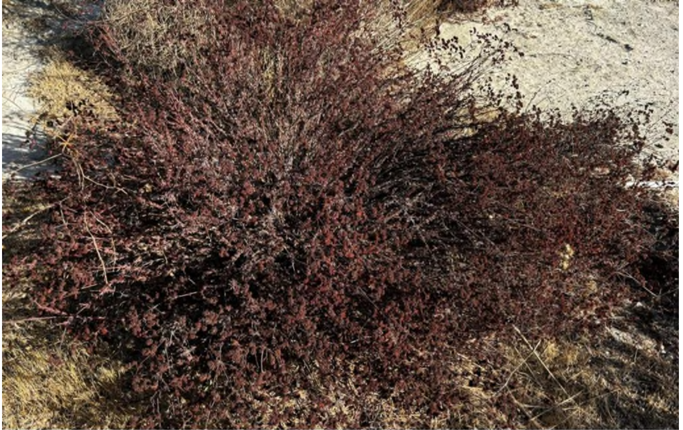
Dormant native VCSS California Buckwheat ( Eriogonum fasciculatum )