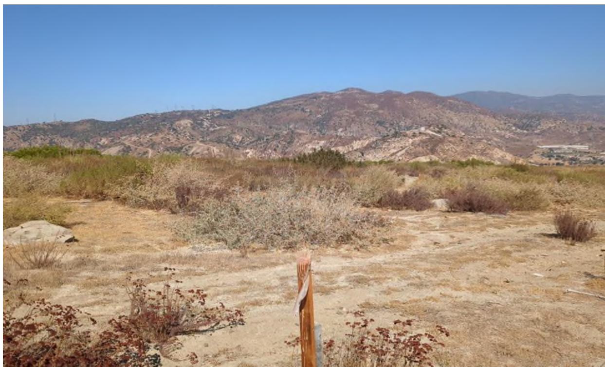
Photograph 6. Quadrat F facing northeast from southwest corner (September 27, 2024).