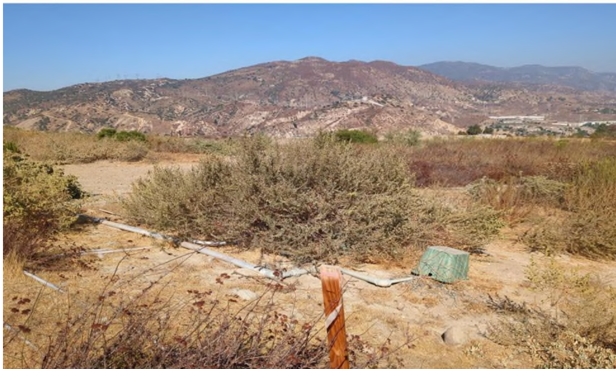
Photograph 9. Quadrat I facing northeast from southwest corner (September 27, 2024).