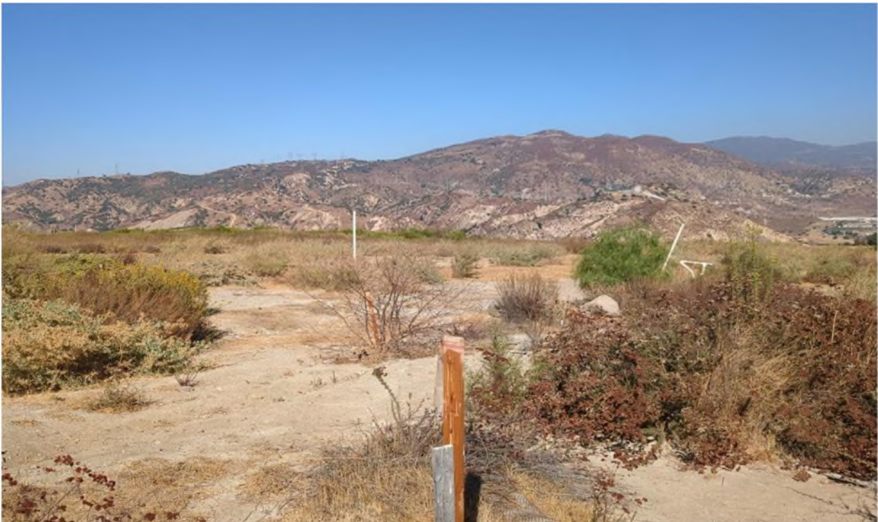
Photograph 8. Quadrat H facing northeast from southwest corner (September 27, 2024).