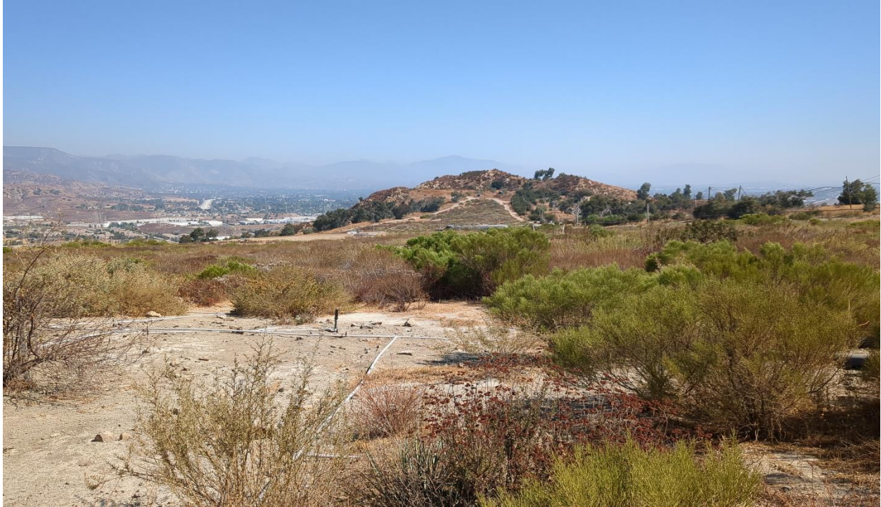
Photograph 3. Facing east at the Middle Deck from western boundary (September 27, 2024).