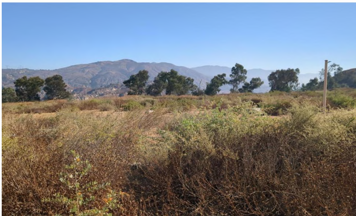
Photograph 2. Quadrat B facing northeast from southwest corner (September 27, 2024).