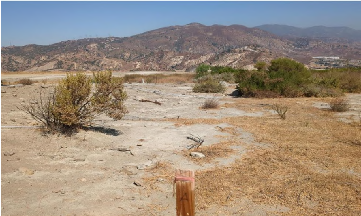
Photograph 1. Quadrat A facing northeast from southwest corner (September 27, 2024).