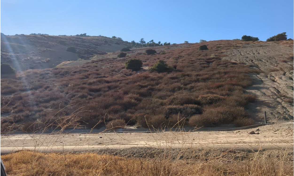
Photograph 1. Facing southwest at the County-Side Sage Mitigation Area (September 27, 2024).