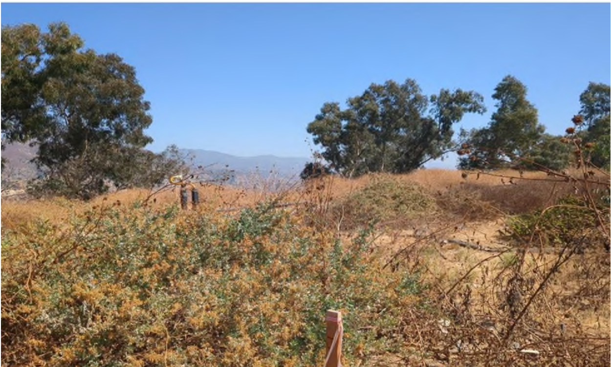
Photograph 10. Quadrat J facing northeast from southwest corner (September 27, 2024).