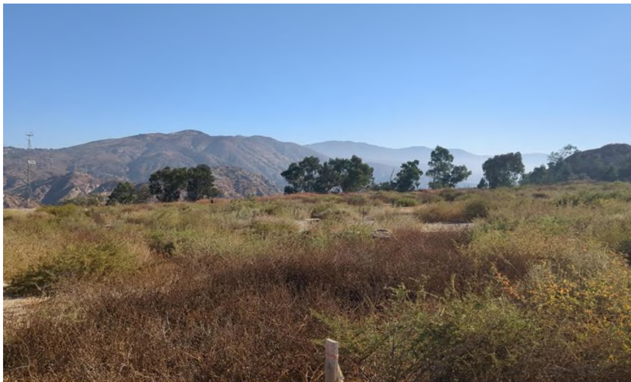
Photograph 1. Quadrat A facing northeast from southwest corner (September 27, 2024).