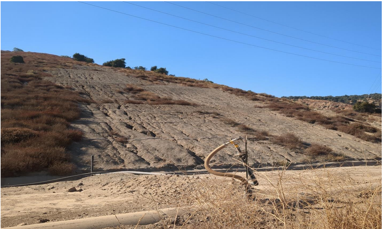
Photograph 2. Facing northwest at the northern portion of the County-Side Sage Mitigation Area where plant growth has been problematic due to poor soil conditions (September 27, 2024).