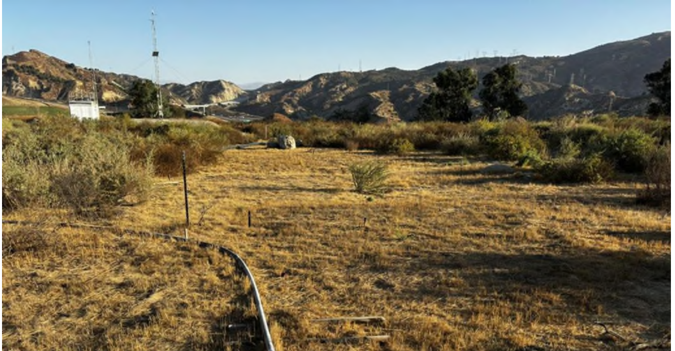
Scalping of Creeping Wild Rye ( Leymus triticoides )