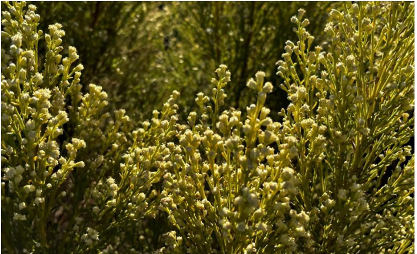
Flowering Coyote Bush ( Baccharis pilularis )