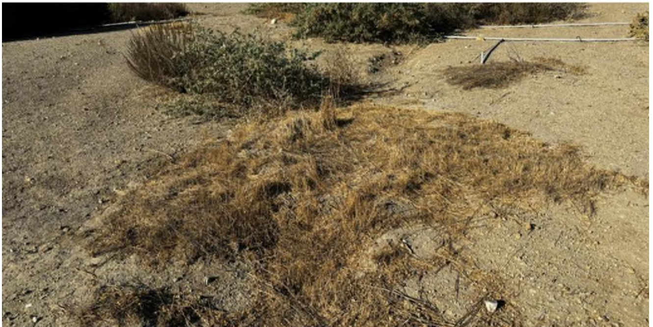
Scalped Creeping Rye Grass ( Leymus triticoides )