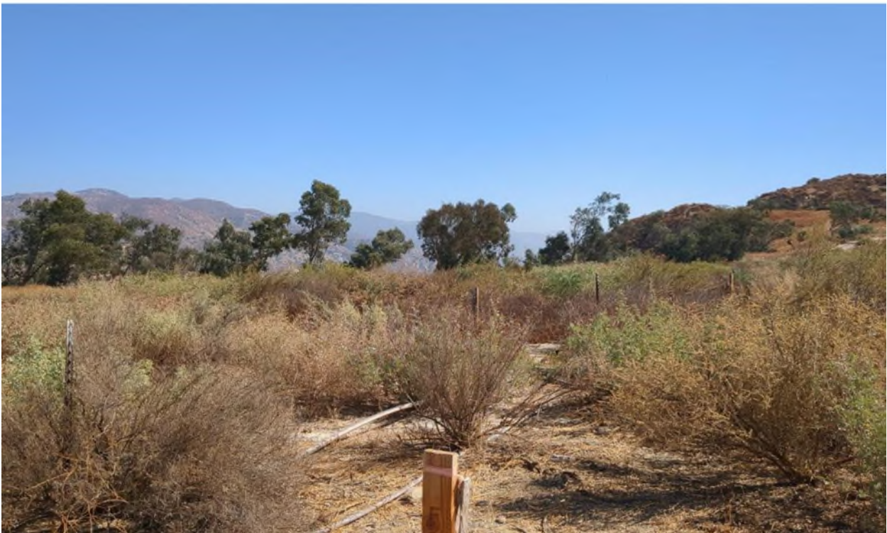
Photograph 6. Quadrat F facing northeast from southwest corner (September 27, 2024).