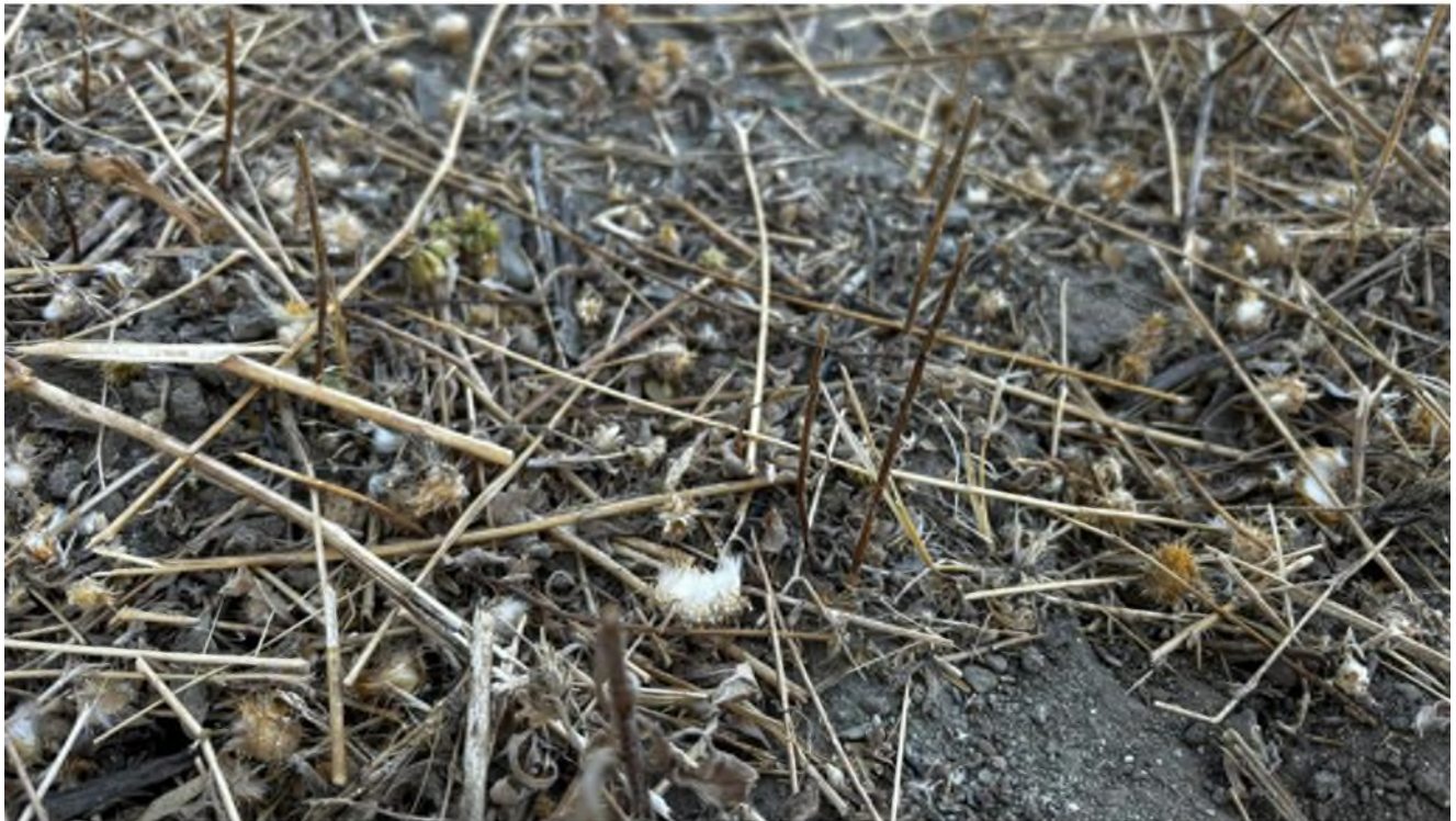
Yellow Thistle ( Centaurea solstitialis ) weed seed heads left on deck