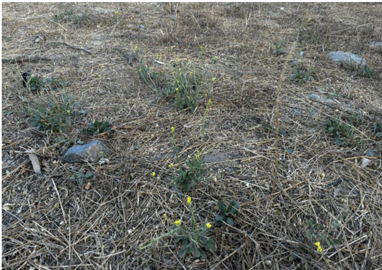
Shortpod Mustard ( Hirschfeldia incana ) emergence amongst seed and vegetation debris from past weed growth