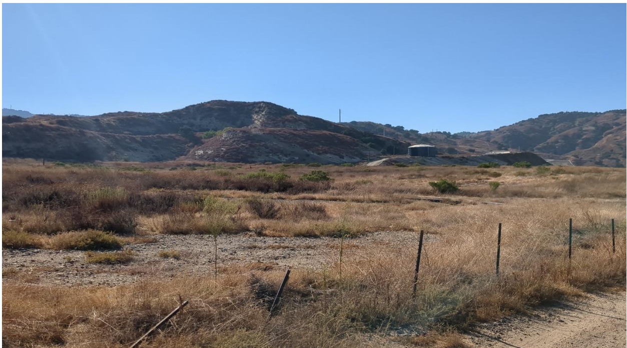
Photograph 6. Facing southwest at the Upper Deck. This area is primarily dominated by wild oats, brome grasses, redstem filaree, and short podded mustard (September 27, 2024).