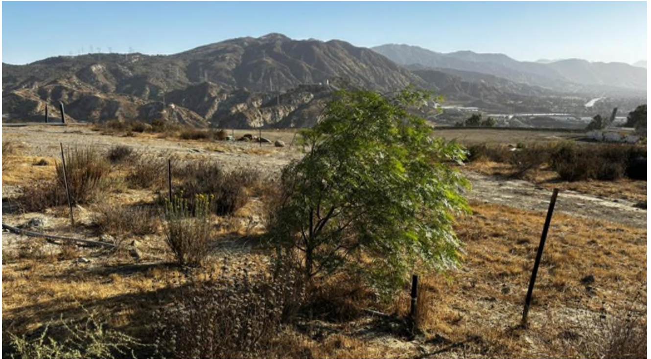
California Pepper Trees ( Schinus molle ) to be removed from Deck B