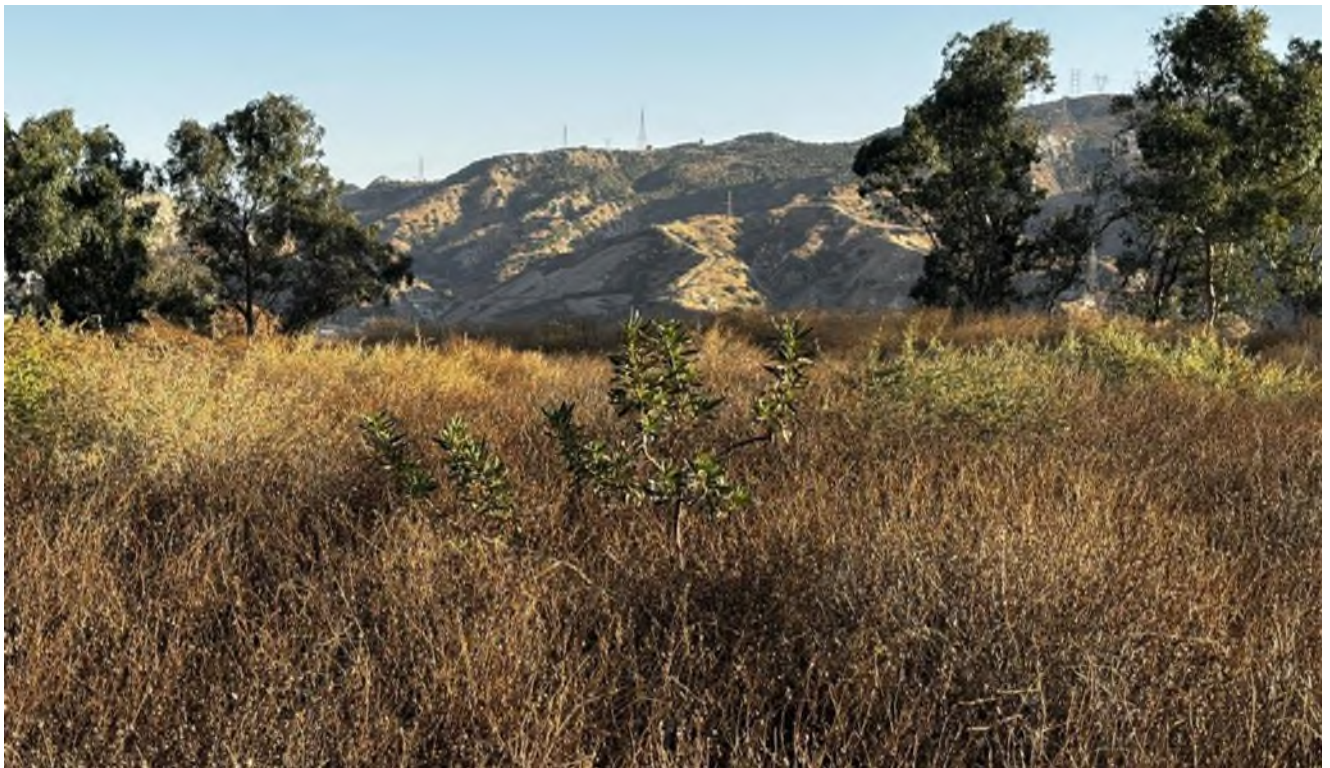
Narrow-leaf Yerba Santa ( Eriodictyon angustifolium ) emerges from dormant stand of Coast Sunflower ( Encelia californica )