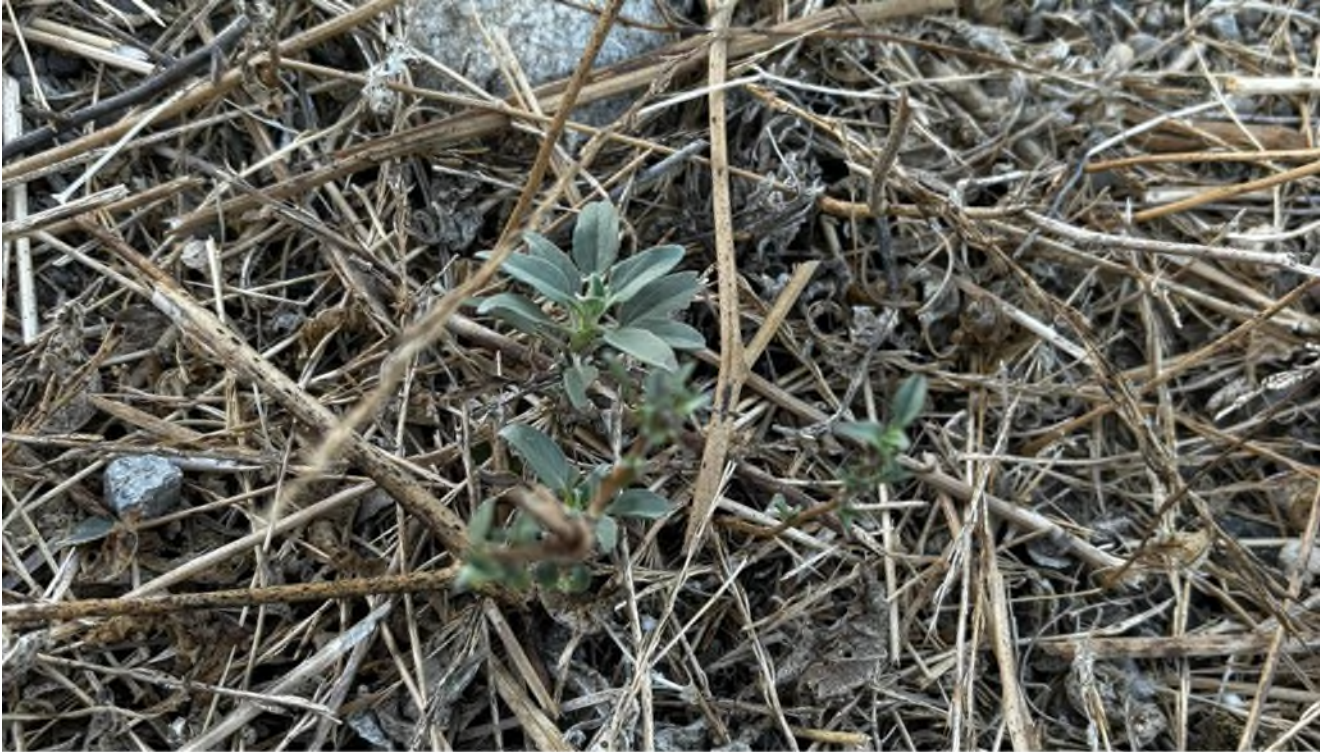
Coast Sunflower ( Encelia californica ) seedling