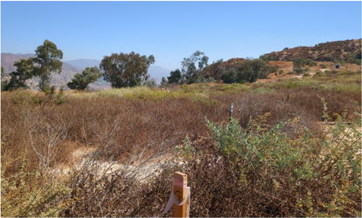
Photograph 7. Quadrat G facing northeast from southwest corner (September 27, 2024).