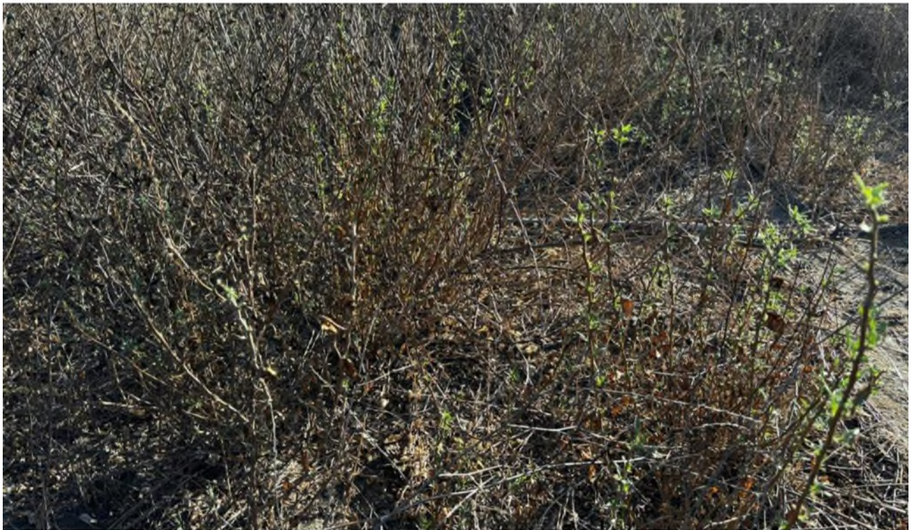
Coast Sunflower ( Encelia californica ) foliage emerging with cooler temperatures