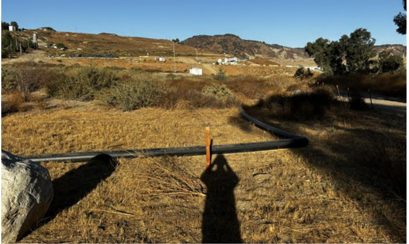
Recent scalping of Creeping Wild Rye – Fall 2024