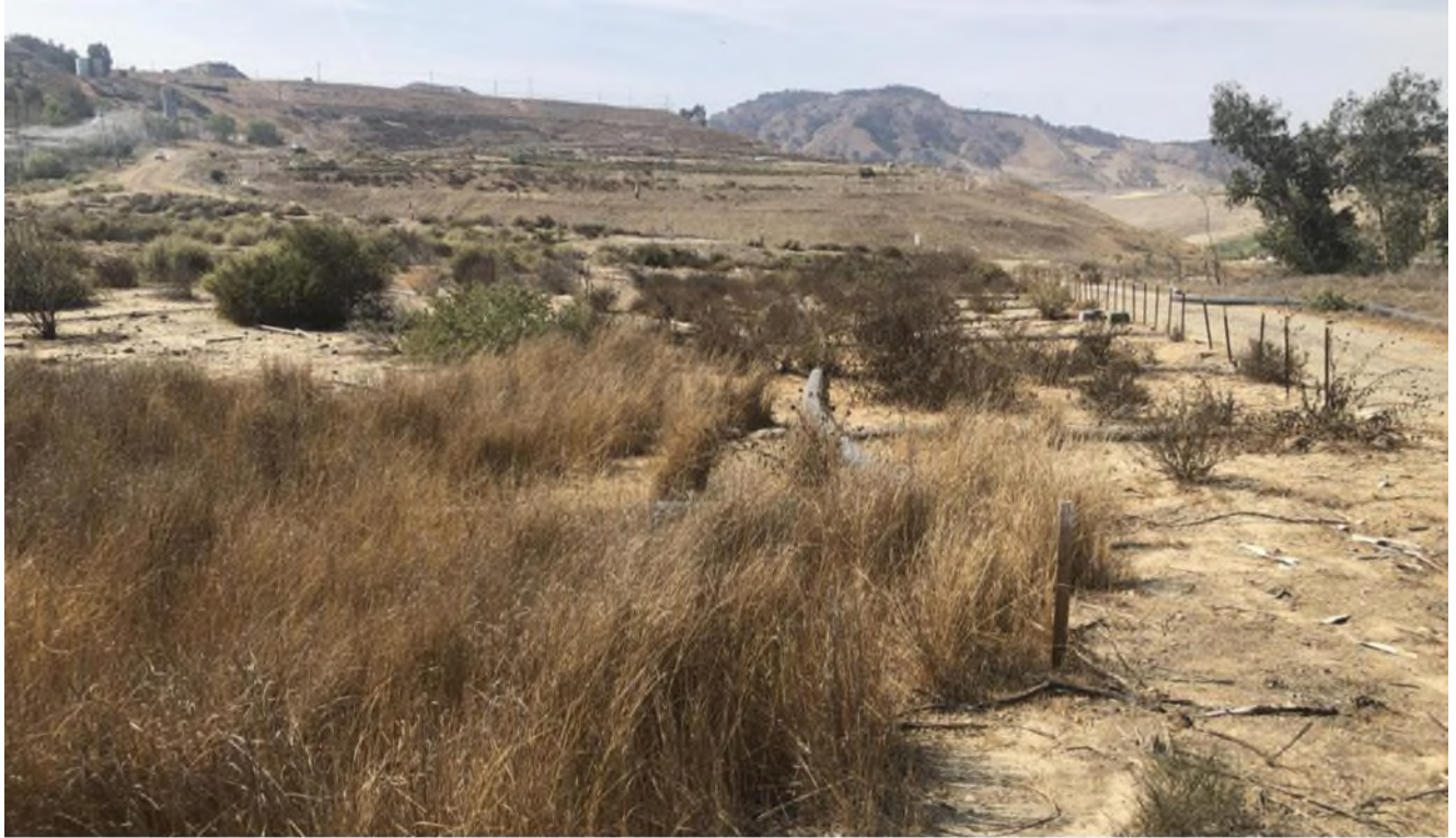
Creeping Wild Rye ( Leymus triticoides ) - Fall 2021