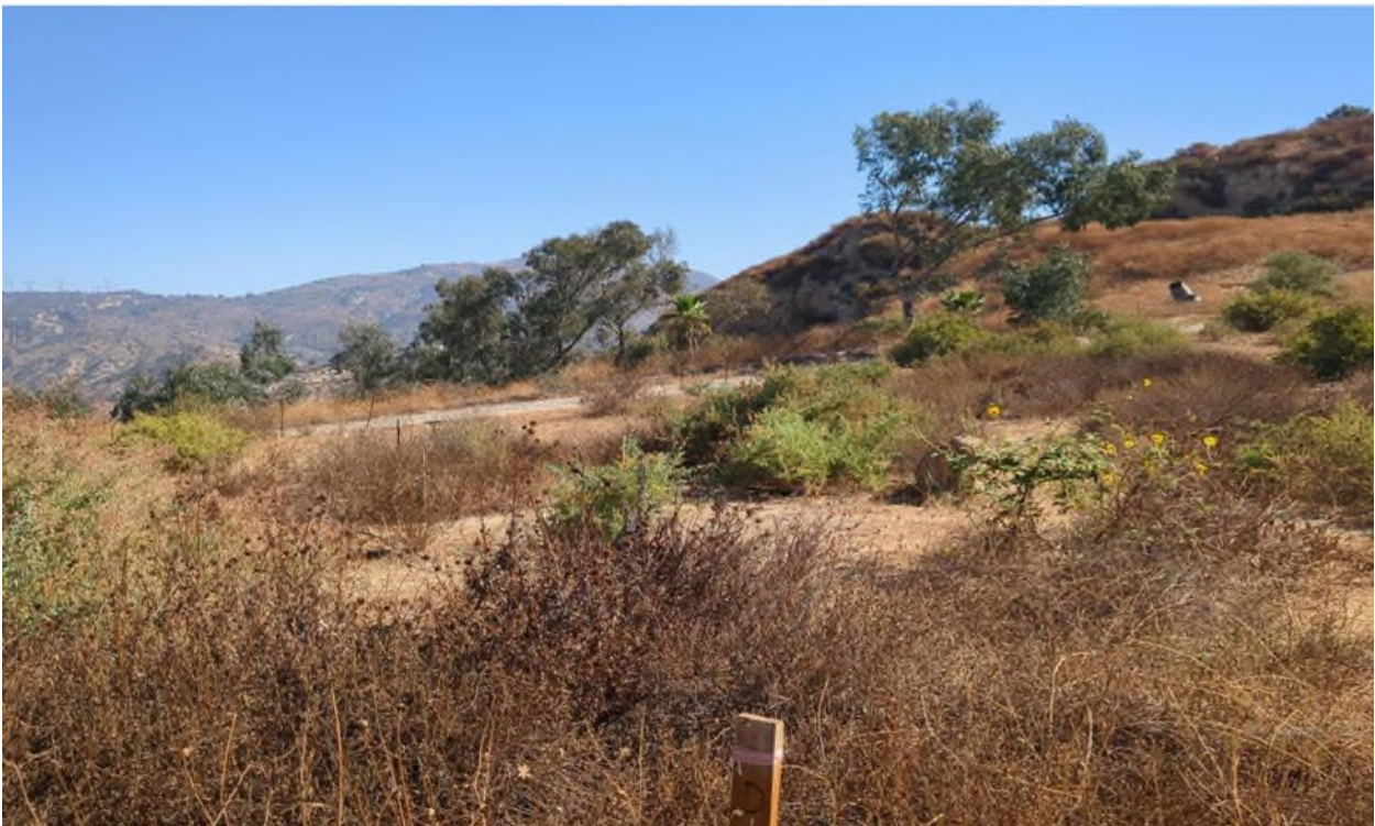
Photograph 4. Quadrat D facing northeast from southwest corner (September 27, 2024).