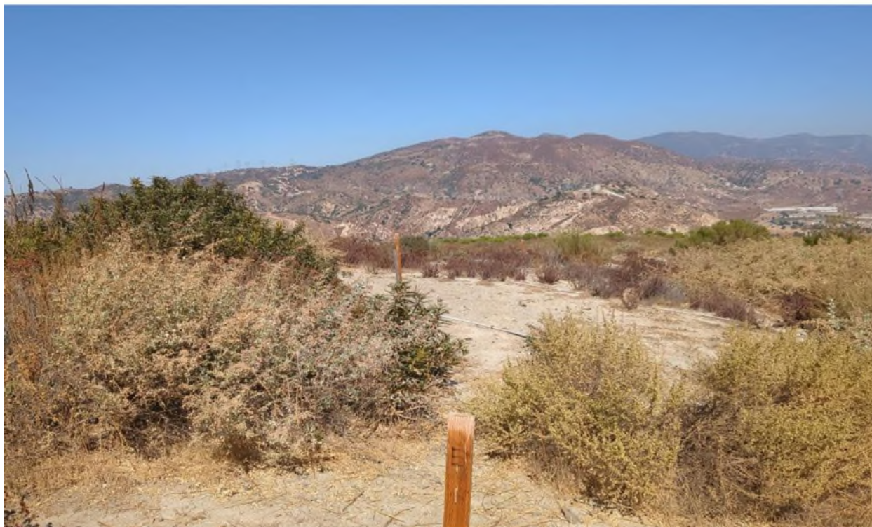
Photograph 5. Quadrat E facing northeast from southwest corner (September 27, 2024).