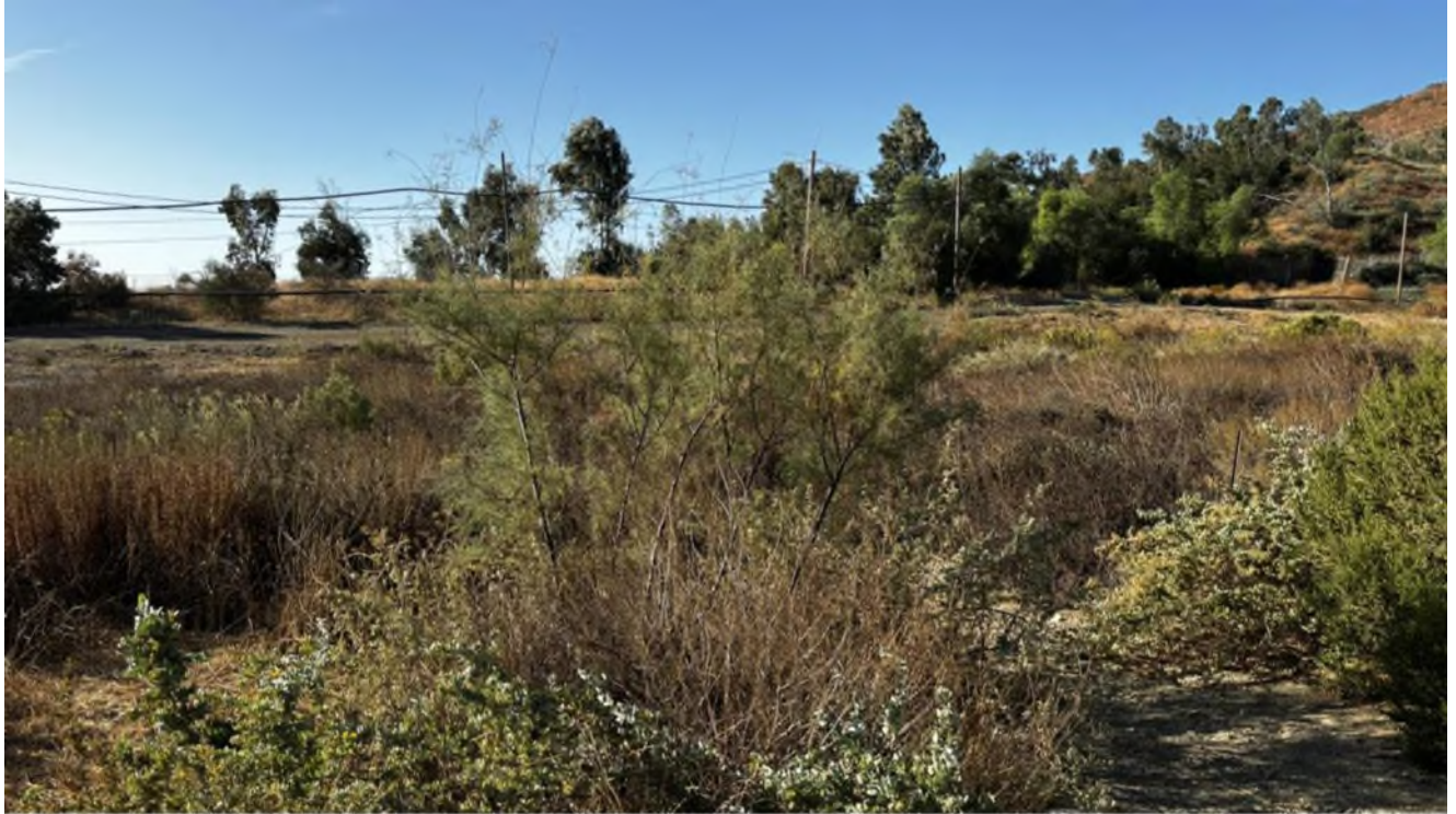
Invasive Salt Cedar ( Tamarix species) to be removed from Deck B