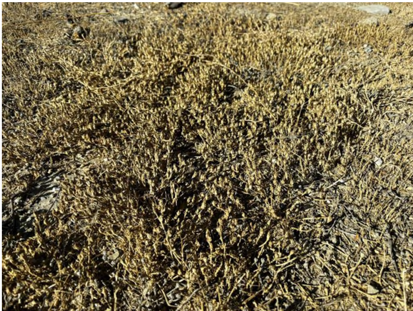
Dormant invasive Slenderleaf Iceplant ( Mesembryanthemum nodiflorum )