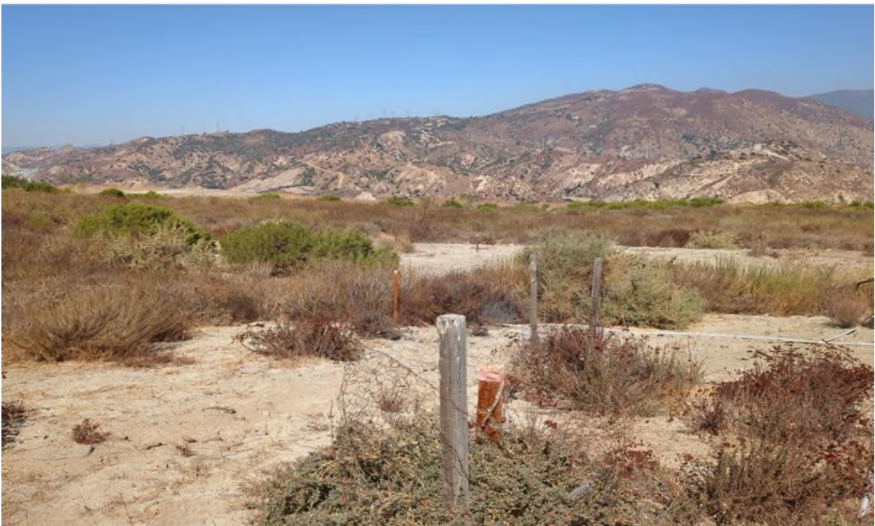
Photograph 4. Quadrat D facing northeast from southwest corner (September 27, 2024).