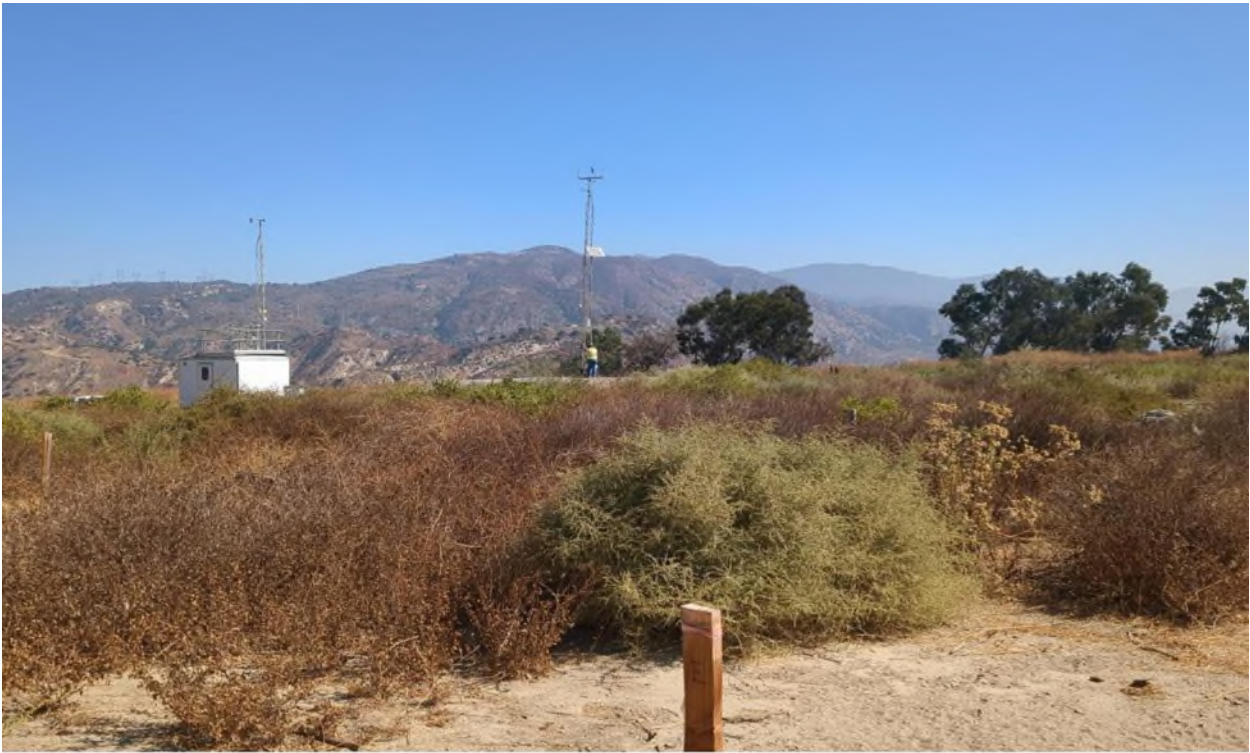
Photograph 5. Quadrat E facing northeast from southwest corner (September 27, 2024).