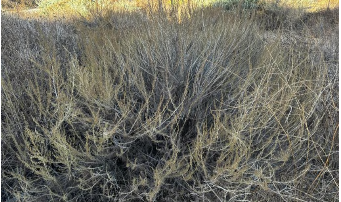
Dormant California Sagebrush ( Artemisia californica )