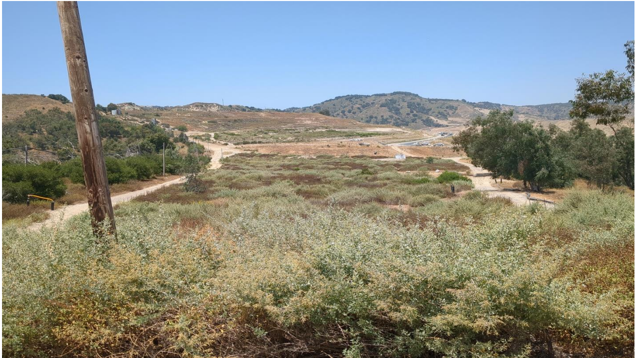
Photograph 1. Facing west at Lower Deck. View of eastern limits dominated by Atriplex spp. and California sunflower (June 23, 2025).