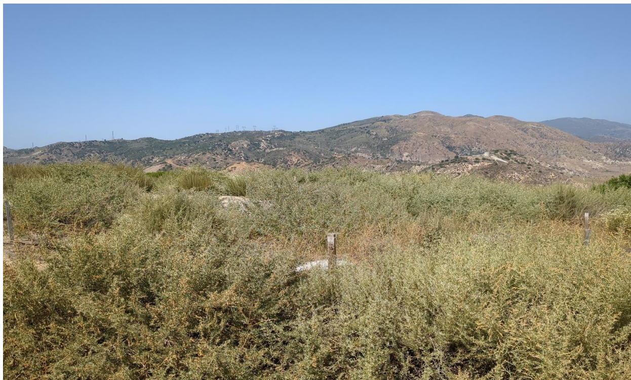
Photograph 7. Quadrat G facing northeast from southwest corner (June 23, 2025).