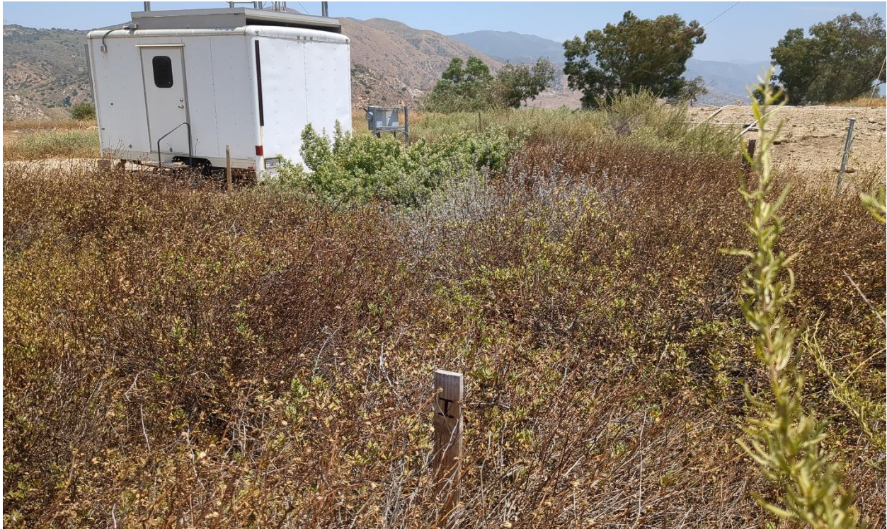
Photograph 9. Quadrat I facing northeast from southwest corner (June 23, 2025).