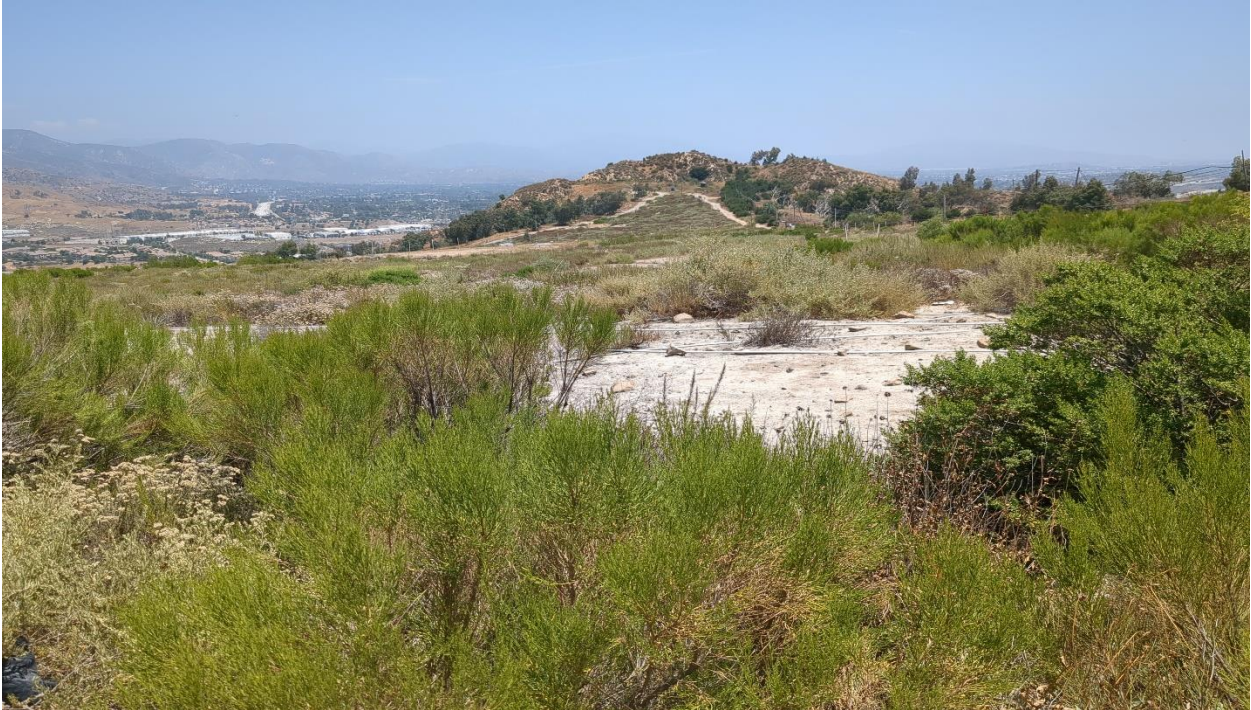
Photograph 3. Facing east at the Middle Deck from western boundary (June 23, 2025).