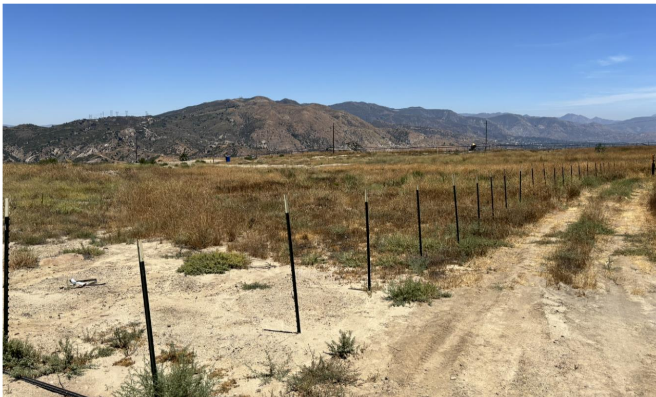
Deck A graded fill site, predominately covered with invasive weeds