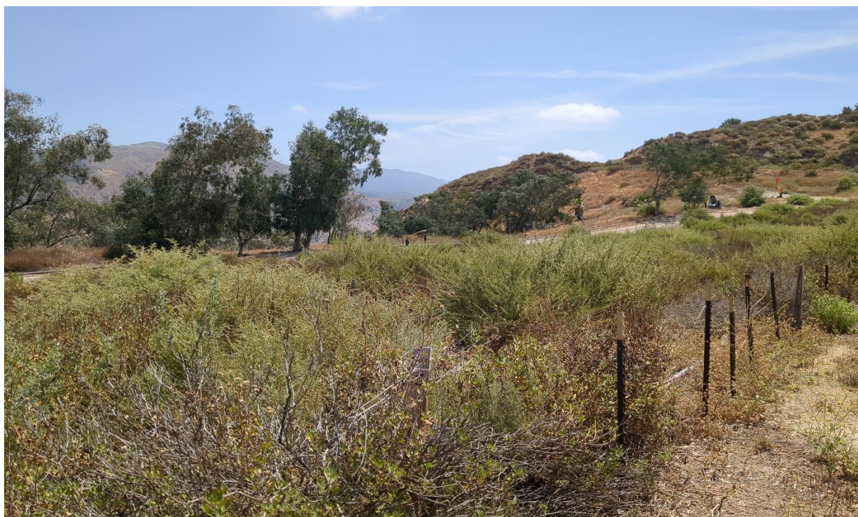
Photograph 3. Quadrat C facing northeast from southwest corner (June 23, 2025).