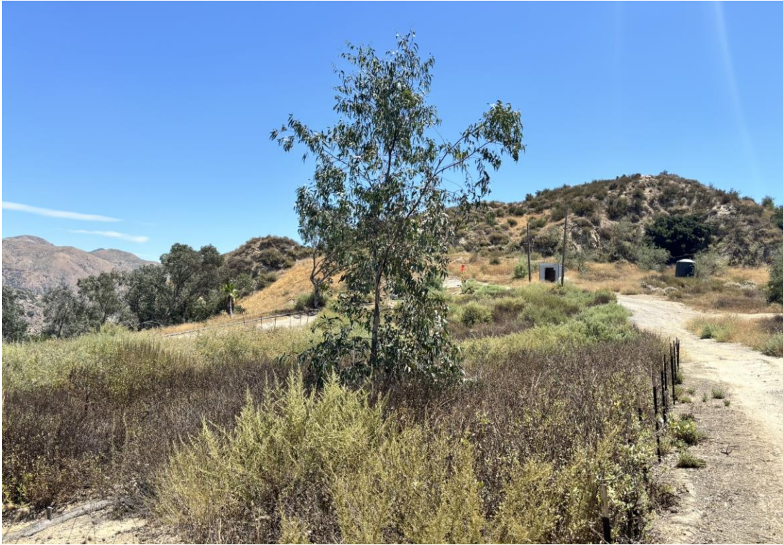
Invasive Eucalyptus Tree ( Eucalyptus sp.) on southeast side of deck approx. 20' tall