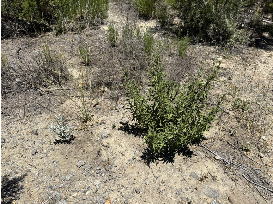
New Venturan CSS species growing within previous barren area on Deck B