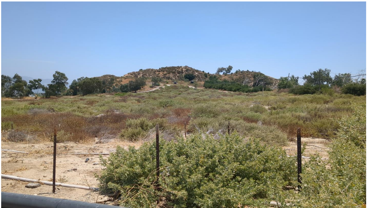
Photograph 2. Lower Deck from western boundary (June 23, 2025).