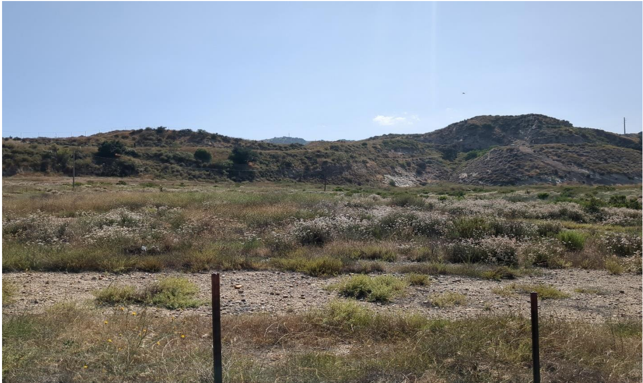
Photograph 7. Facing southeast at the western portion of the Upper Deck. This area is dominated by short podded mustard, Australian saltbush, and California buckwheat (June 23, 2025).