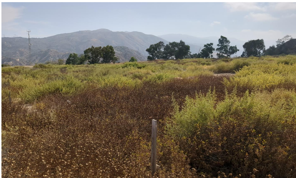
Photograph 1. Quadrat A facing northeast from southwest corner (June 23, 2025).