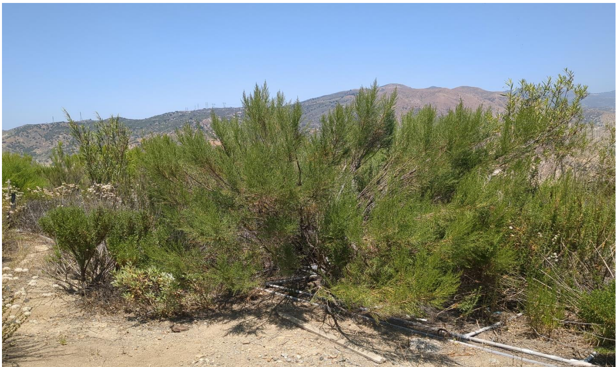
Photograph 2. Quadrat B facing northeast from southwest corner (June 23, 2025).