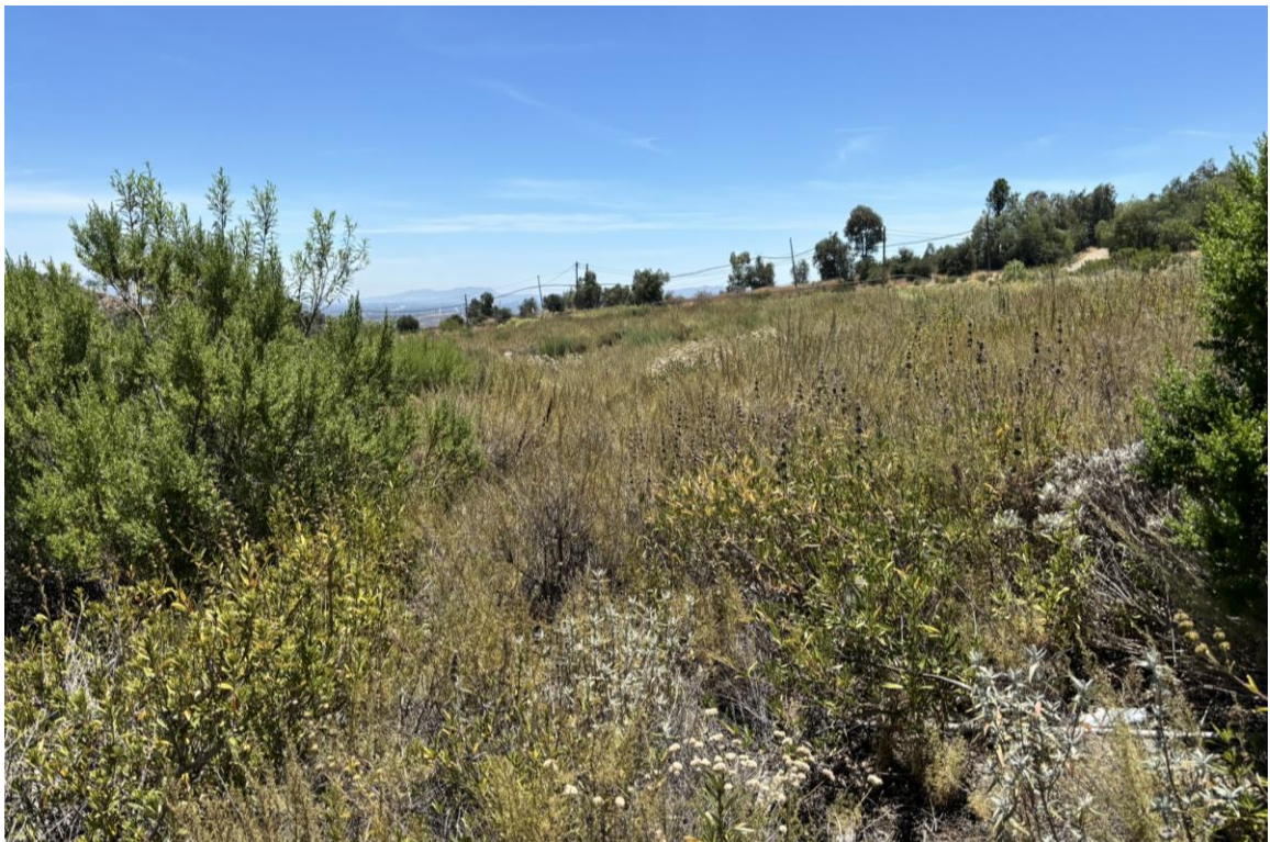
Healthy stand of Venturan CSS species growing on Deck B

ARCHITERRA DESIGN GROUP 10221-A TRADEMARK STREET, RANCHO CUCAMONGA, CA 91730 Phone (909) 484-2800, Fax (909) 484-2802