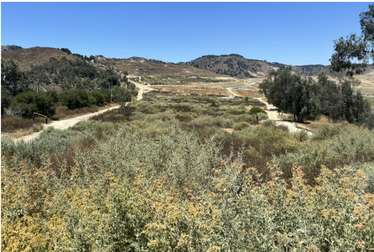
Mosaic of actively growing Venturan CSS and those going through summer dormancy