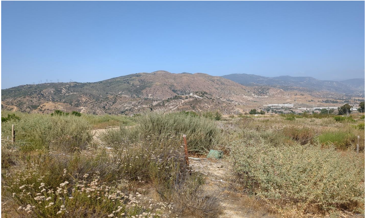
Photograph 9. Quadrat I facing northeast from southwest corner (June 23, 2025).