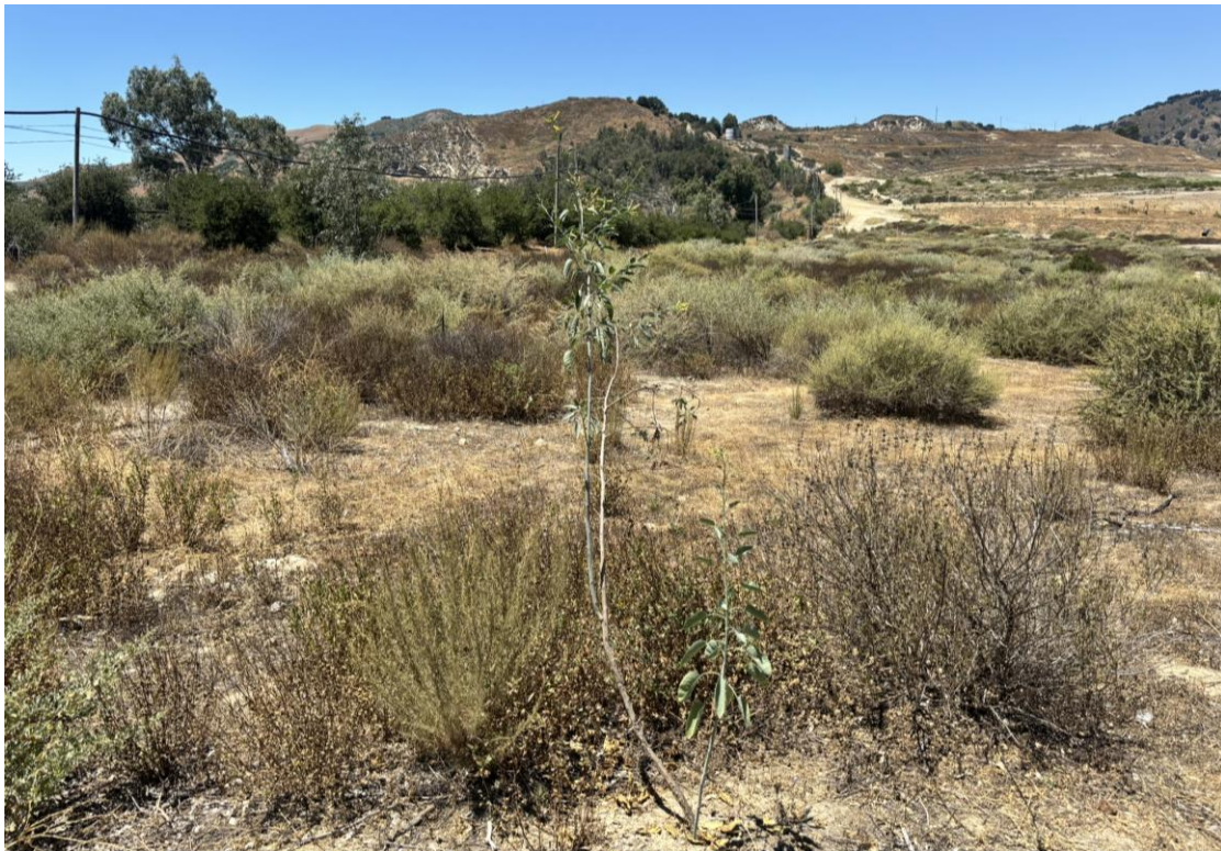
Invasive Tree Tobacco ( Nicotiana glauca )