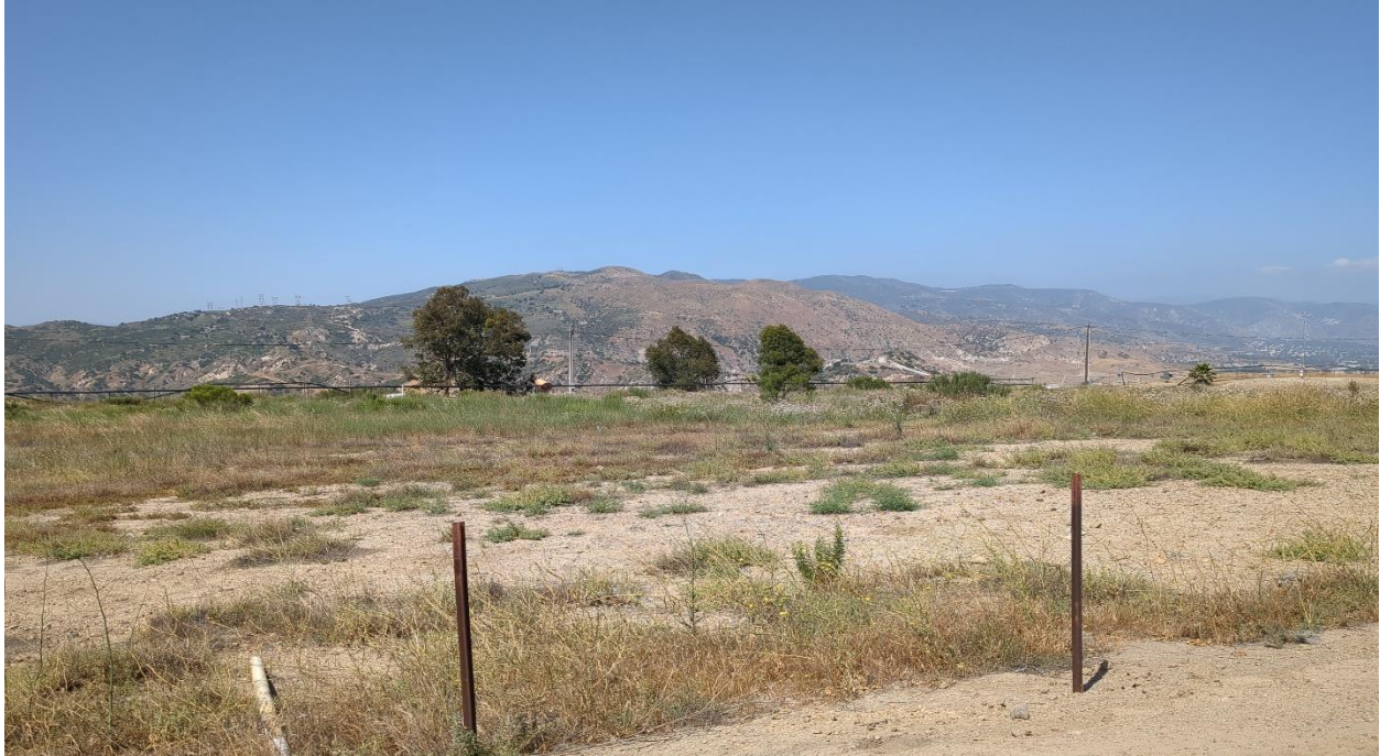
Photograph 5. Facing northeast at the Upper Deck. This area is compacted and gravelly and continues to be problematic for supporting vegetation. Non-native annual grasses and forbs, and California buckwheat shrubs are evident in the background (June 23, 2025).