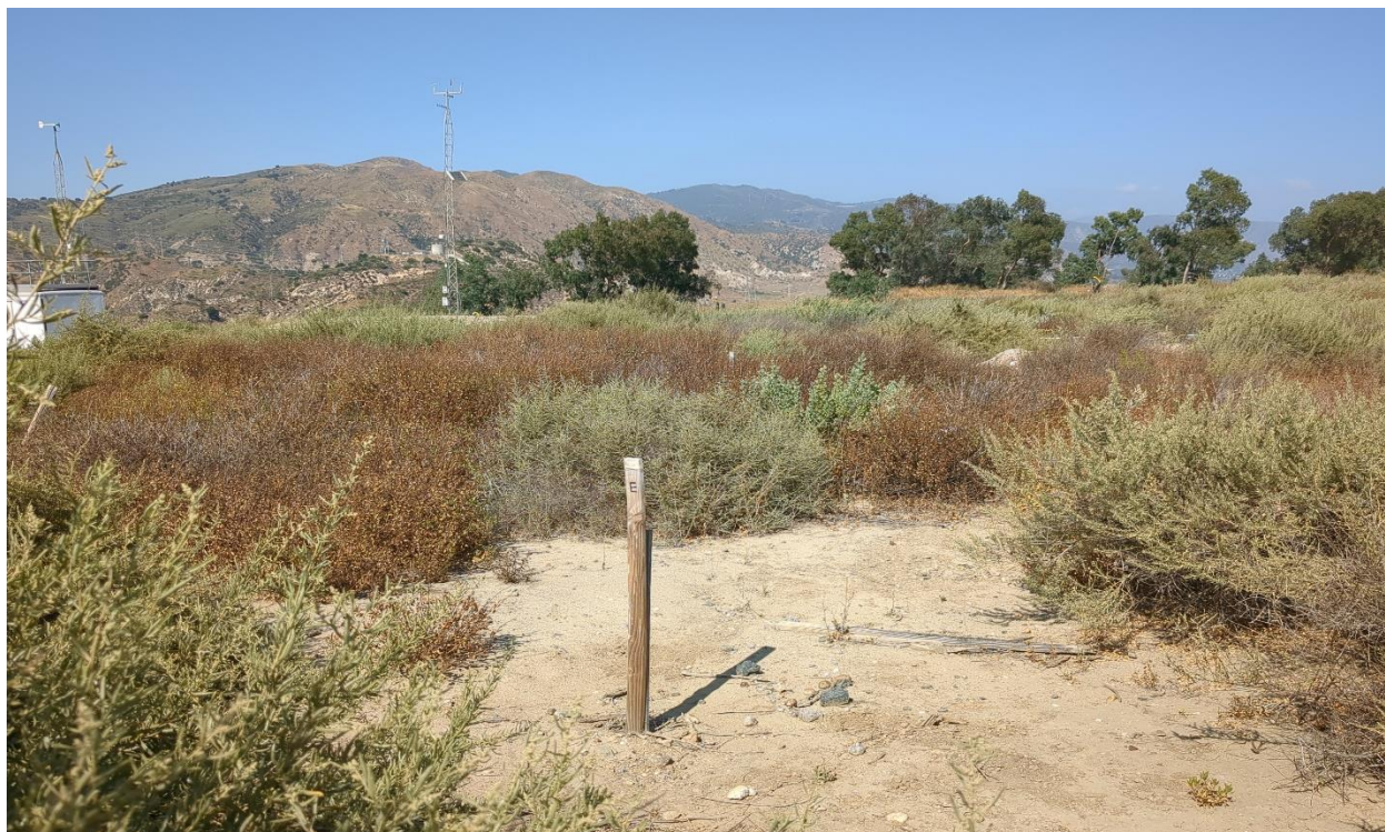
Photograph 5. Quadrat E facing northeast from southwest corner (June 23, 2025).