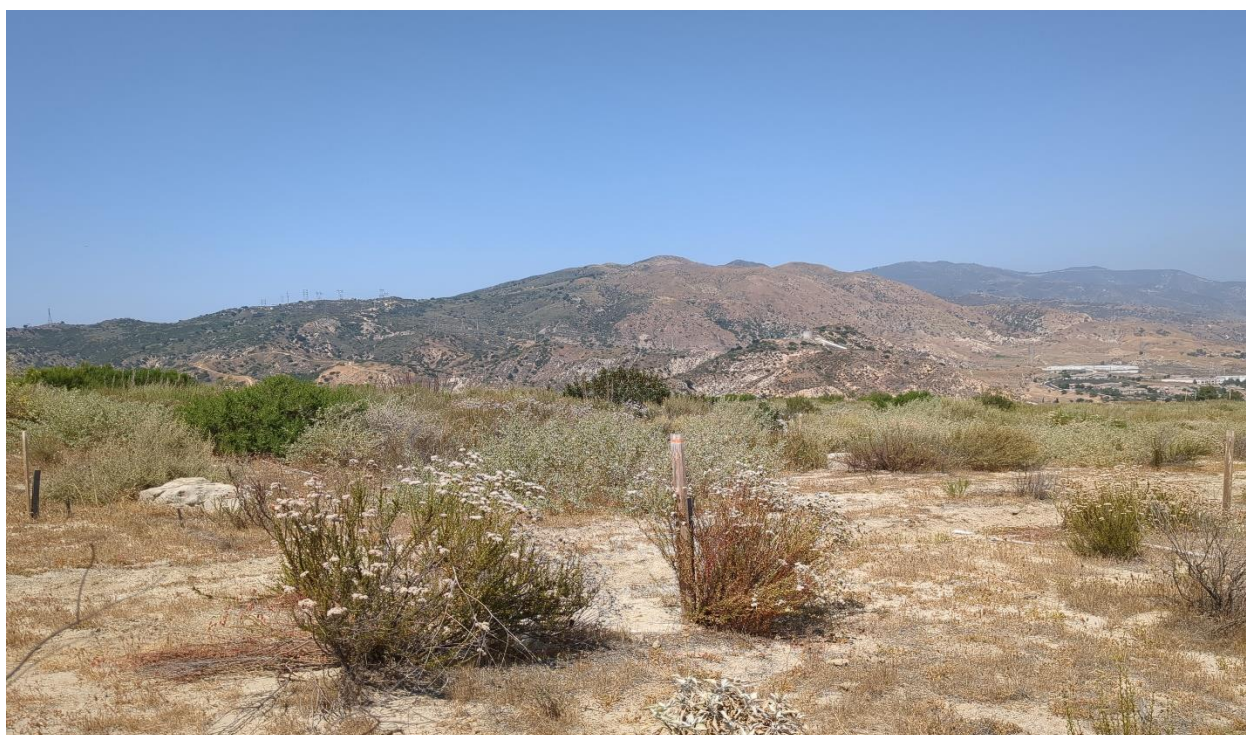
Photograph 6. Quadrat F facing northeast from southwest corner (June 23, 2025).