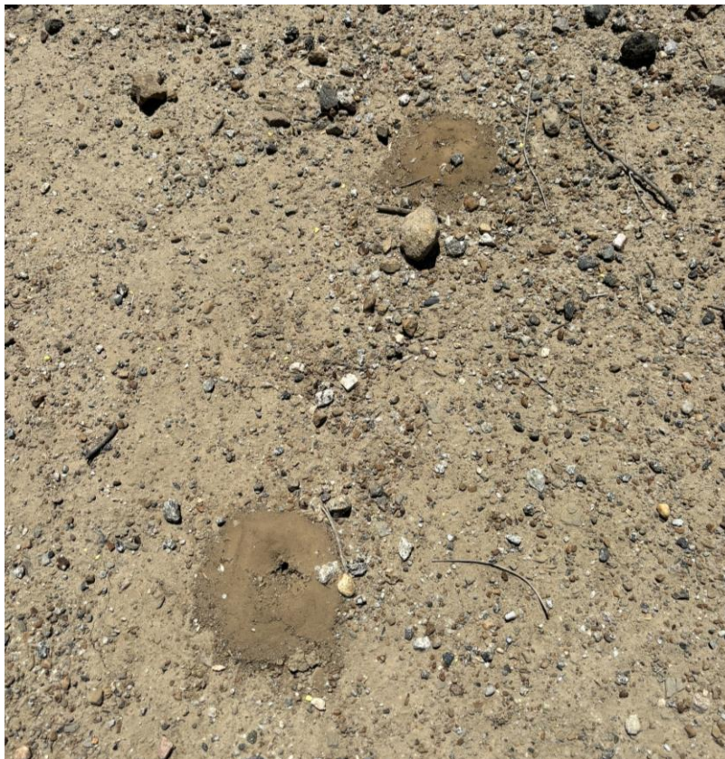
Close up of ant holes within open areas on Deck C