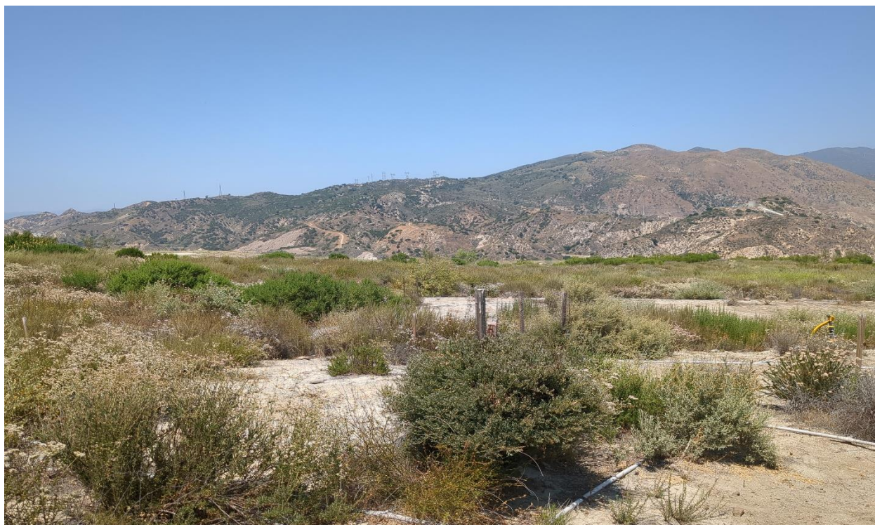
Photograph 4. Quadrat D facing northeast from southwest corner (June 23, 2025).