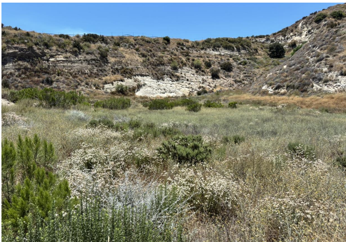
Deck A Venturan CSS intermixed with weeds on south side of the Deck