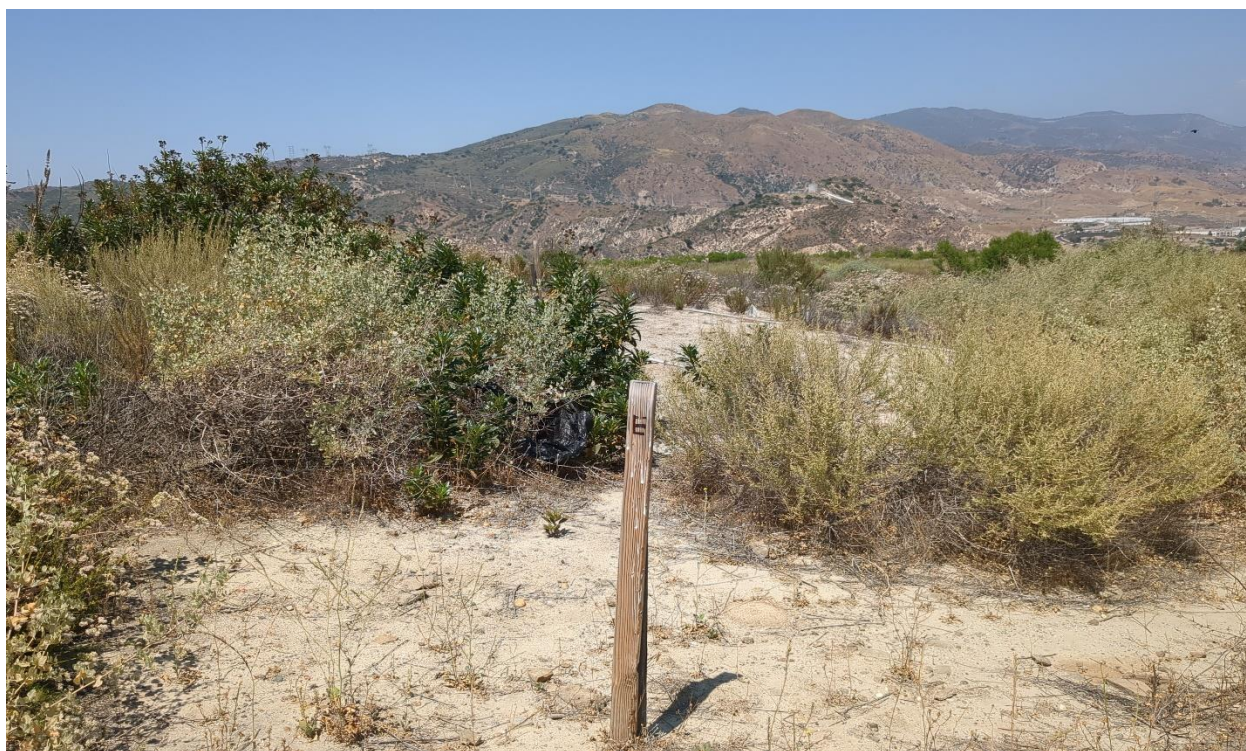
Photograph 5. Quadrat E facing northeast from southwest corner (June 23, 2025).