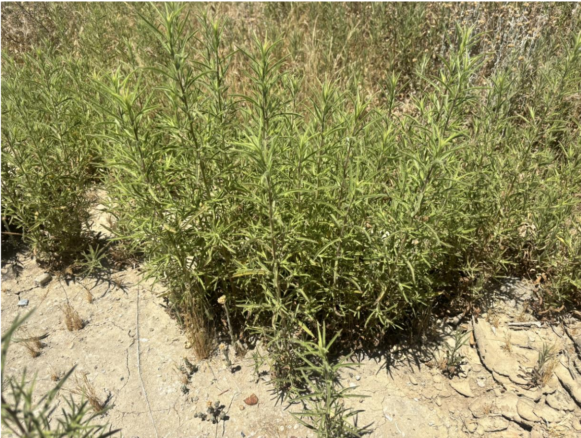
Sinkwort actively growing on Deck C