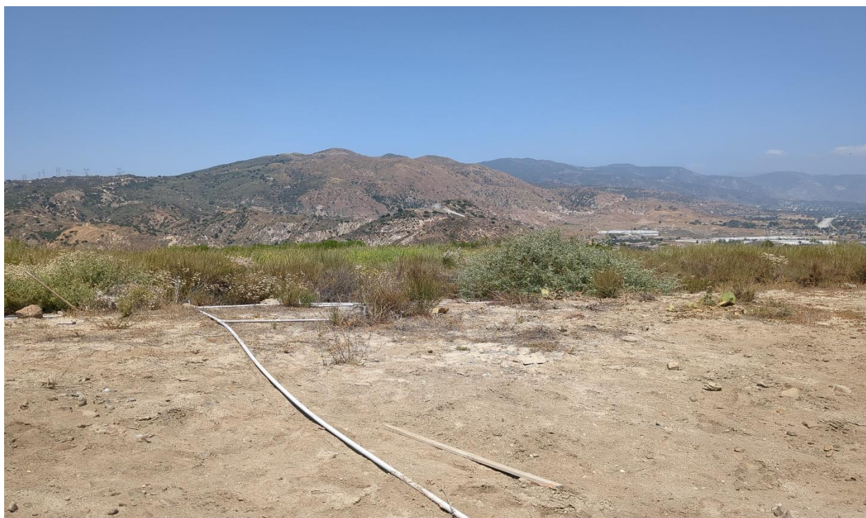
Photograph 3. Quadrat C facing northeast from southwest corner (June 23, 2025).