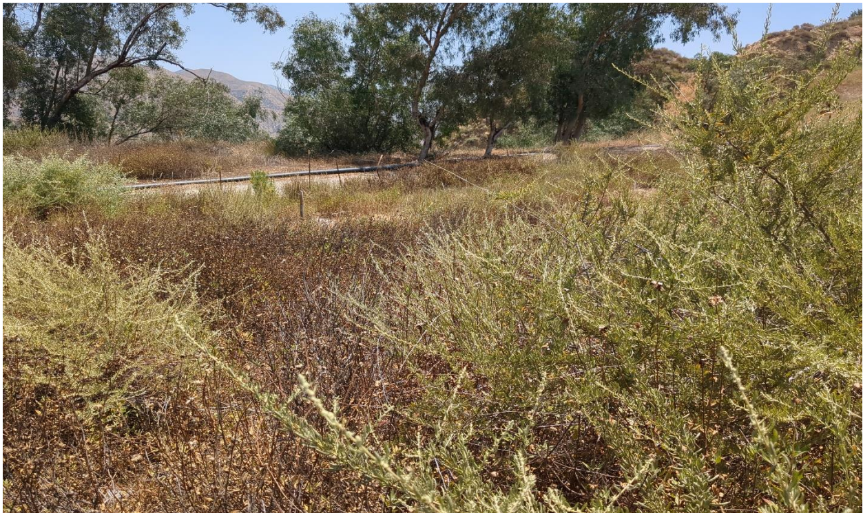
Photograph 12. Quadrat L facing northeast from southwest corner (June 23, 2025).