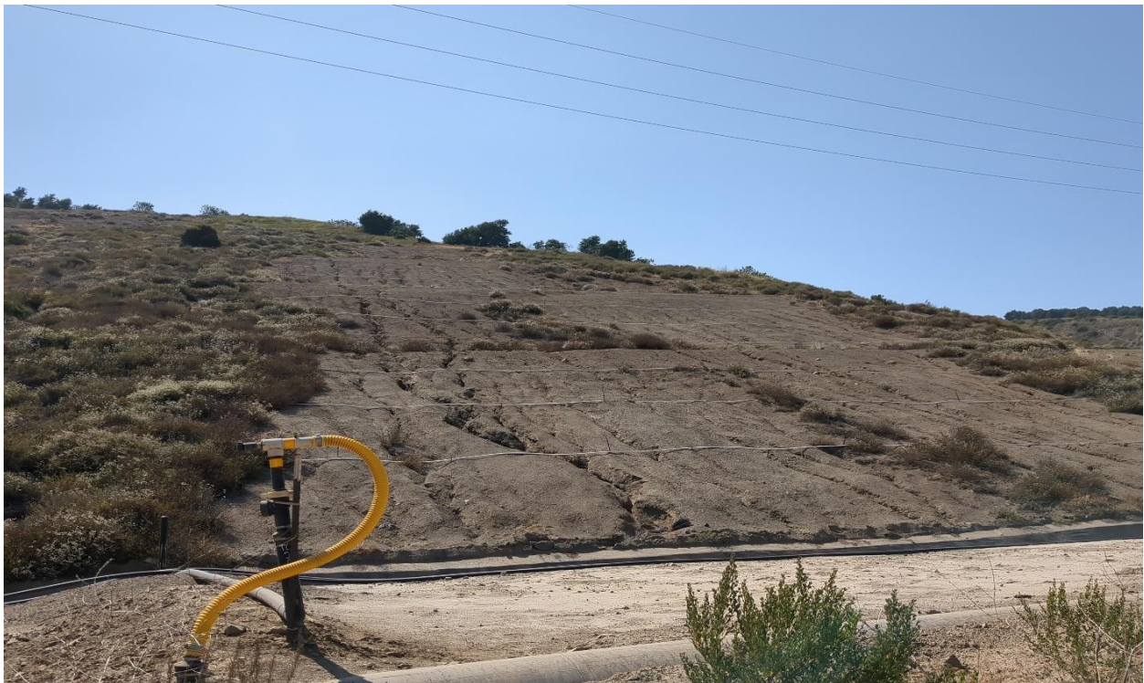
Photograph 2. Facing northwest at the northern portion of the County-Side Sage Mitigation Area where plant growth has been problematic due to poor soil conditions (June 23, 2025).