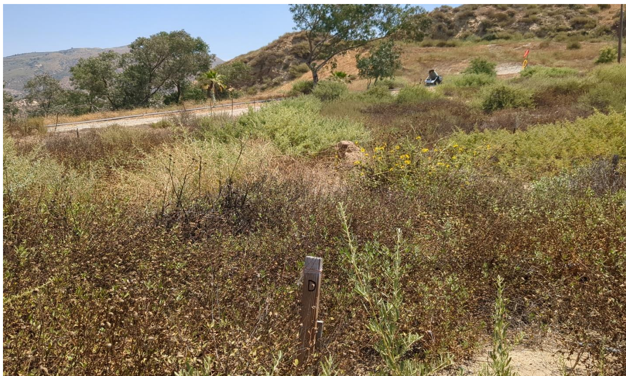
Photograph 4. Quadrat D facing northeast from southwest corner (June 23, 2025).