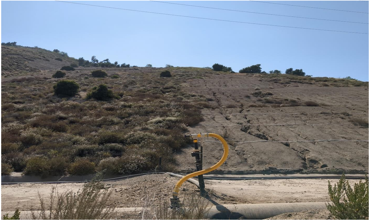
Photograph 1. Facing southwest at the County-Side Sage Mitigation Area (June 23, 2025).