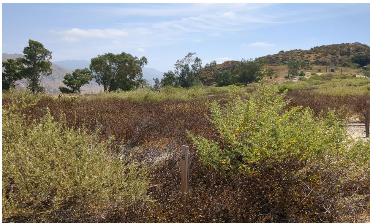
Photograph 7. Quadrat G facing northeast from southwest corner (June 23, 2025).