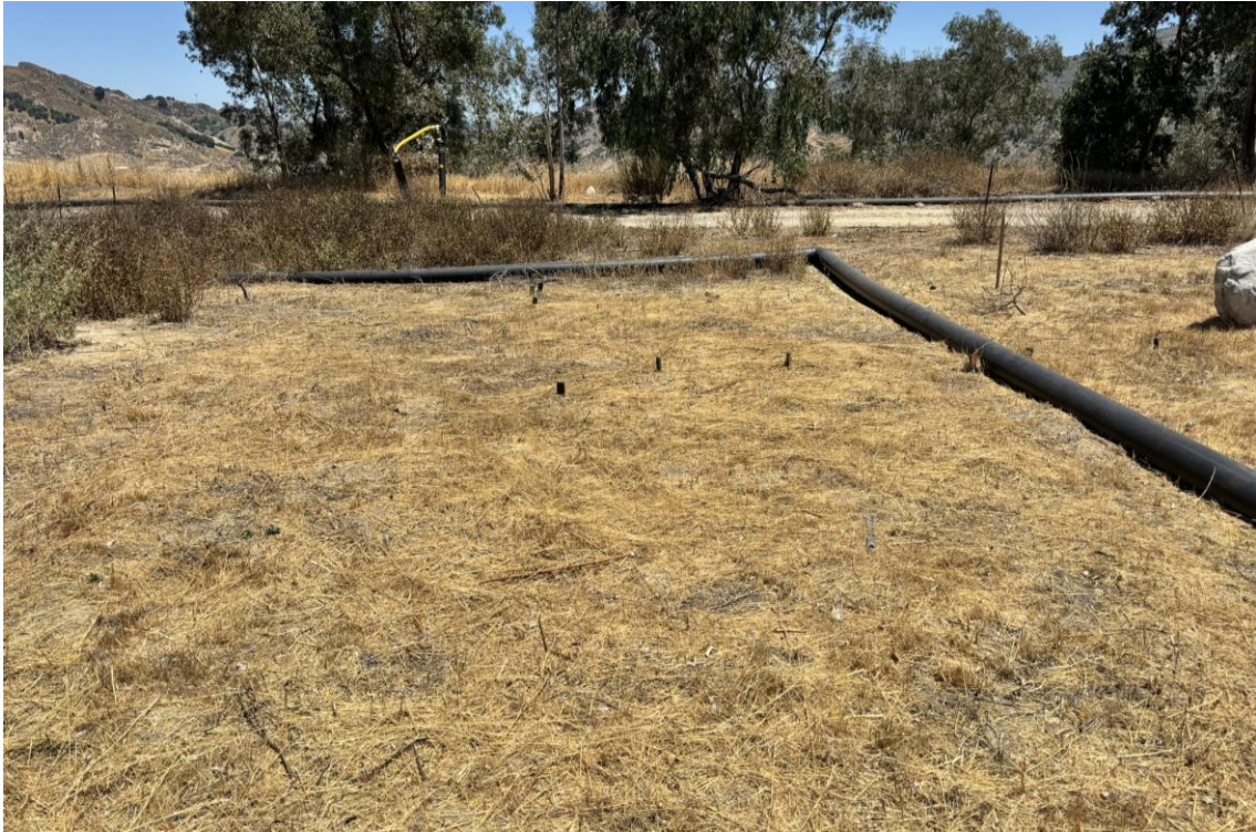
Scalped Creeping Rye Grass (improper maintenance practice)