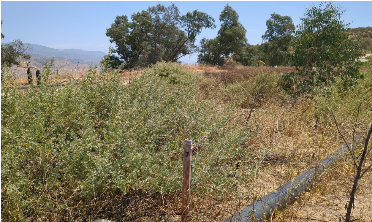
Photograph 10. Quadrat J facing northeast from southwest corner (June 23, 2025).