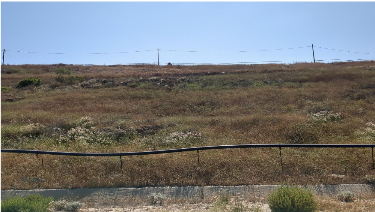
Photograph 4. Facing west at the easterly-facing slope located between the Middle and Upper decks. The vegetation on the slopes between the Middle and Upper Deck is dominated by California buckwheat (currently flowering) and non-native annual grasses (June 23, 2025).