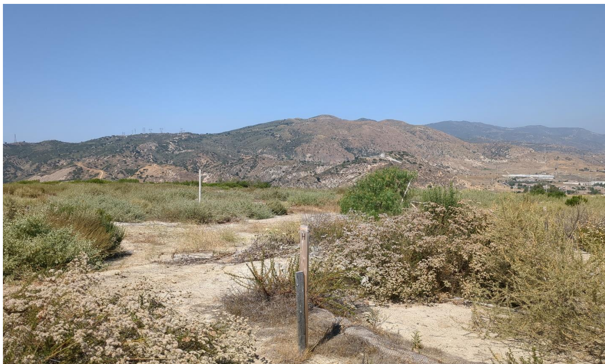
Photograph 8. Quadrat H facing northeast from southwest corner (June 23, 2025).