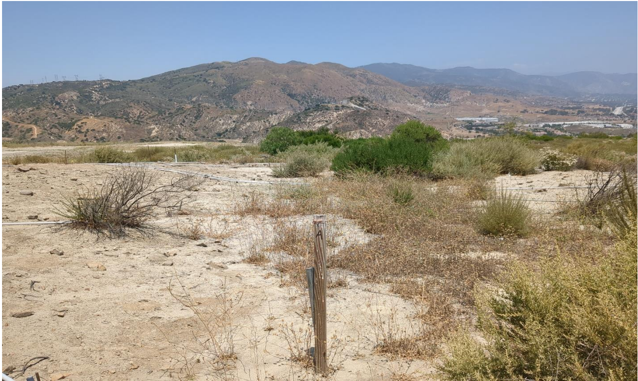
Photograph 1. Quadrat A facing northeast from southwest corner (June 23, 2025).