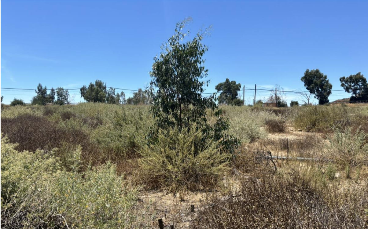
Eucalyptus species (to be removed), approximately 15' in height