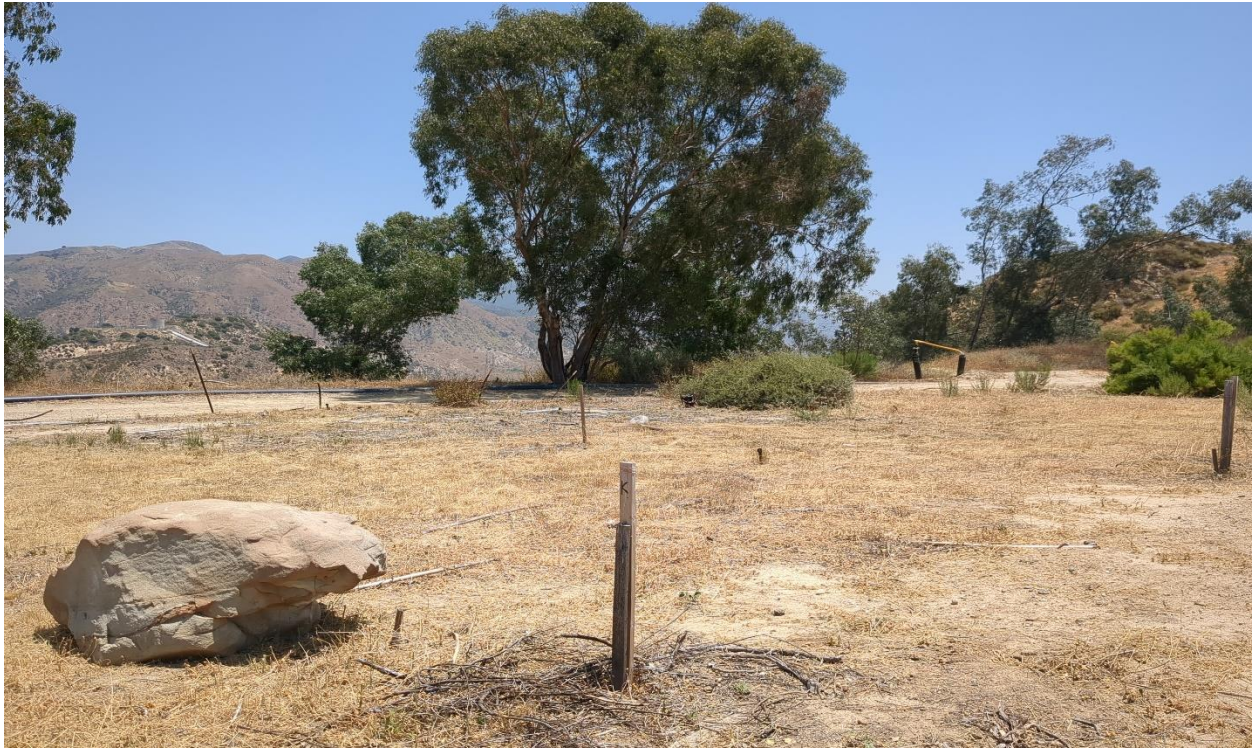
Photograph 11. Quadrat K facing northeast from southwest corner (June 23, 2025).