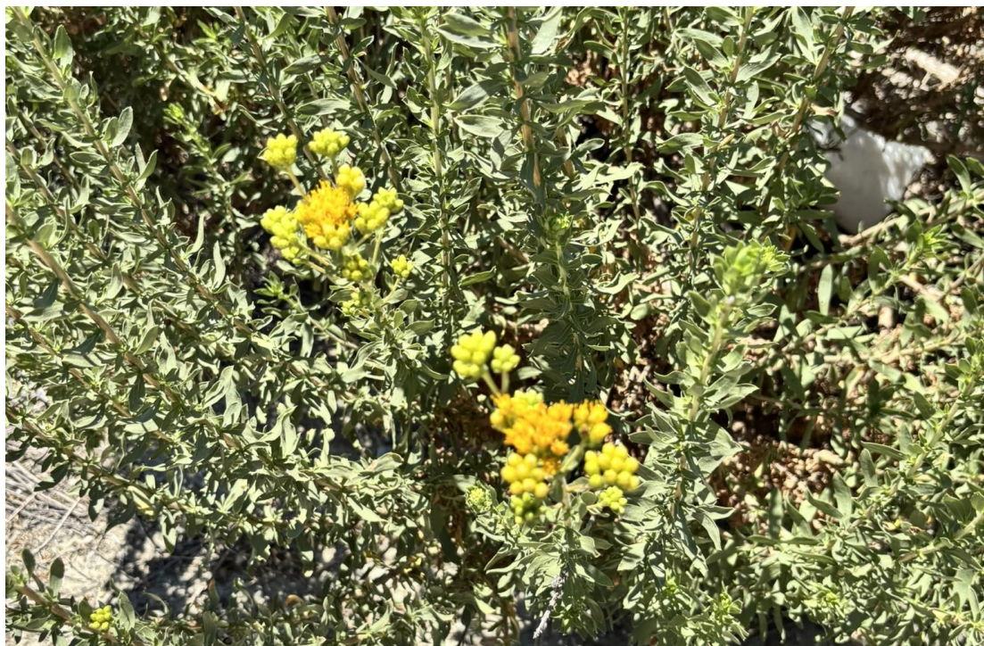
Menzies Goldenbush ( Isocoma menziesii ) starting its summer blooming period