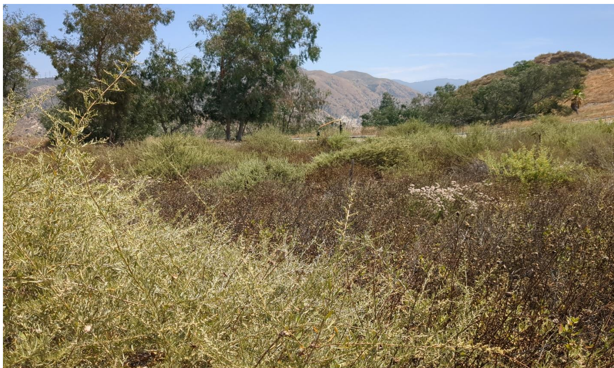
Photograph 8. Quadrat H facing northeast from southwest corner (June 23, 2025).