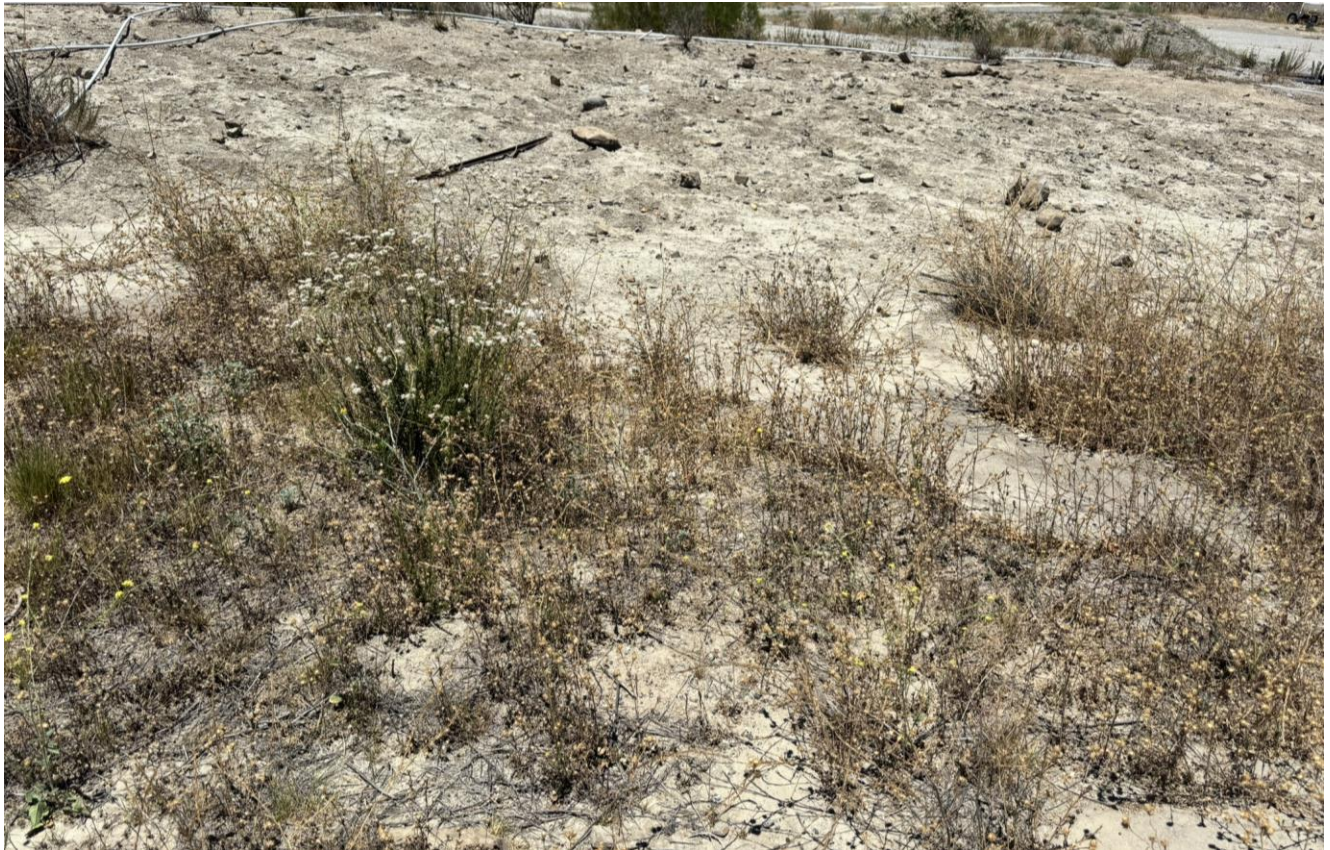
Invasive Shortpod Mustard ( Hirschfeldia incana ) and Yellow Star Thistle ( Centaurea solstitialis ) actively growing near California Buckwheat ( Eriogonum fasciculatum )