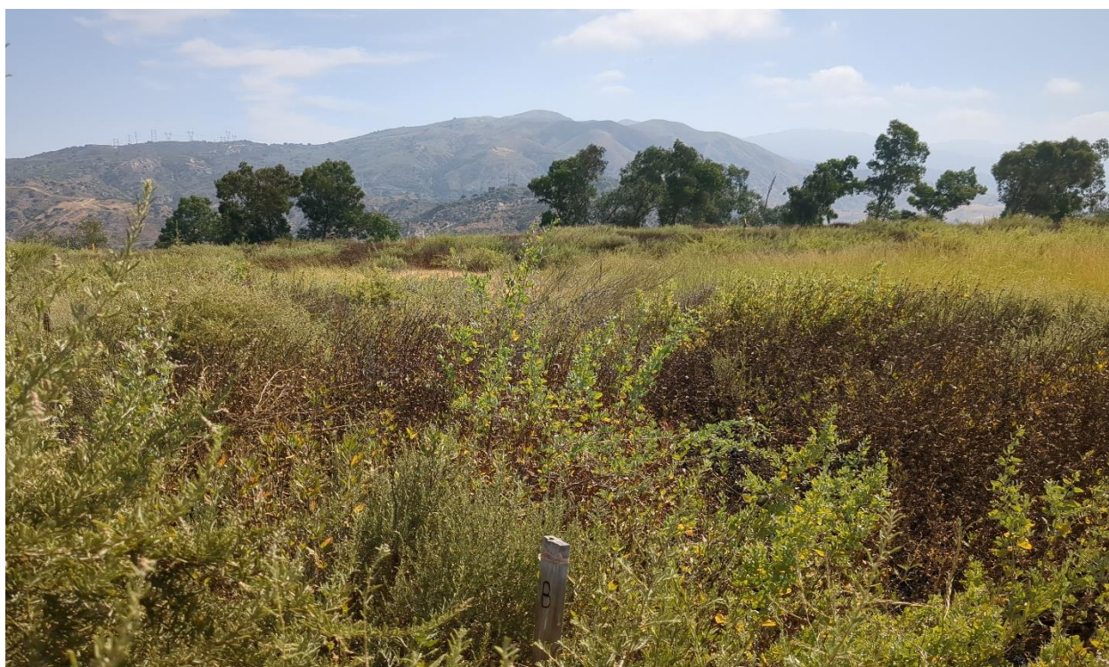
Photograph 2. Quadrat B facing northeast from southwest corner (June 23, 2025).