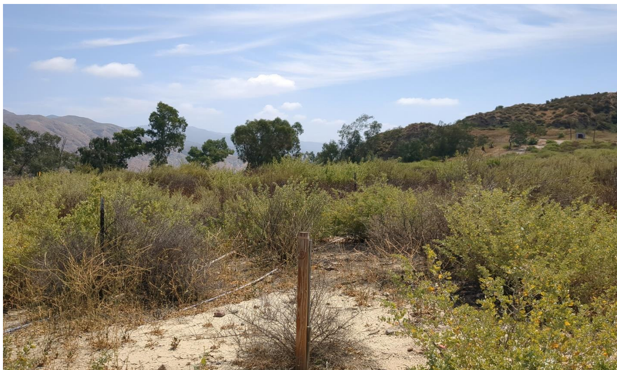
Photograph 6. Quadrat F facing northeast from southwest corner (June 23, 2025).