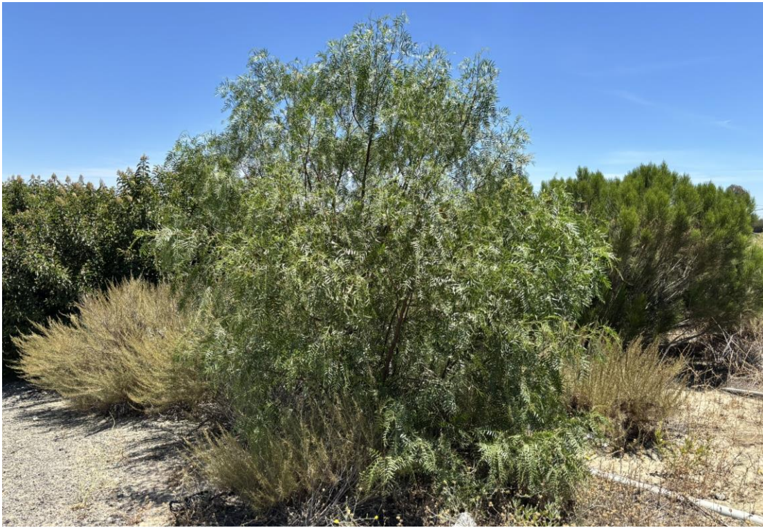
Invasive California Pepper Tree ( Schinus molle ) near helicopter pads that needs to be removed