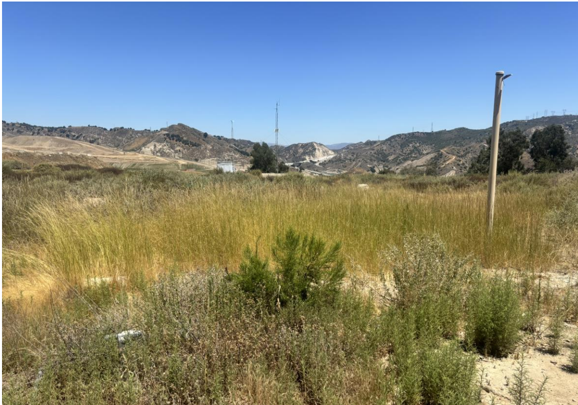
Reestablished Creeping Rye Grass left to naturalize (proper maintenance practice)