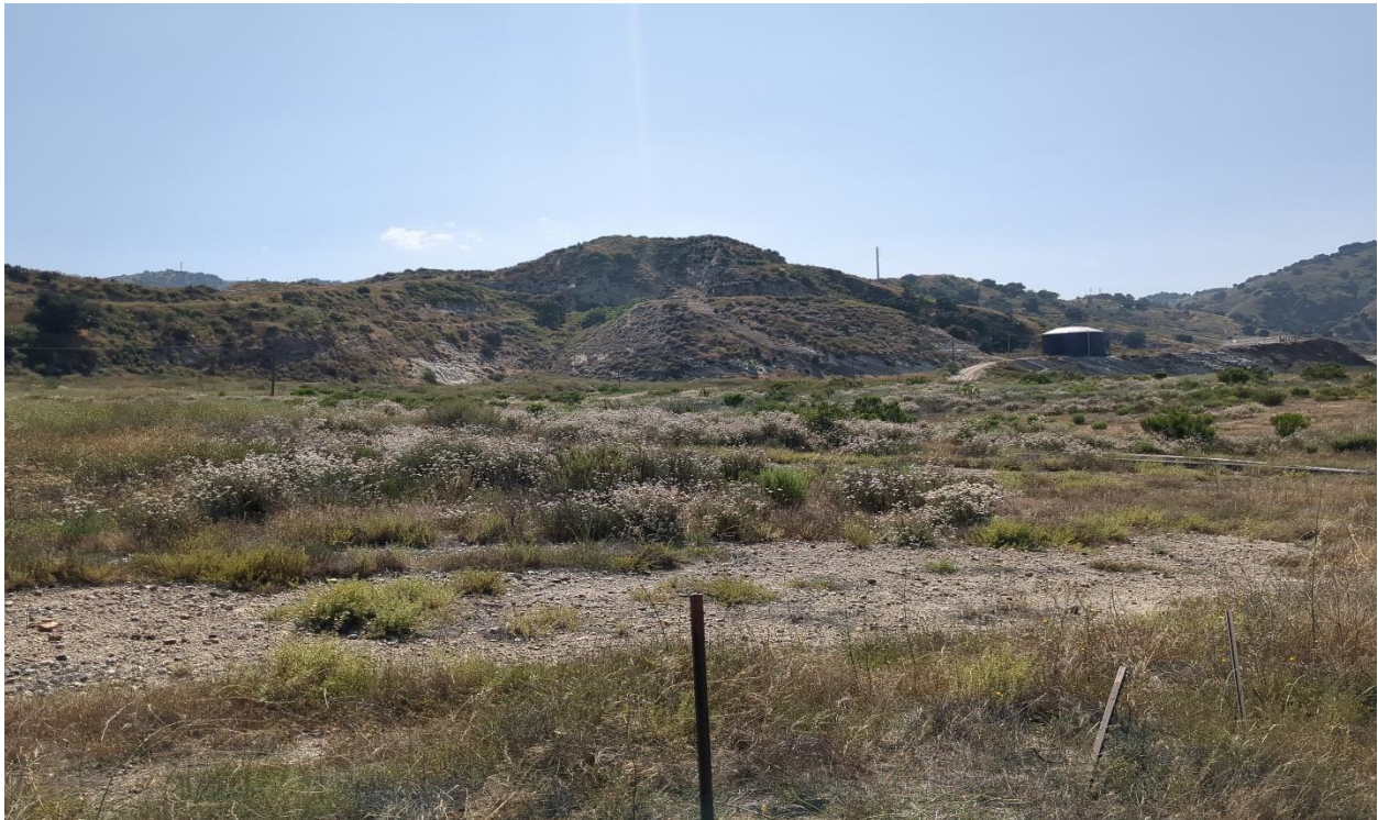
Photograph 6. Facing southwest at the Upper Deck. This area is primarily dominated by California buckwheat, wild oats, brome grasses, and short podded mustard (June 23, 2025).