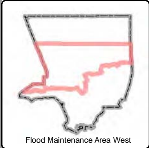
Flood Maintenance Area West

Data contained in this map is produced in whole or part from the Los Angeles County Department of Public Works precise databases.