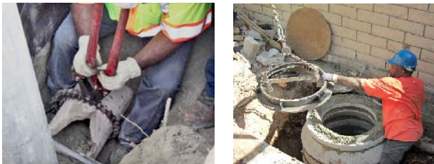
Construction workers are fixing sewer pipe (left) and adjusting manhole to surface level (right).

Besides inspecting and cleaning, we also have construction crews that construct/repair manholes and sewer lines.