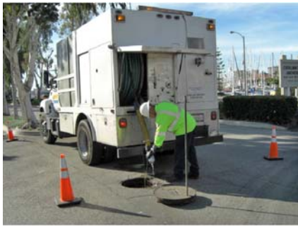
Inspection Crew at work

To provide 24-hour service to respond to complaints from citizens, such as sewer overflows, flood outs, odors, insects, and rodents, etc.