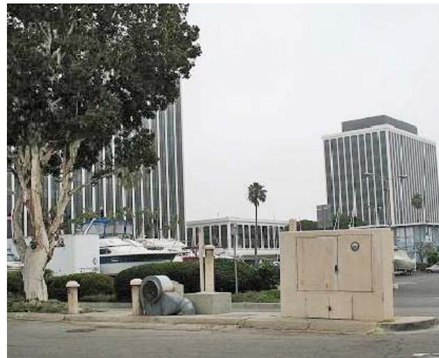
Pump Station in Marina del Rey

OLD PILLS PILING UP? No Drugs Down the Drain Please!