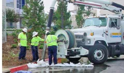
Workers using a hydro vacuum truck to clean up overflow from street surface.

Our cleaning crews usually do a planned periodic cleaning of sewers known to accumulate grease, garbage grindings, or root growth either on a monthly, quarterly, or semi-annual basis. Gas trap and drop manholes are usually cleaned at the time of inspections.