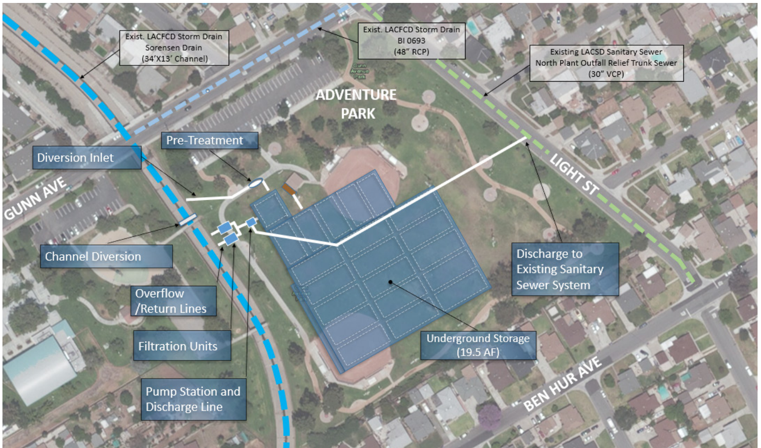
Underground Stormwater Capture Treatment System