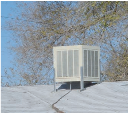
Turn off the water to your sump cooler and drain the supply line and cooler reservoir.

To prepare for the potentially freezing weather, make sure you insulate any and all exposed pipes. Insulating exposed pipes will reduce the possibility of waking to find that you have no water to shower or make coffee. Freezing can also cause pipes to split and then leak once the ice in the pipes thaws, which could escalate into a costly repair or flooding in your kitchen or bathroom if you leave the house with the taps left on.