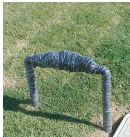
Visit your local home improvement store, purchase an insulation kit and insulate all exposed pipes.