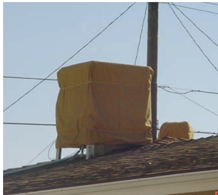
Cover your sump cooler for the winter.