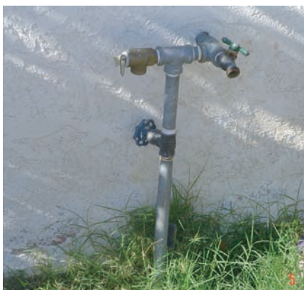
Insulate exposed pipes, sprinkler valves and backflow devices.